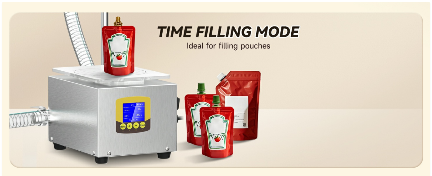
Figure 5.3: The machine in Time Filling Mode, shown filling flexible pouches, which is ideal for this method.

This mode fills containers for a set duration, suitable for consistent volume filling, especially for pouches.