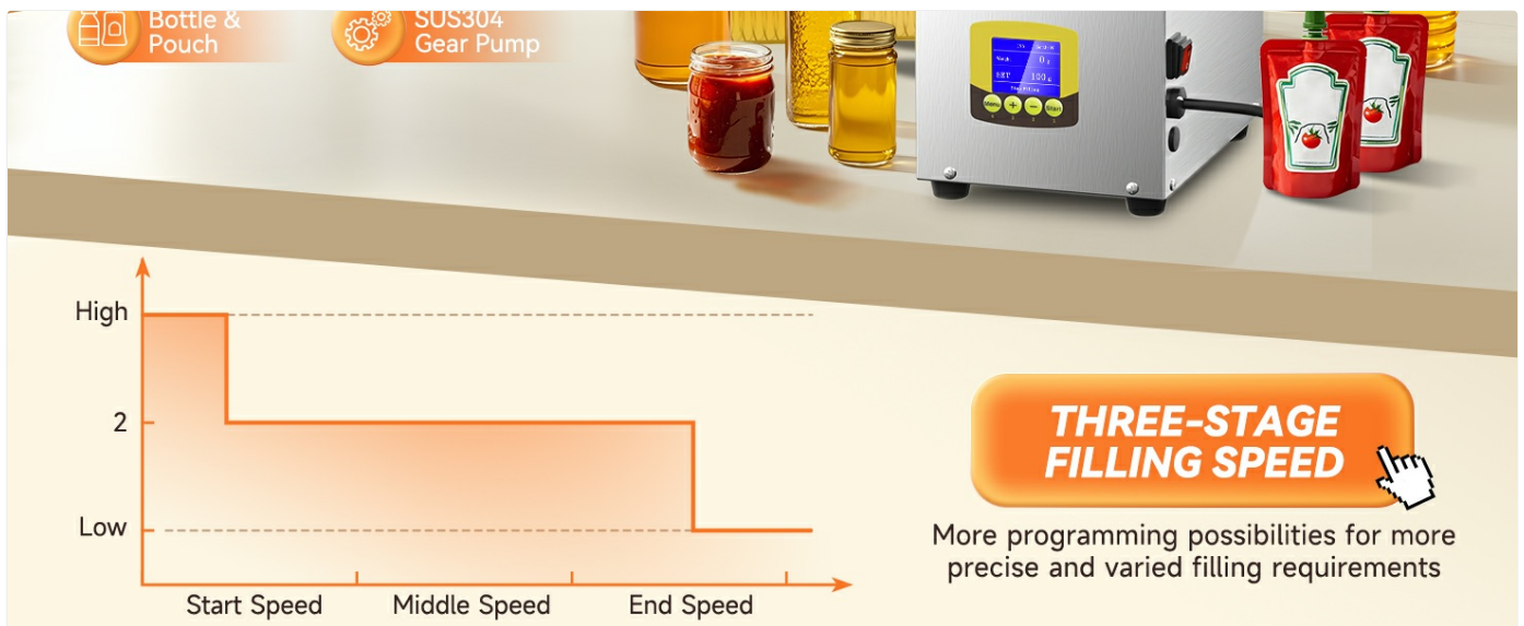
Figure 5.4: A graph depicting the three-stage filling speed: a high initial speed, a middle speed, and a low final speed for precision and anti-drip control.

The three stages are: Start Speed (High), Middle Speed, and End Speed (Low). You can adjust the duration and intensity of each stage via the control panel settings to optimize for different liquid viscosities and container types. This ensures a fast initial fill and a slow, precise finish to prevent overfilling and dripping.