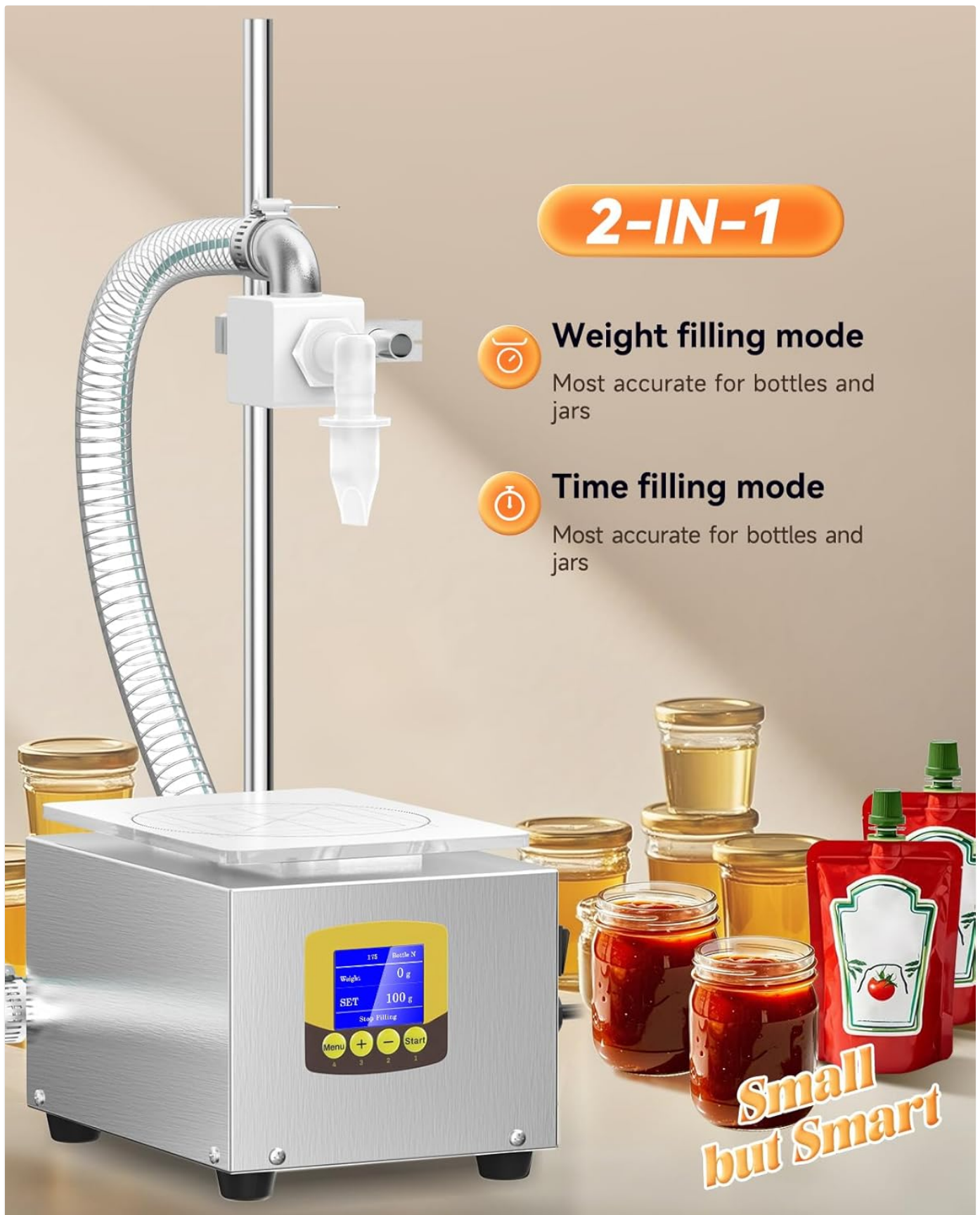
Figure 5.1: Overview of the machine's dual operating modes: Weight filling for precise quantity by mass, and Time filling for consistent duration of flow.