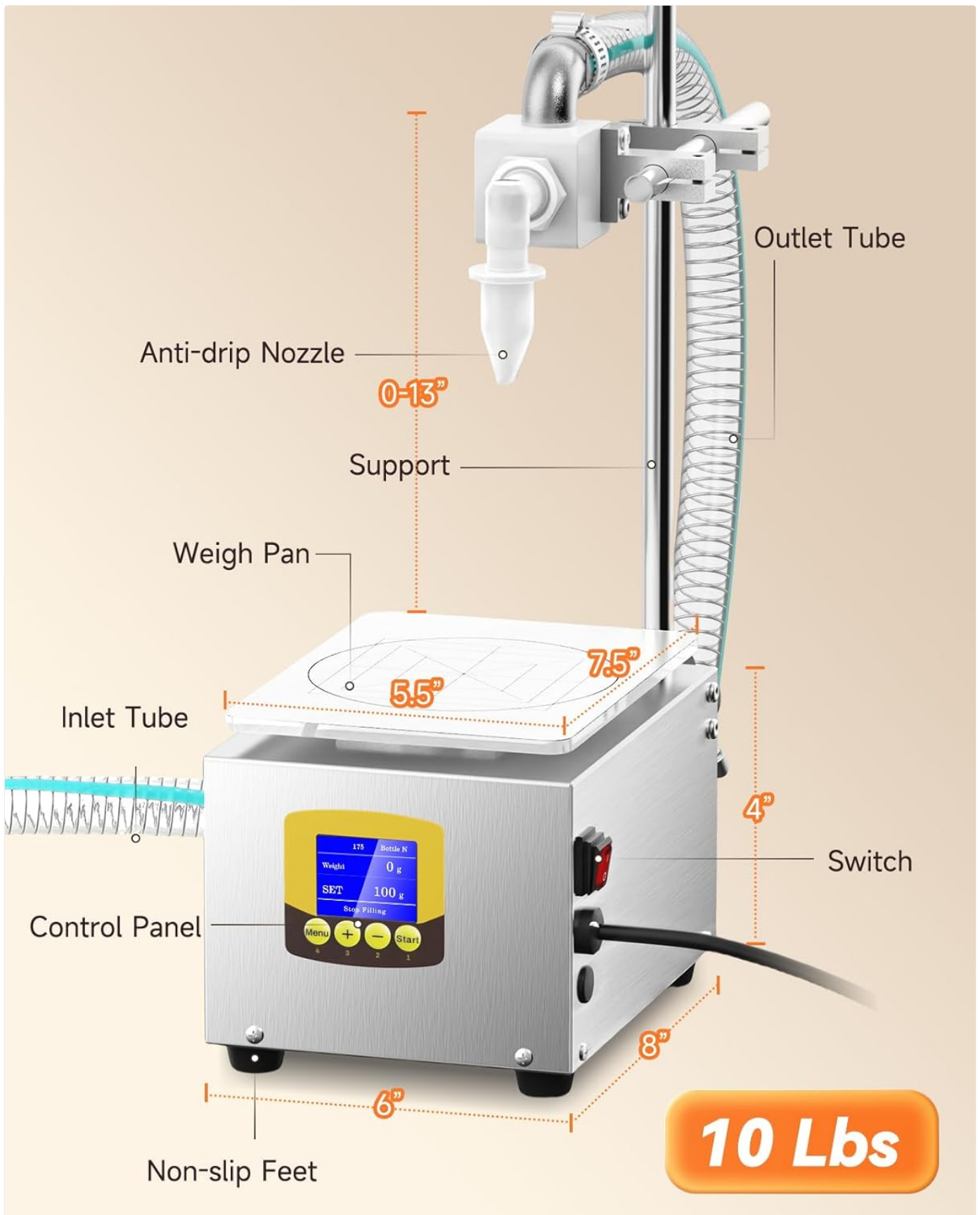
Figure 3.1: Labeled diagram of the Moonshan MS-HFM-5K filling machine, showing the control panel, weigh pan, anti-drip nozzle, inlet and outlet tubes, support rod, and power switch. Dimensions are also indicated.