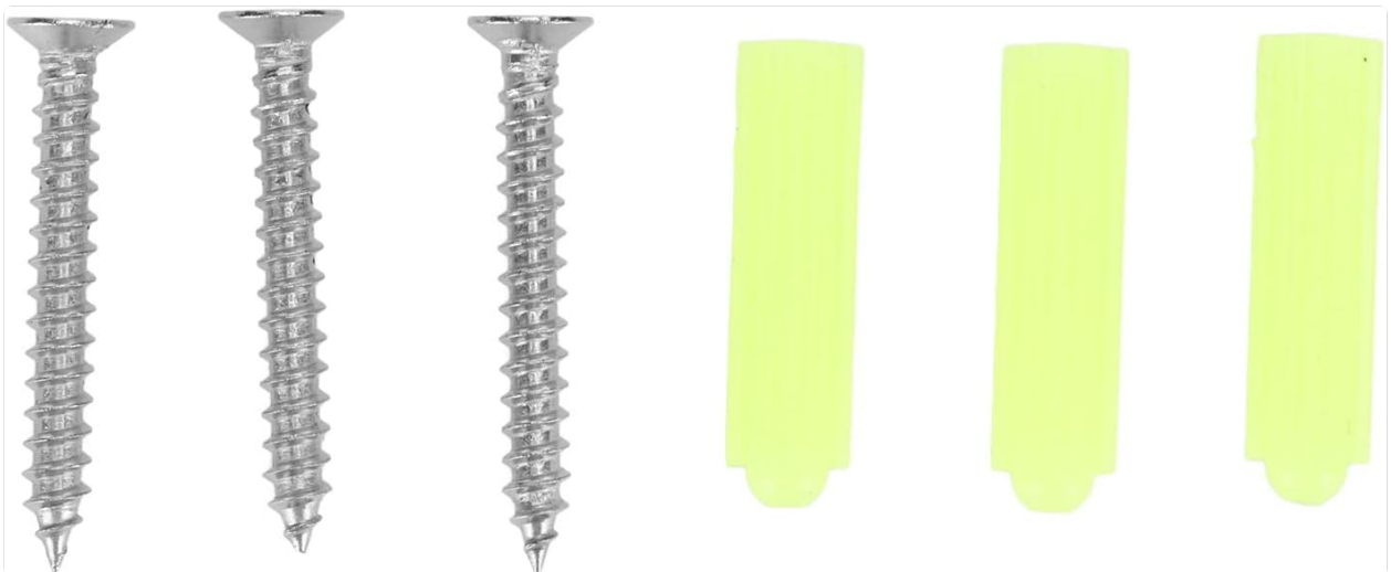
Image: A close-up view of the three metal screws and three yellow plastic expansion tubes, which are essential for mounting the bracket.