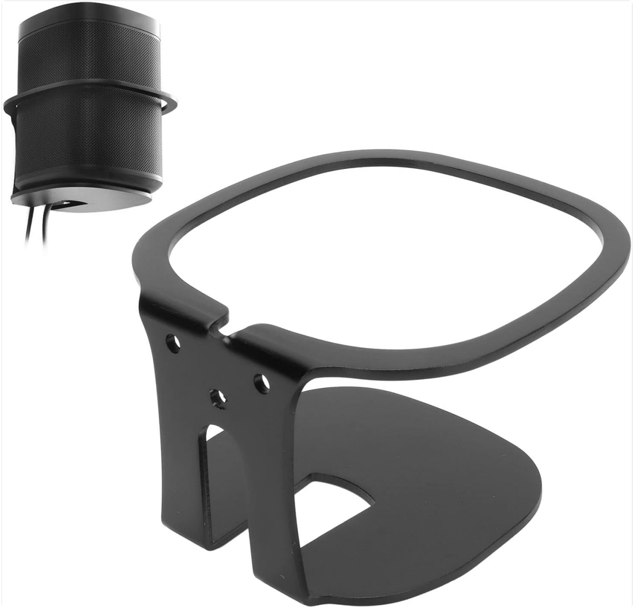
Image: The flexman speaker wall mount bracket shown installed on a wall, with a speaker placed securely within it, demonstrating the final setup.