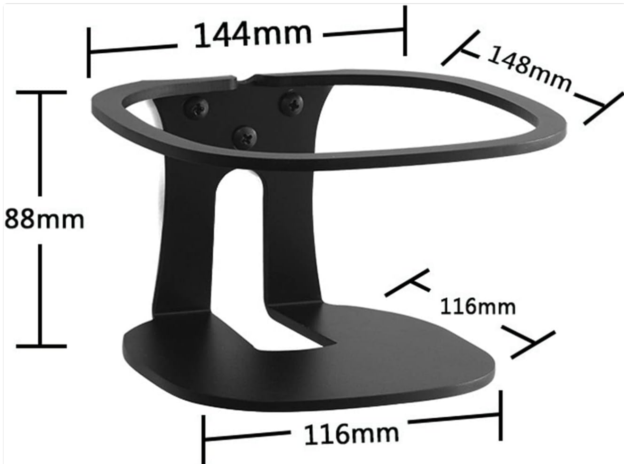
Image: Technical drawing showing the dimensions of the flexman speaker wall mount bracket in millimeters (e.g., 144mm width, 88mm height, 148mm depth, 116mm base width and depth).