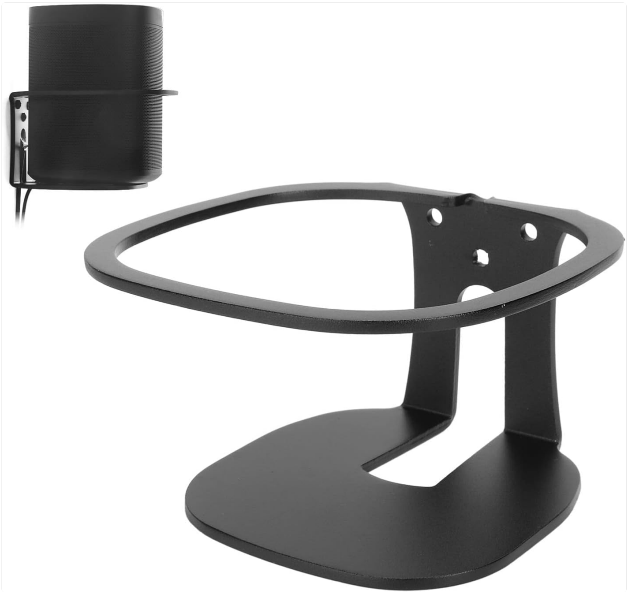
Image: Another perspective of the flexman speaker wall mount bracket, highlighting its secure attachment to the wall and the space for cable management.