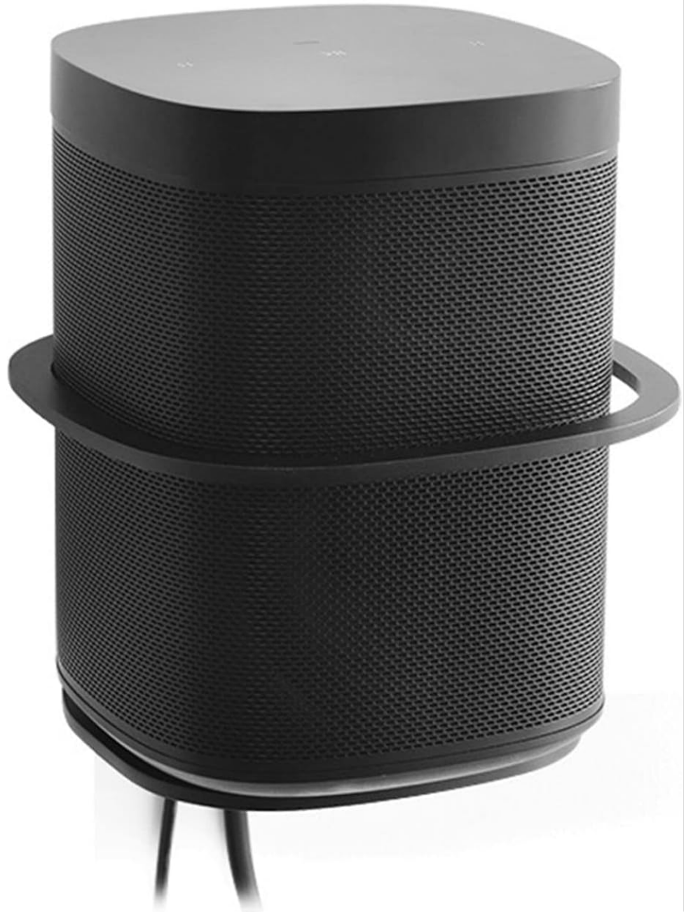
Image: A speaker perfectly fitted into the flexman wall mount, demonstrating its dedicated design for compatible speaker models.

Dedicated design specifically designed for ONE, for ONE SL and for PLAY:1 speakers