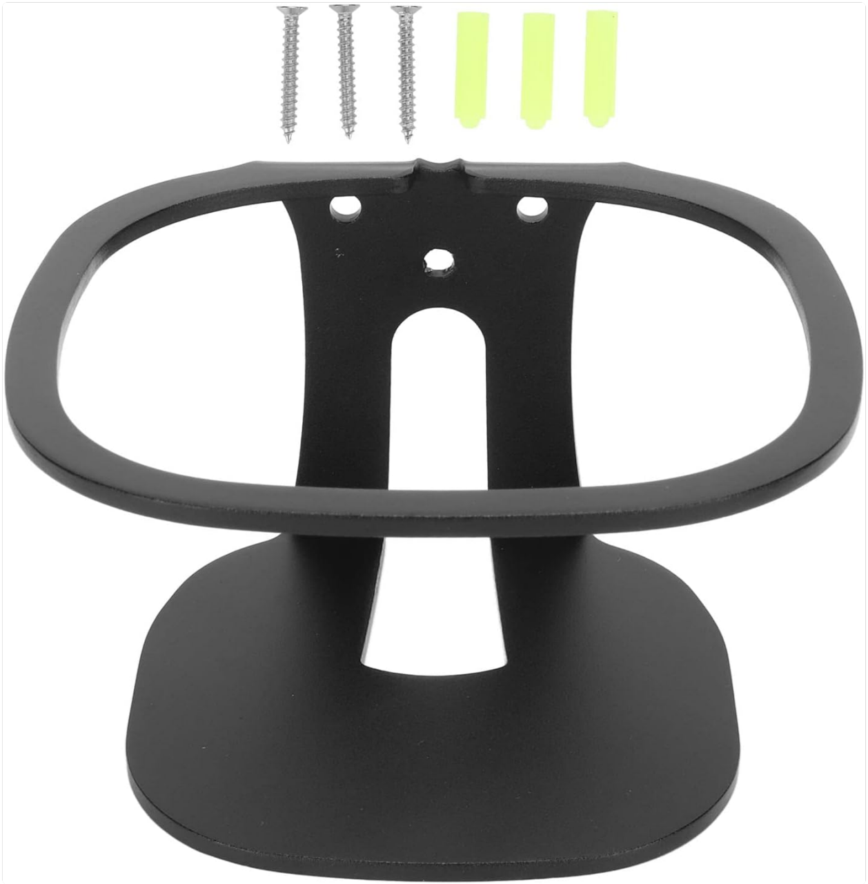
Image: The flexman speaker wall mount bracket shown with the three screws and three expansion tubes included in the package.