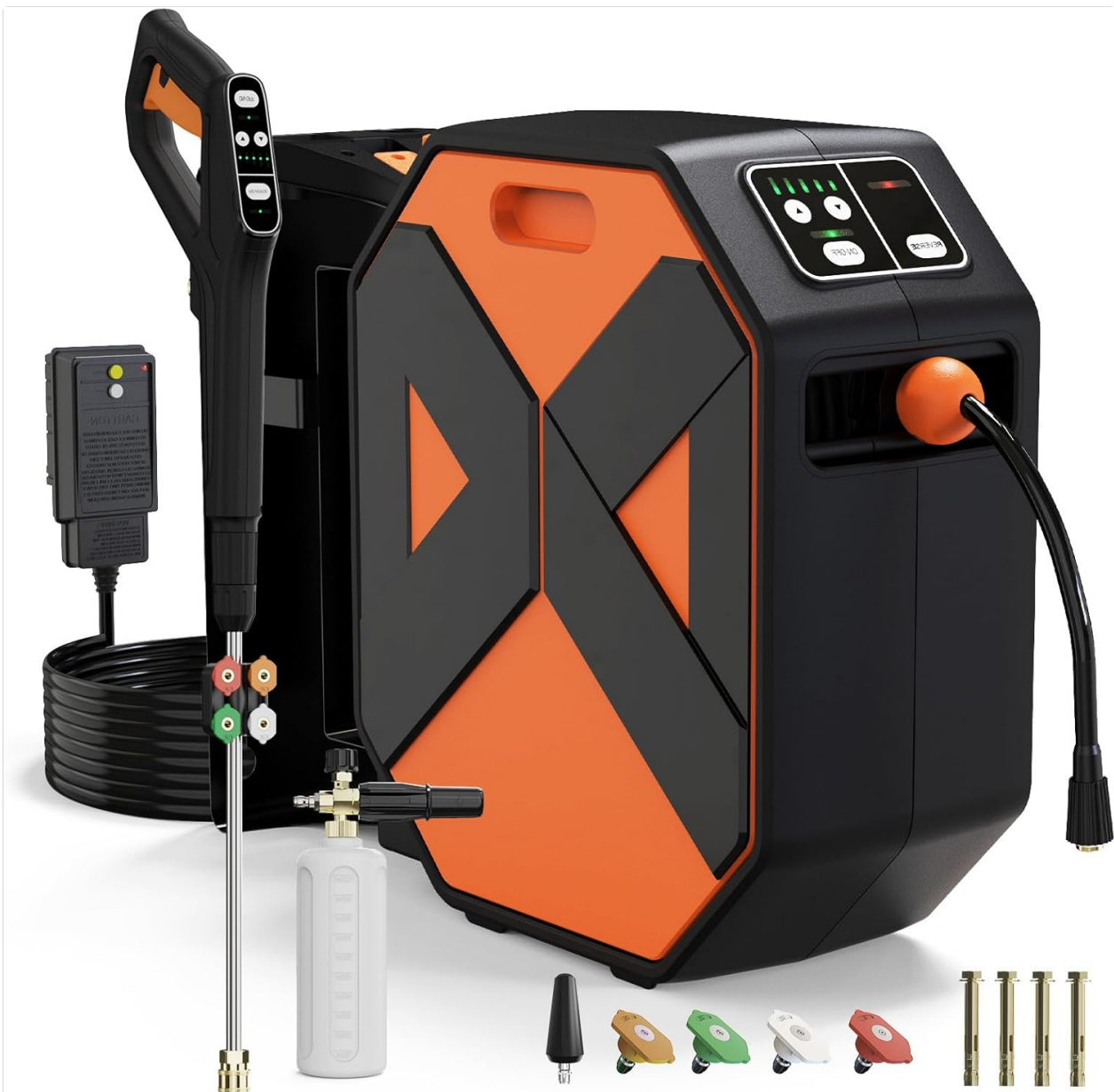
Image: The Buyplus Wall Mounted Pressure Washer unit with its included accessories, including the pressure washer gun, foam cannon, various nozzles, and mounting hardware.