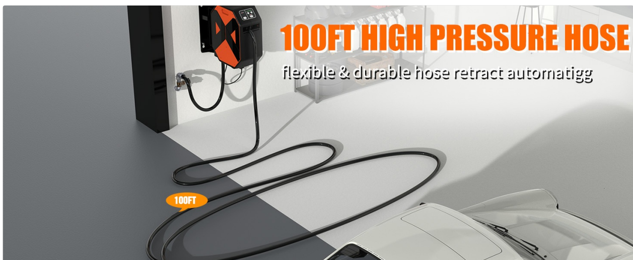
Image: The 100-foot high-pressure hose fully extended from the wall-mounted unit, demonstrating its flexible and durable design for automatic retraction.