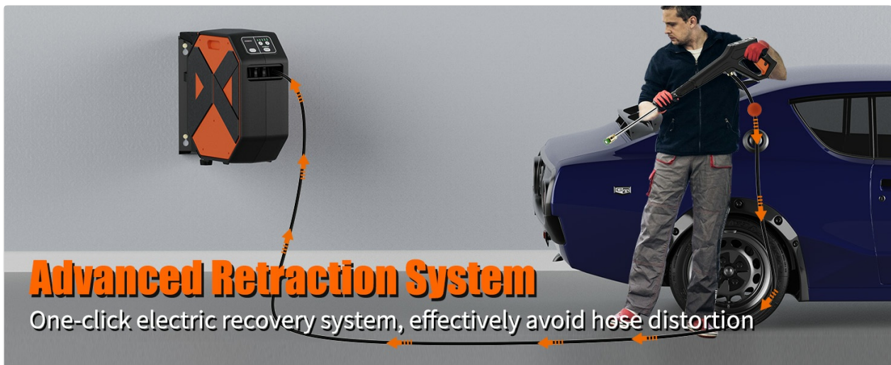
Image: An illustration of the advanced electric recovery system for the pressure washer hose, designed to prevent distortion and ensure smooth retraction.