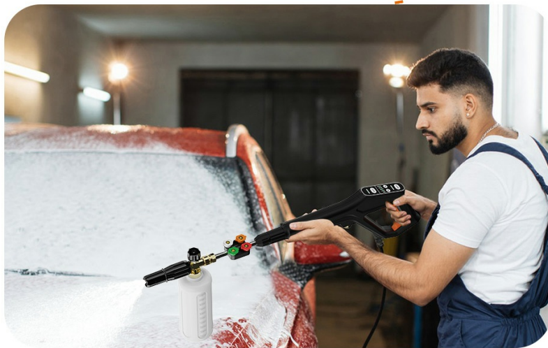
Image: A user applying foam to a car using the included soap bottle (foam cannon) attached to the pressure washer gun.

5000 PSI Max Pressure 3.2 GPM Water Flow 1800 W Motor Power