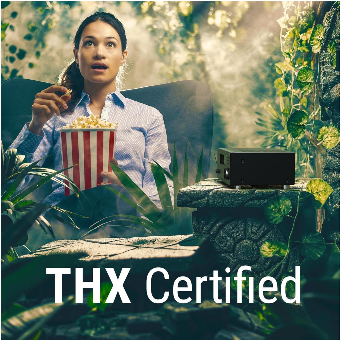
Image: A visual representation highlighting the THX Certified feature, indicating high-fidelity audio performance.

The TX-RZ50 supports various sound modes, including THX Certified and IMAX Enhanced, to provide a cinematic audio experience. Explore these modes through the on-screen display menu.