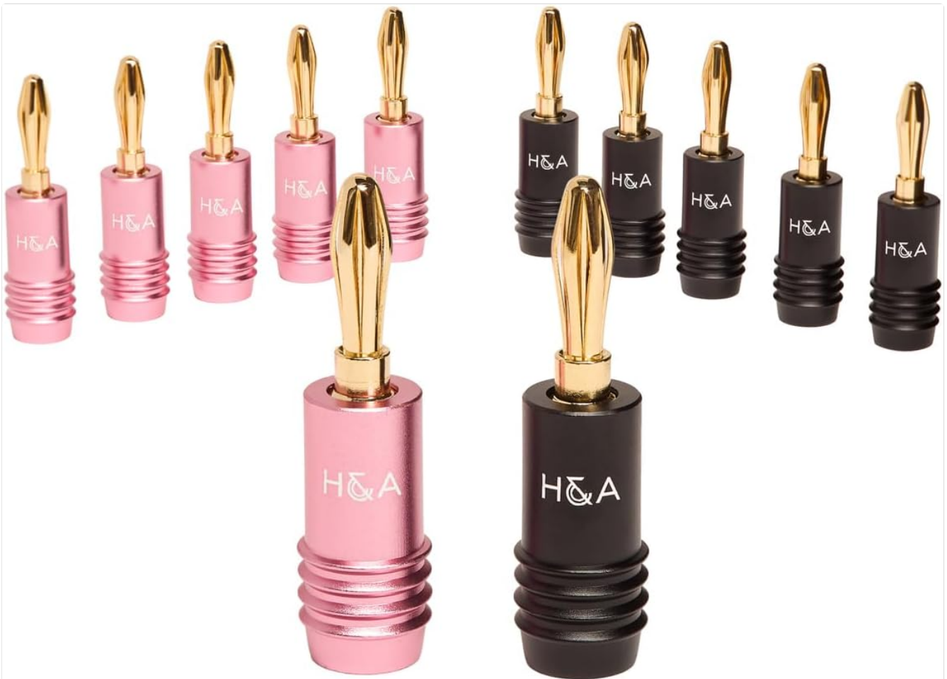
Image: A close-up view of the H&A Speaker Connector Banana Plugs, showing both the pink and black variants with gold-plated tips.