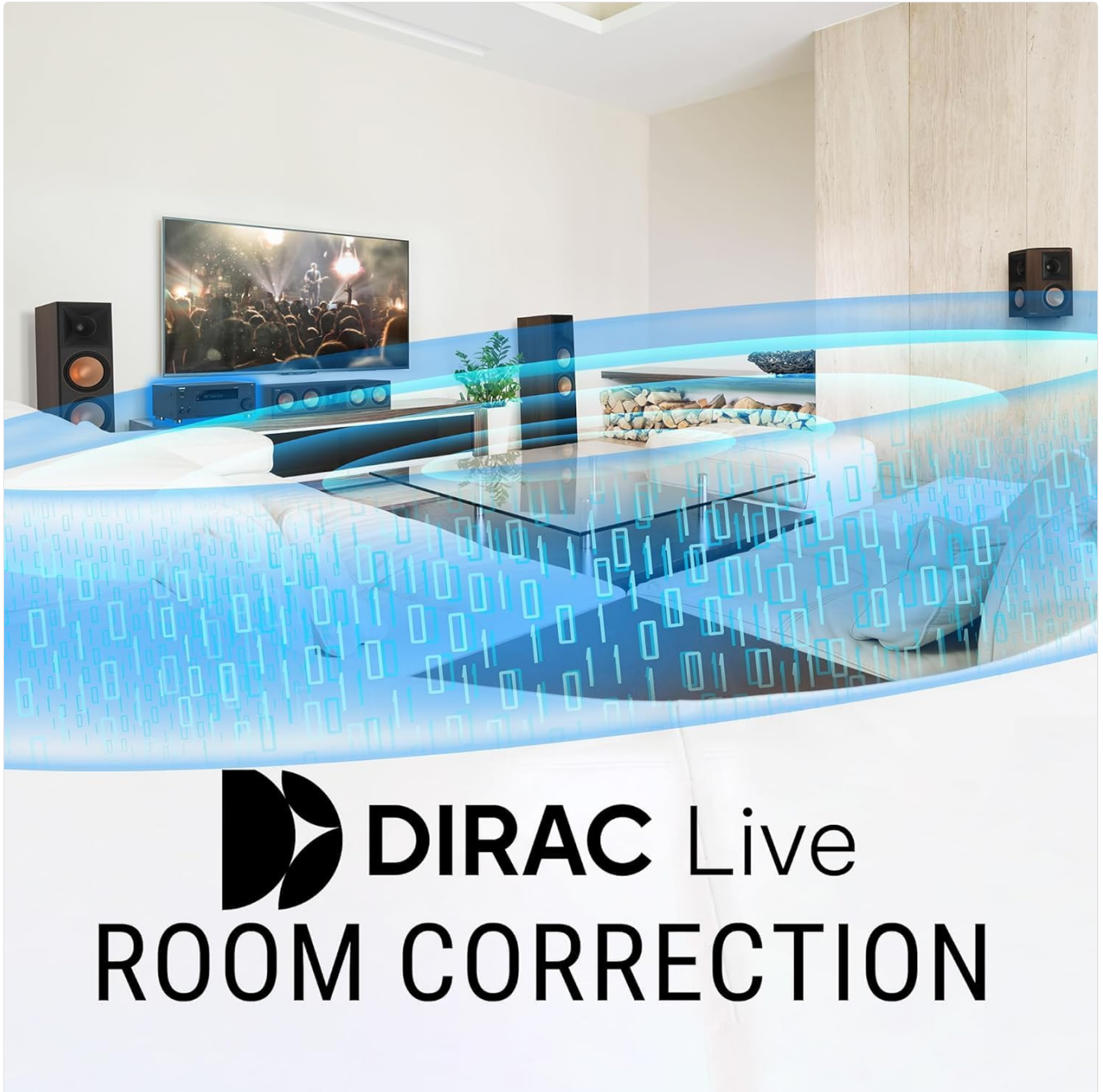
Image: A graphic illustrating the concept of Dirac Live Room Correction, emphasizing its role in optimizing audio performance within a specific listening environment.

Upon first power-on, the receiver will guide you through an initial setup wizard. This includes speaker configuration and network settings. For optimal sound performance, perform the Dirac Live Room Correction using the supplied microphone. This process measures your room's acoustics and calibrates the sound output accordingly.