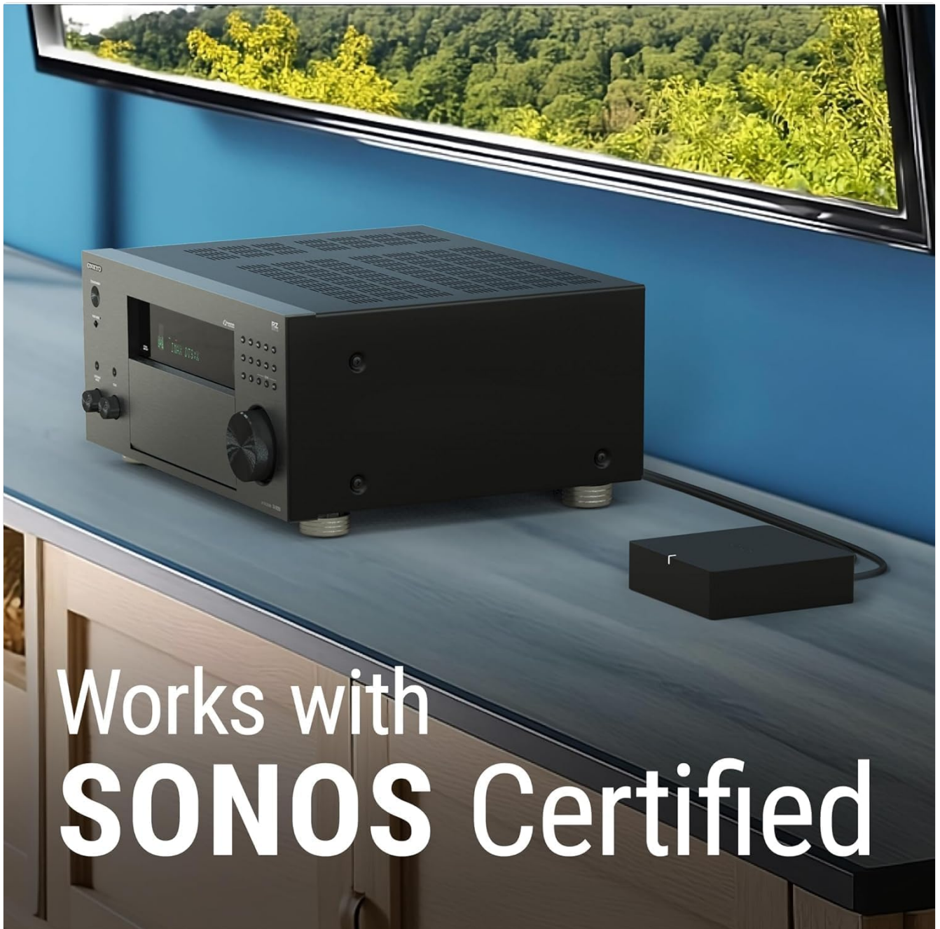
Image: A graphic displaying the 'Works with SONOS Certified' logo, signifying compatibility with the Sonos ecosystem.