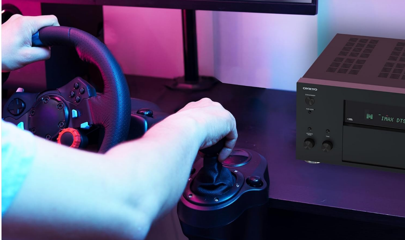
Image: A dynamic image depicting a person engaged in 4K gaming, with the Onkyo TX-RZ50 receiver visible, emphasizing its role in an immersive gaming setup.