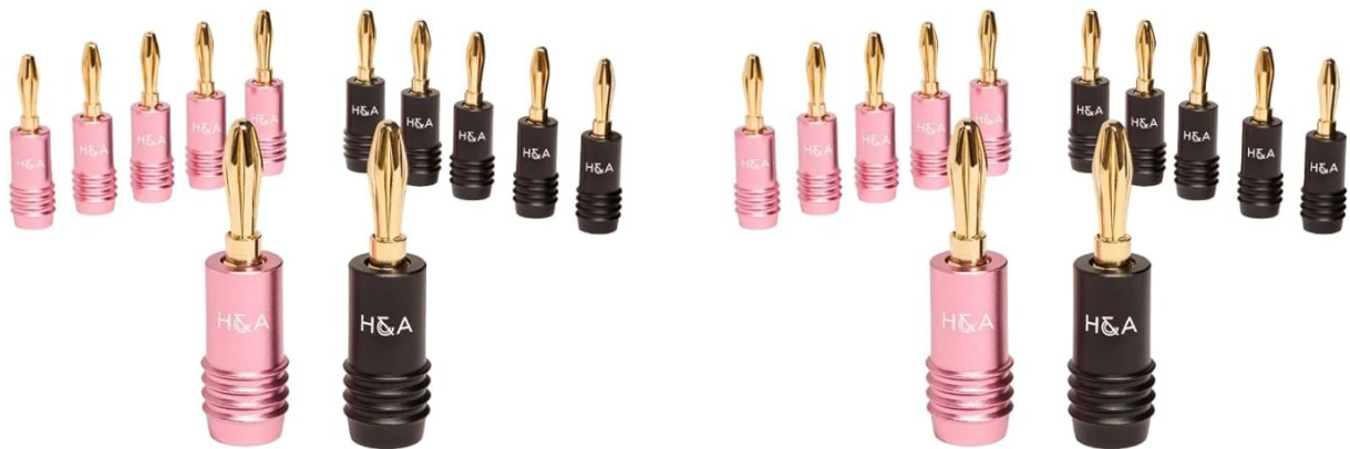
Image: The Onkyo TX-RZ50 AV Receiver, a sleek black unit, is shown alongside the included H&A Speaker Connector Banana Plugs, which come in both pink and black colors.