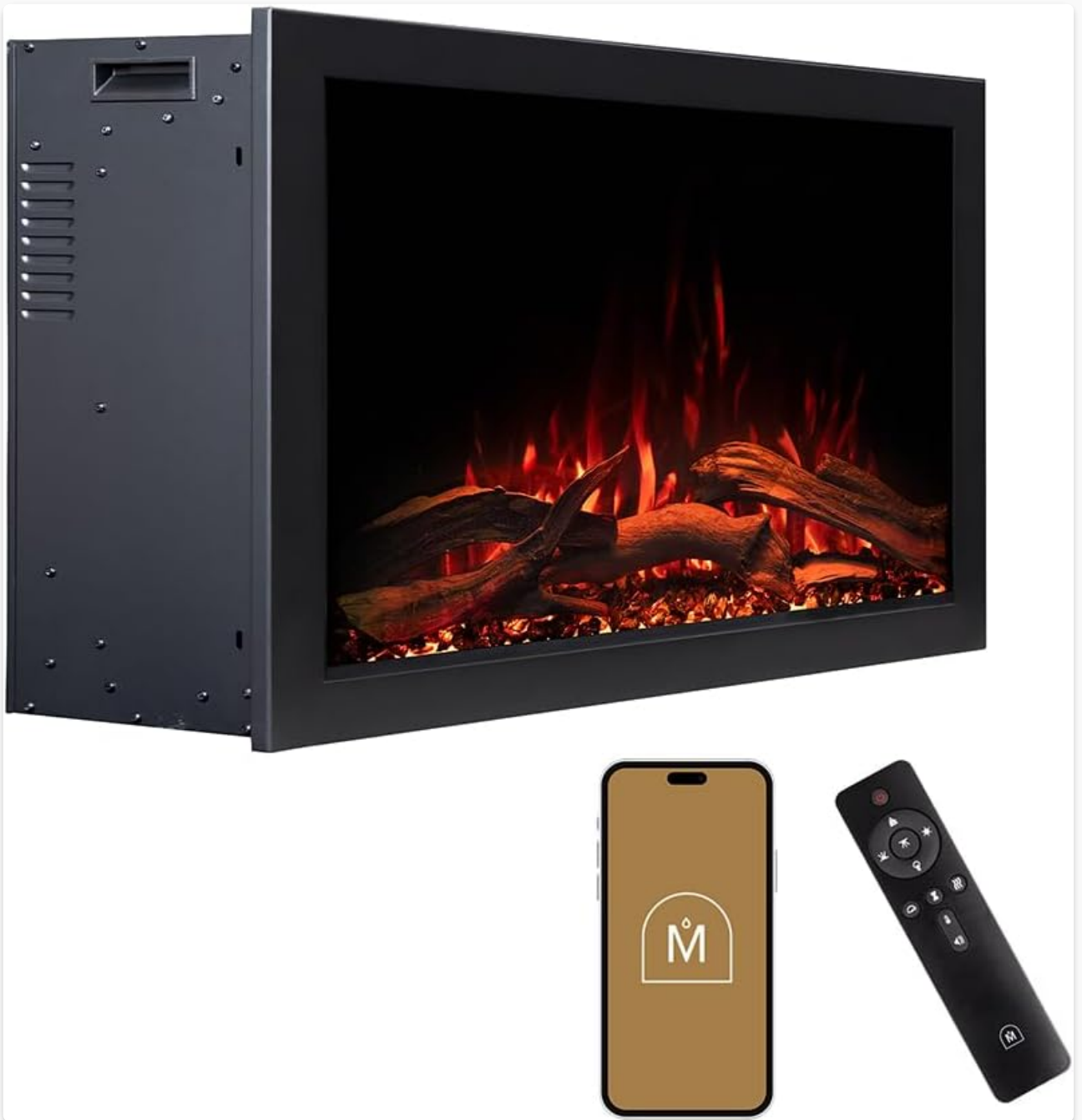
Image 1.1: The Modern Ember Highmark Traditional 33 Inch Smart Electric Fireplace Insert, shown with its remote control and a smartphone displaying the control app.

The Highmark Traditional 33-inch Built-In Electric Fireplace is designed to enhance your home with a modern and inviting atmosphere. It features lifelike driftwood logs, shimmering glacier crystals, and a concrete-like firebox backdrop for a captivating flame display. The self-trimming design ensures a seamless built-in installation. Control options include a digital touch panel, remote control, smartphone app via Wi-Fi, and voice control through Alexa.