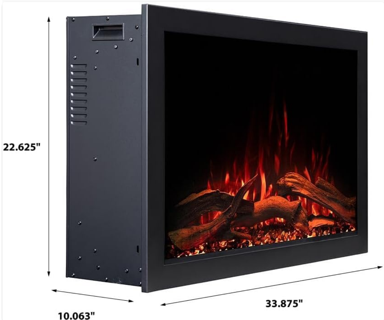
Image 3.1: Detailed dimensions of the electric fireplace insert, showing its height, width, and depth for accurate installation planning.