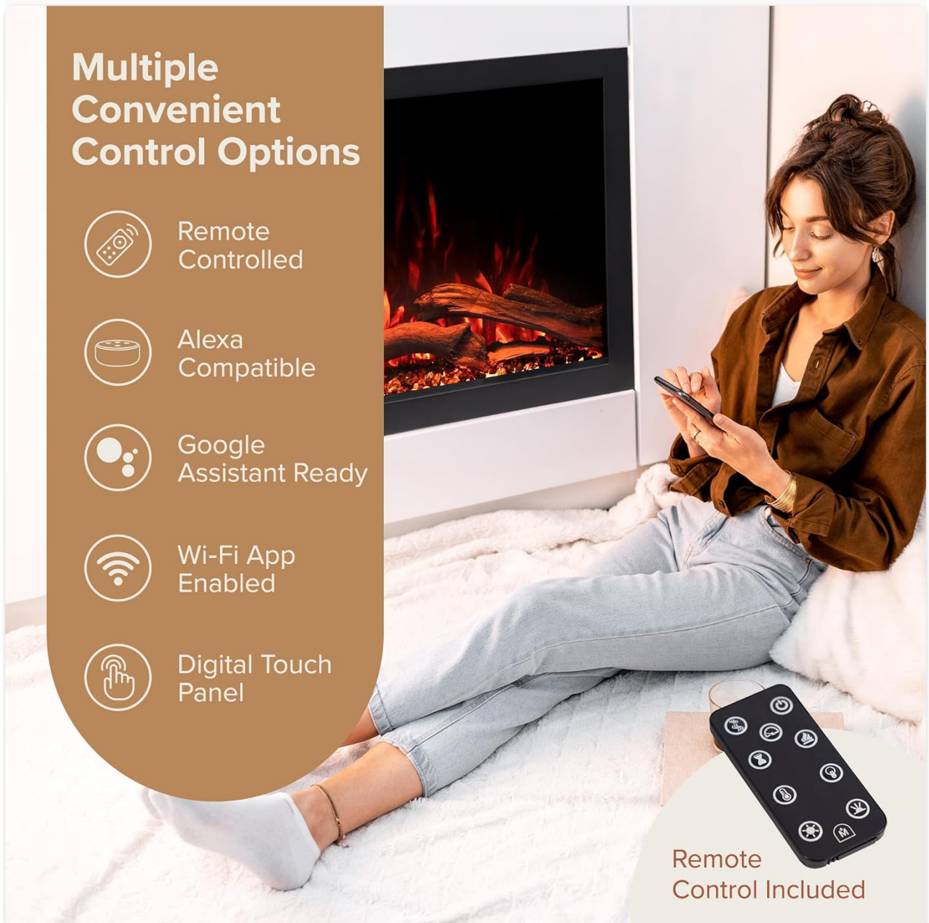
Image 4.1: The various control methods available for the fireplace, including the remote control, smartphone app, digital touch panel, and compatibility with Alexa and Google Assistant.

Your Modern Ember fireplace offers multiple convenient control options.