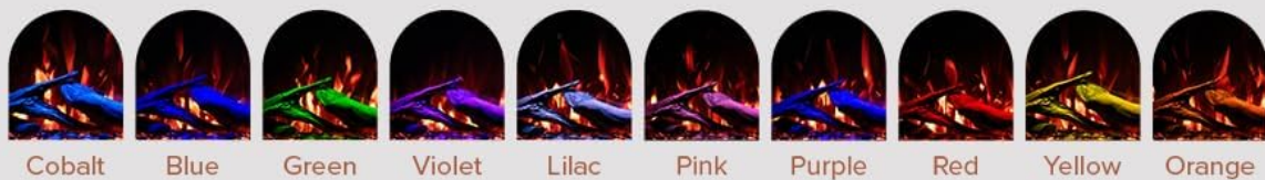
Image 4.2: Visual representation of the extensive customization options for flame, ember bed, and downlight colors, allowing users to create their desired ambiance.