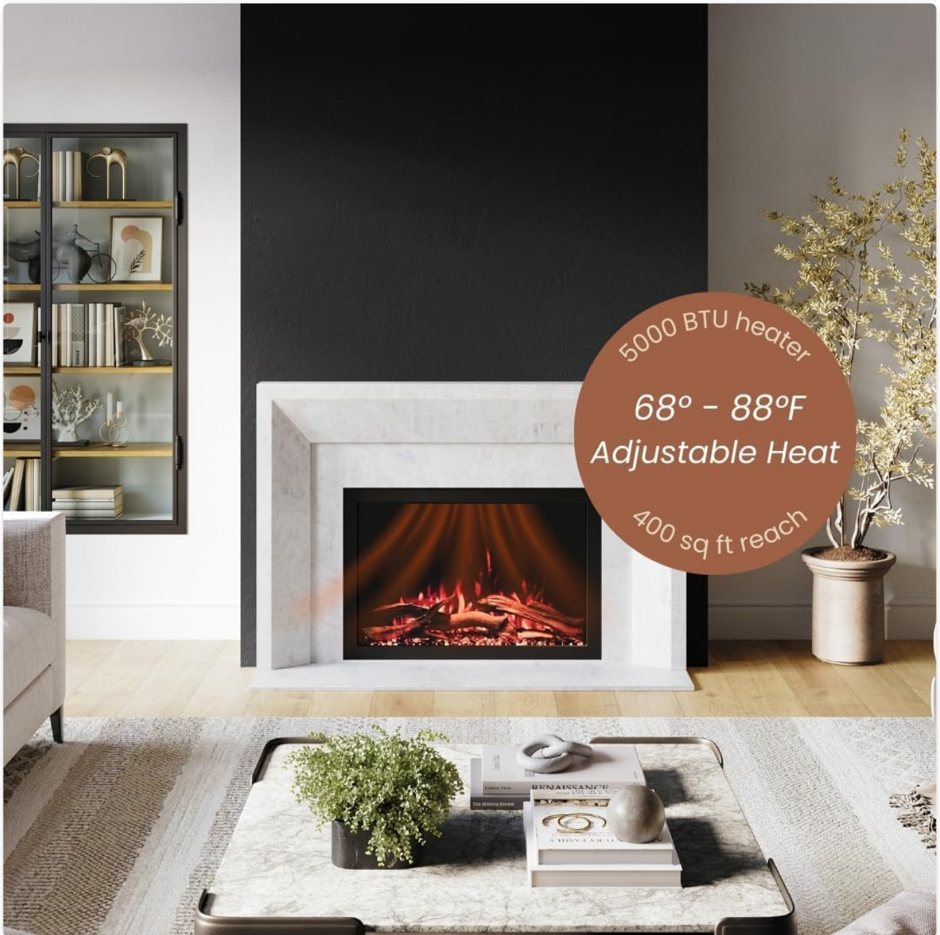
Image 4.4: The fireplace's heating capabilities, featuring a 5000 BTU heater with adjustable temperatures and a heating coverage of 400 square feet.