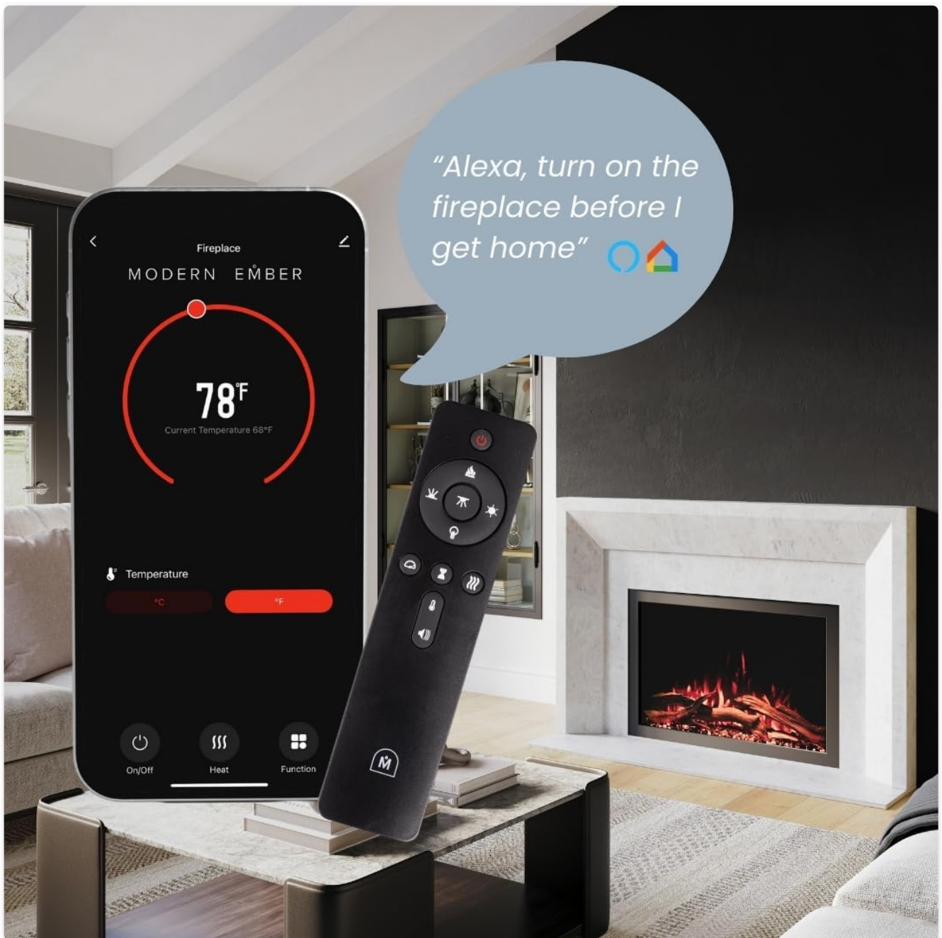
Image 4.5: Demonstrating smart control features, including the Modern Ember smartphone app, remote control, and voice command integration with Alexa.