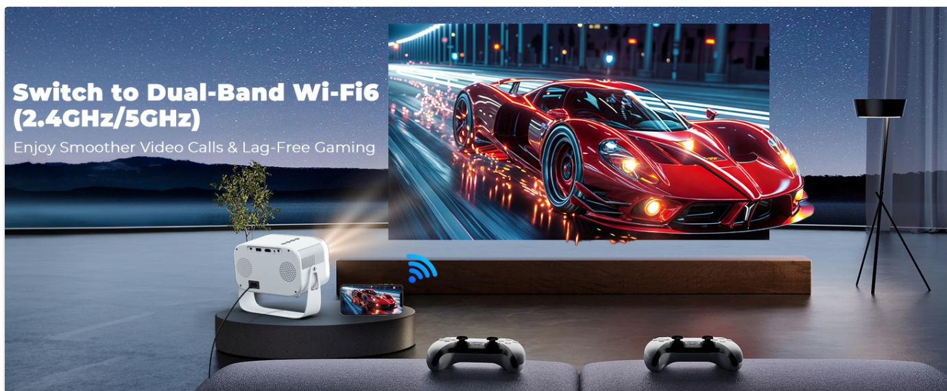
Image: The Jimveo E18 Projector connected via Dual-Band Wi-Fi 6, projecting a high-speed racing game, illustrating smooth performance.