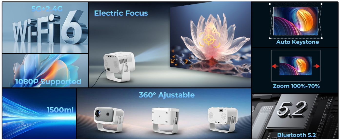
Image: A visual representation of the Jimveo E18 Projector highlighting its key technological features such as Wi-Fi 6, 1080P resolution, electric focus, auto keystone correction, 360-degree adjustable stand, and Bluetooth 5.2.

Familiarize yourself with the various parts of your Jimveo E18 Projector.