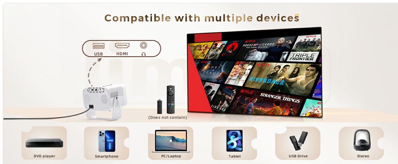
Image: The Jimveo E18 Projector demonstrating its compatibility with various devices through USB, HDMI, and headphone connections, including DVD players, smartphones, PCs/laptops, tablets, USB drives, and external stereos.

Connect devices like laptops, gaming consoles, or TV sticks using an HDMI cable.