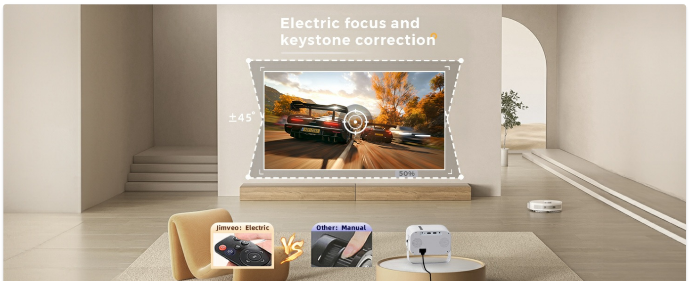
Image: The Jimveo E18 Projector showcasing its electric focus and keystone correction capabilities, ensuring a clear and properly aligned projected image.

The E18 features electric focus and auto keystone correction for a clear and perfectly rectangular image.