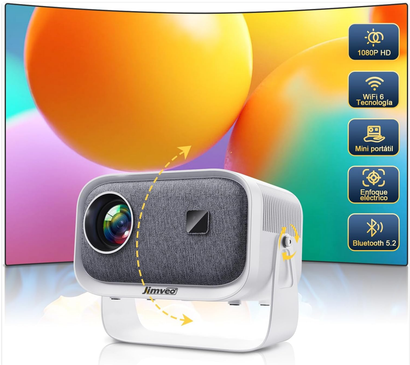
Image: The Jimveo E18 Projector, showcasing its compact design and key features like 1080P HD, WiFi 6, portability, electric focus, and Bluetooth 5.2.