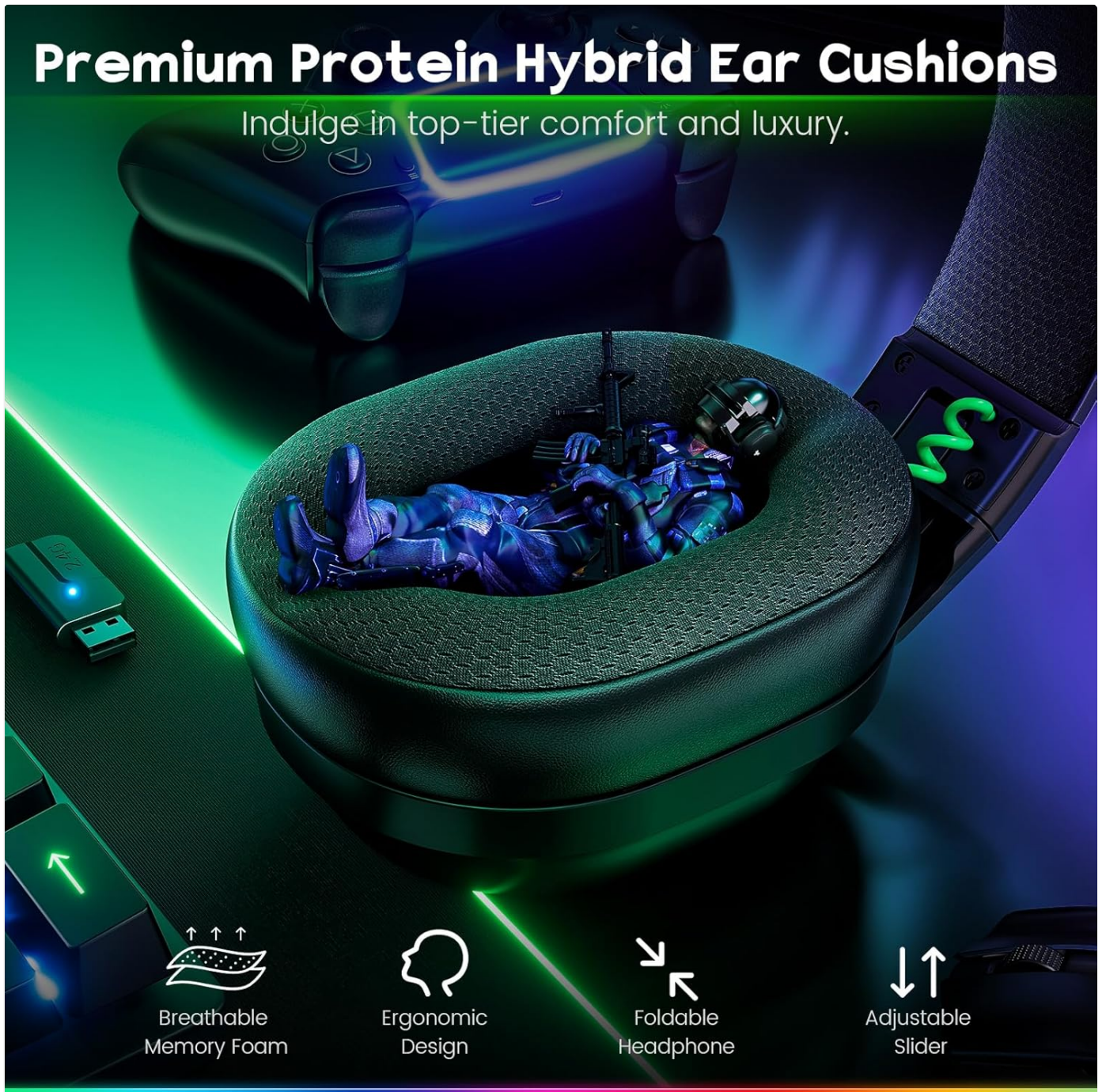
Figure 7: Close-up of the headset's comfortable ear cushions, highlighting breathable memory foam, ergonomic design, foldable feature, and adjustable slider.