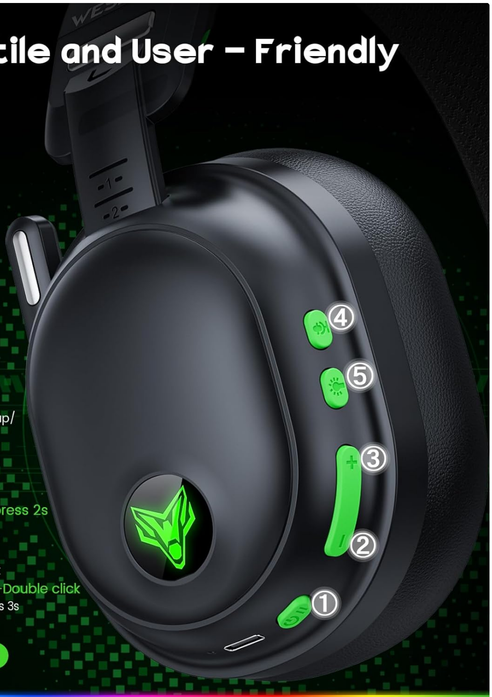
Figure 2: Detailed view of headset controls and ports. (1) Power/Play/Pause/Call Button, (2) Volume Down/Previous Track, (3) Volume Up/Next Track, (4) Microphone On/Off/Mode Switch, (5) RGB Light/EQ Mode/Re-pairing Button, (6) Type-C Charging Port.