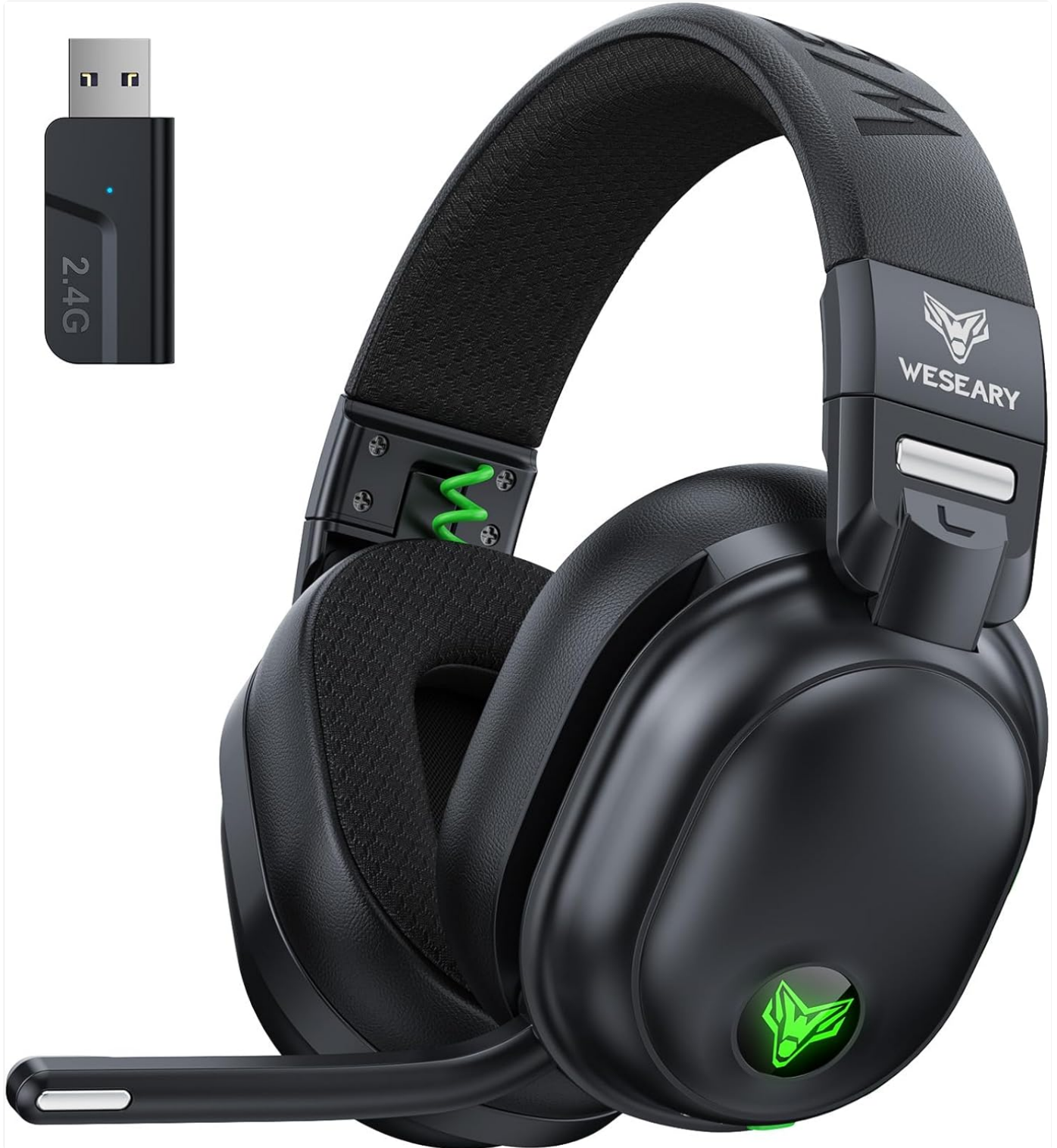
Figure 1: WESEARY WG3 Wireless Gaming Headset and included 2.4G USB dongle.