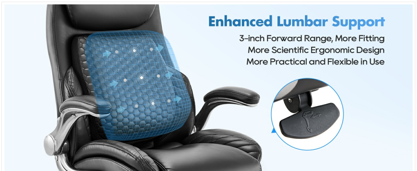
Figure 3: Multi-functional Chair Features. This image highlights various adjustable features including height adjustment, rocking function, and lumbar support.

To raise the seat, lift the lever on the right side of the chair while taking your weight off the seat. To lower the seat, lift the lever while seated. Release the lever at the desired height.