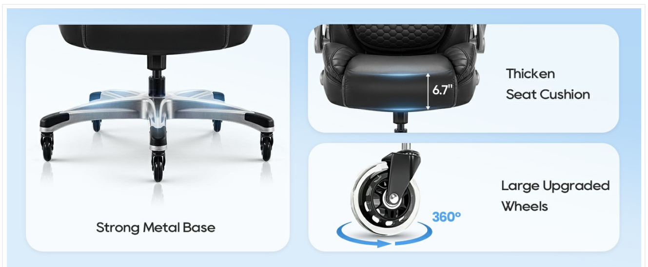
Figure 5: Upgraded Casters vs. Ordinary Casters. This image highlights the benefits of the upgraded casters, including larger diameter, increased stability, smoother and quieter operation, floor protection, and enhanced mobility.

The chair is equipped with upgraded, large-diameter silent casters designed for smooth and effortless movement across various floor types without causing scratches. These casters provide 360-degree rotation for flexible mobility.