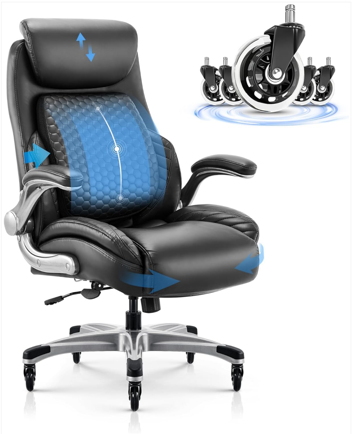
Figure 1: COLAMY Office Ergonomic Desk High Back Executive Chair (Black Leather)