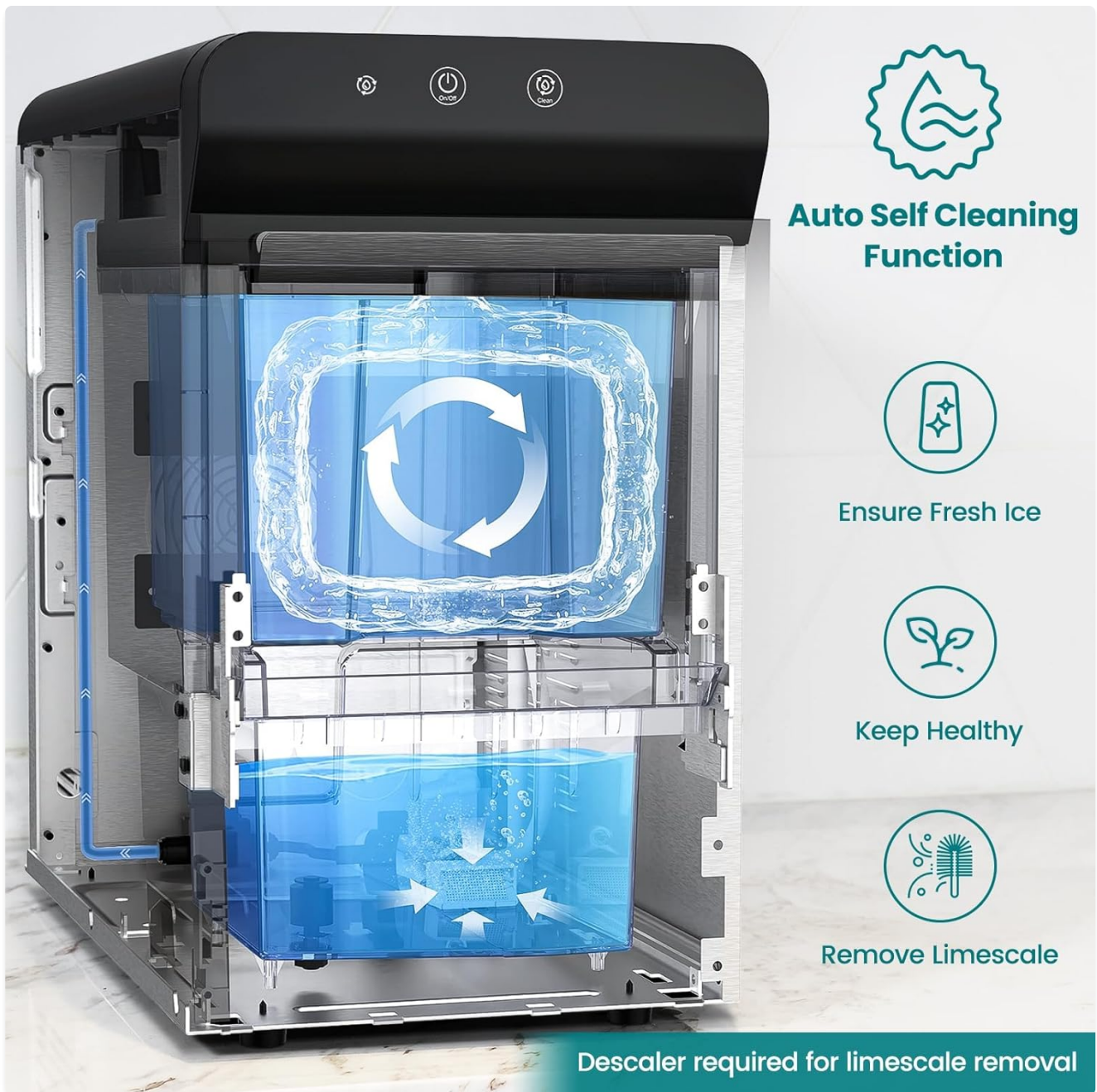
Image: Diagram illustrating the internal water circulation during the auto self-cleaning process, emphasizing its role in ensuring fresh ice, maintaining health, and removing limescale.