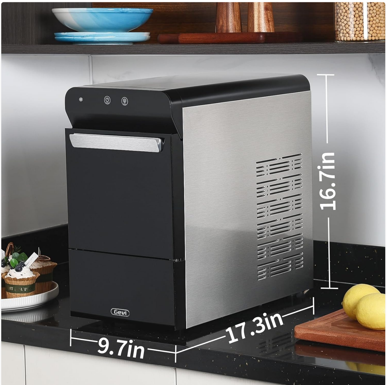
Image: Diagram showing the dimensions of the Gevi Nugget Ice Maker: 9.7 inches wide, 17.3 inches deep, and 16.7 inches high, illustrating its compact size for countertop placement.

Place the ice maker on a stable, level surface away from direct sunlight and heat sources. Ensure there is adequate ventilation around the unit. The compact design, measuring 17.3" (D) x 9.7" (W) x 16.7" (H), allows it to fit conveniently under most standard wall cabinets.