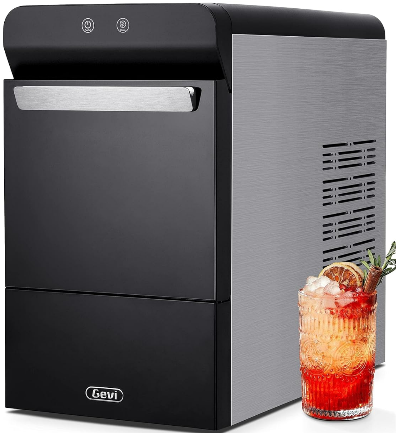
Image: The Gevi Household V2.0 Countertop Gemi Nugget Ice Maker, showcasing its sleek black and stainless steel design with a glass of iced beverage.