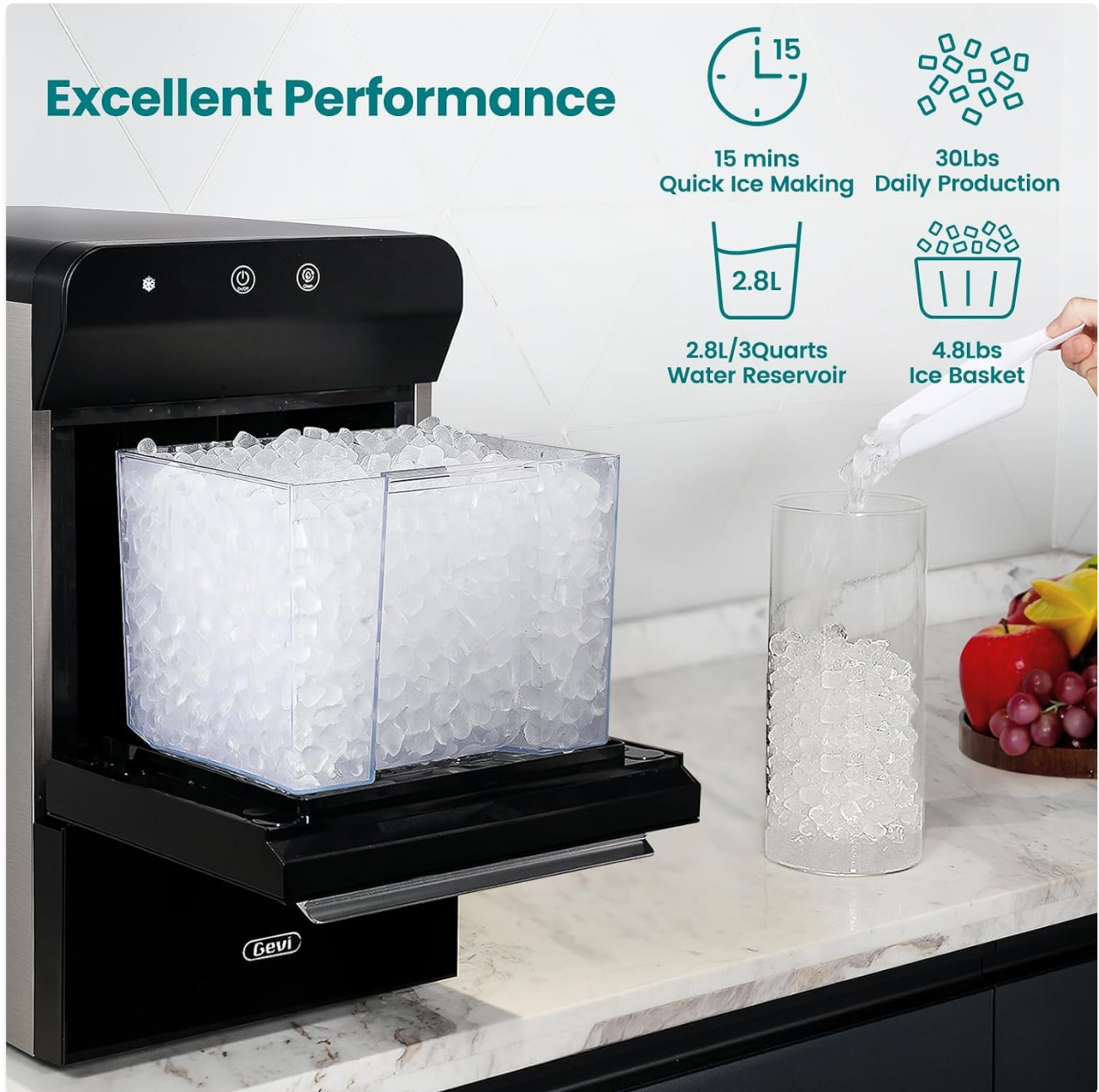
Image: Infographic highlighting the ice maker's performance: 15 minutes for quick ice making, 30 lbs daily production, 2.8L water reservoir, and 4.8 lbs ice basket capacity.

Plug the ice maker into a grounded electrical outlet. Press the power button on the touch control panel to begin ice production. The machine is designed to produce ice quickly, with the first batch ready in approximately 15 minutes. It can produce up to 30 pounds of nugget ice in 24 hours.