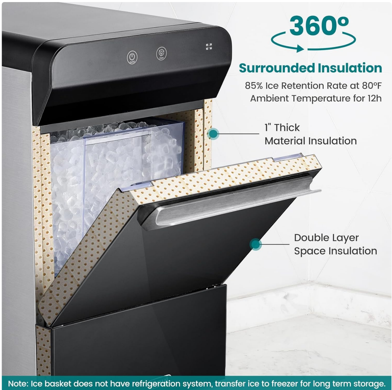
Image: Cross-section view of the Gevi ice maker highlighting its 1-inch thick material insulation and double-layer space insulation for ice retention.