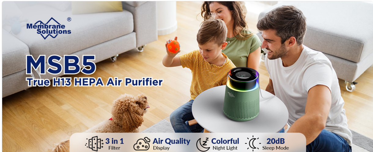
Image: Membrane Solutions MSB5 Air Purifier with key features highlighted.

Thank you for choosing the Membrane Solutions MSB5 Air Purifier. This device is designed to improve indoor air quality by filtering out various airborne particles. Please read this manual thoroughly before operating the unit and retain it for future reference.