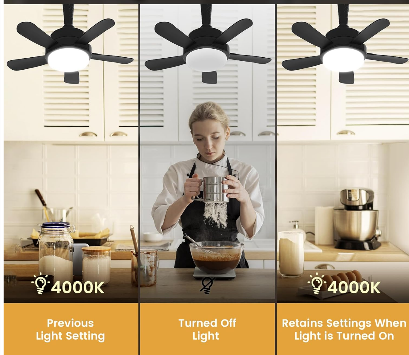
Figure 8: The memory function automatically recalls your last light settings.