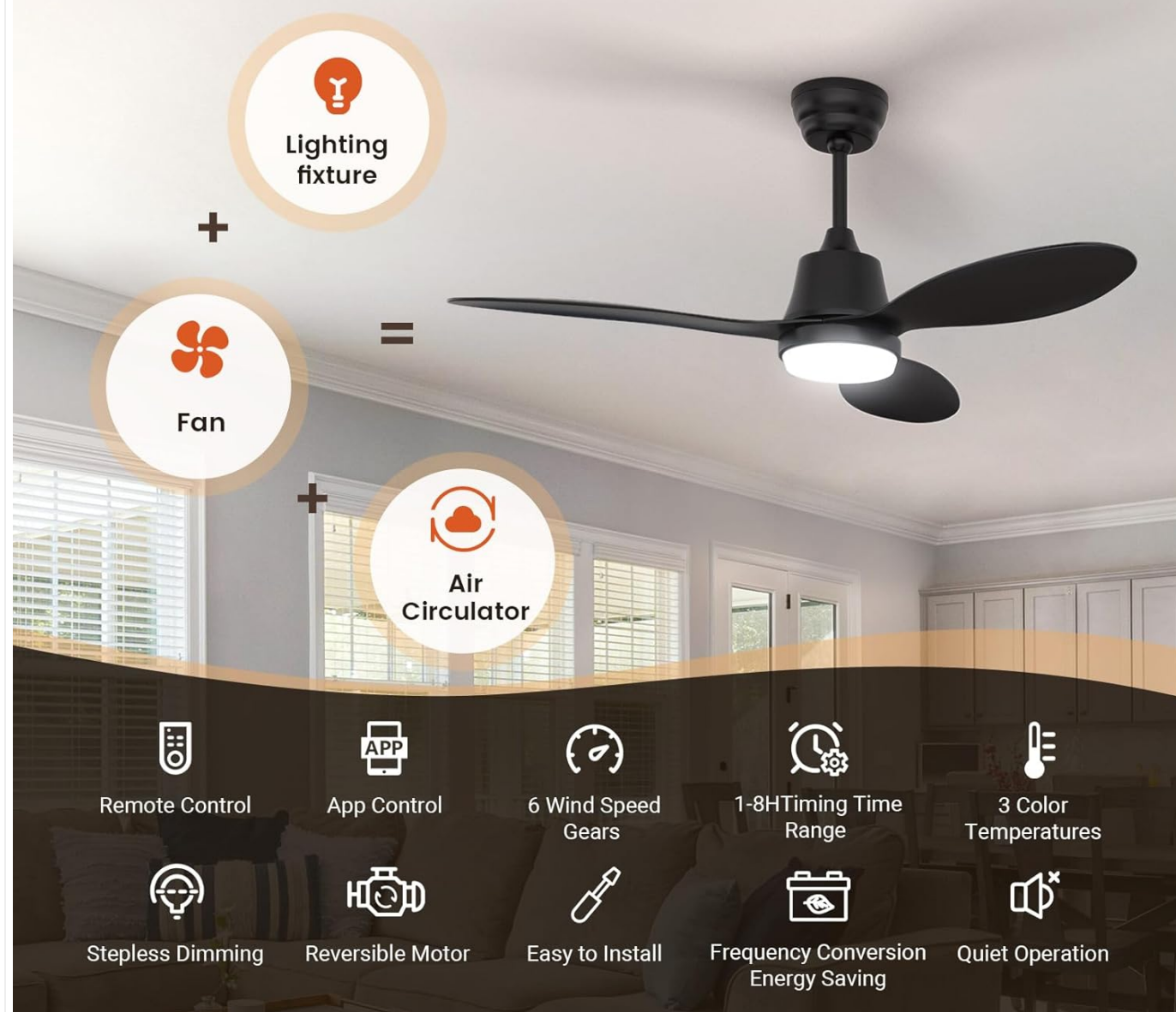
Figure 1: The BLITZWILL Ceiling Fan Light integrates lighting, fan, and air circulation functions into one device.