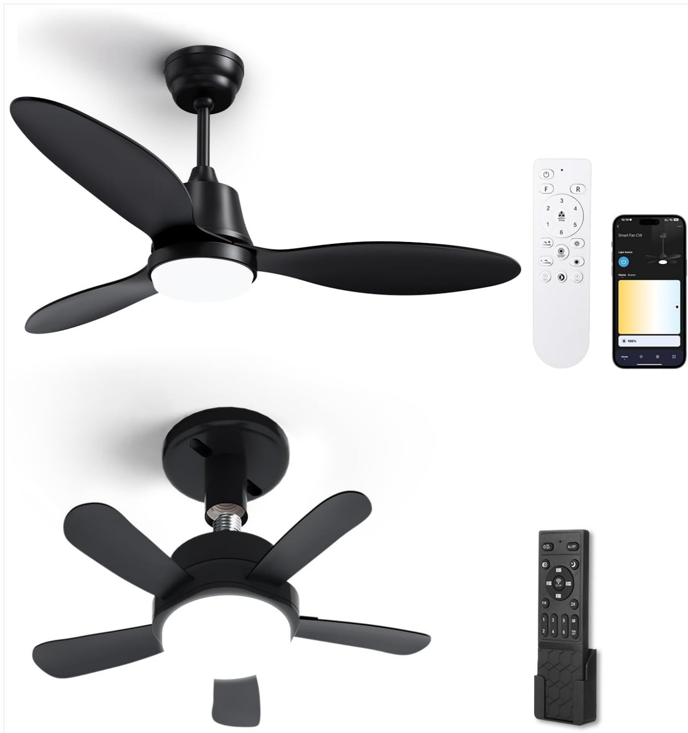
Figure 2: Main components of the BLITZWILL Ceiling Fan Light package.