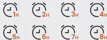
Figure 5: Fan speed settings and timer options for personalized comfort.