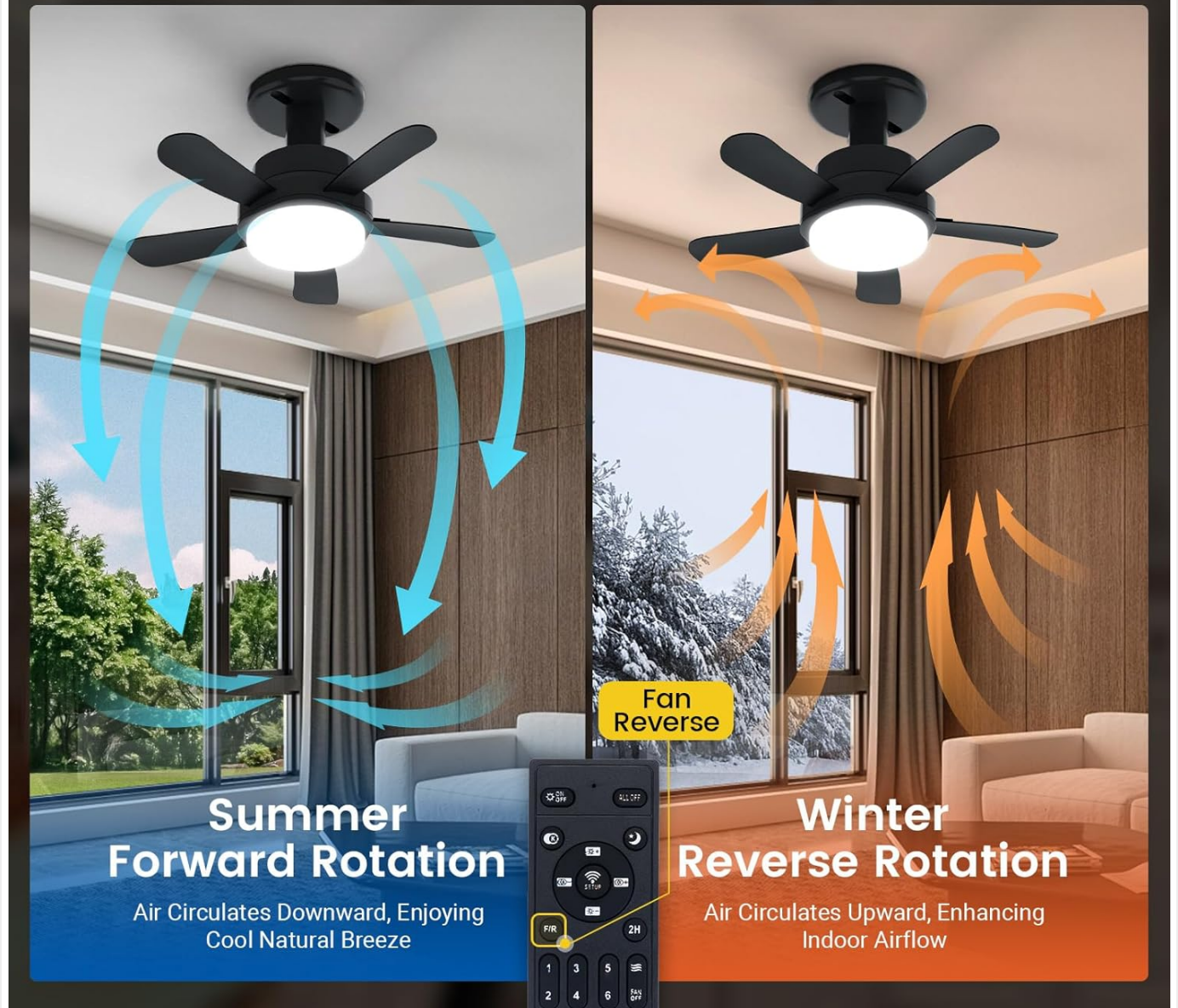
Figure 6: Reversible motor function for optimal airflow in summer and winter.