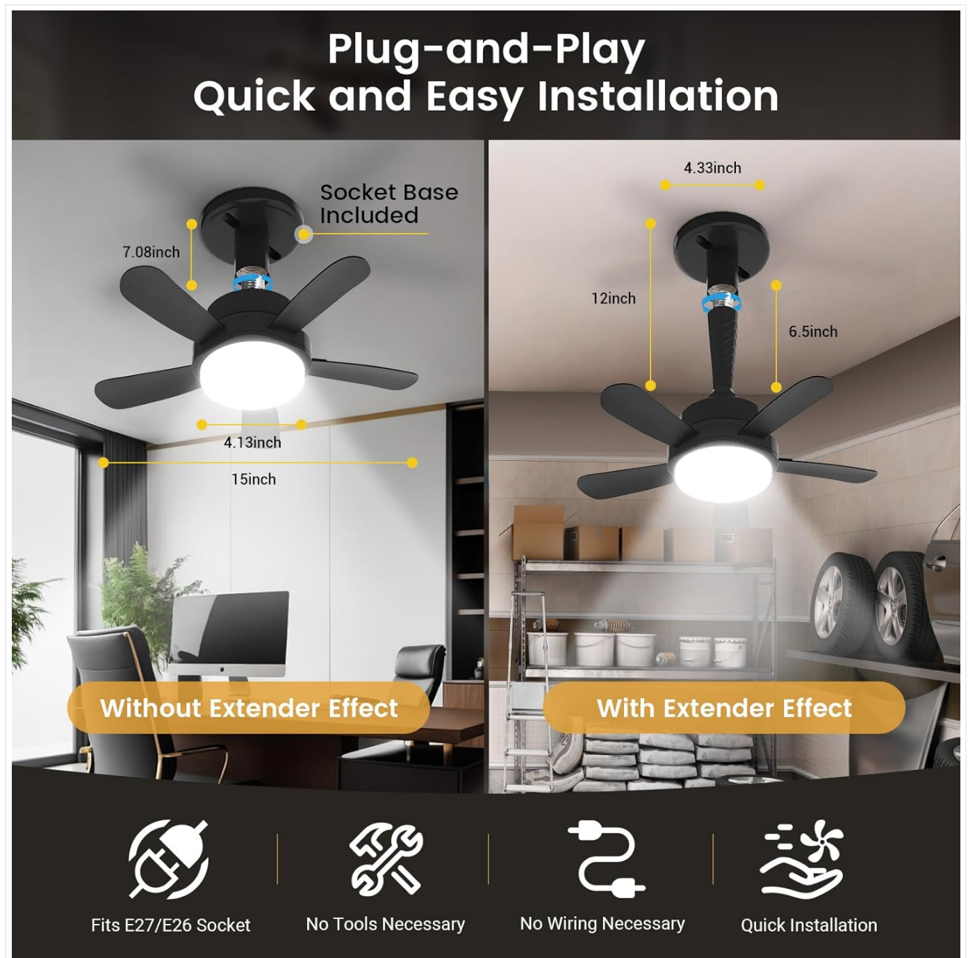
Figure 3: Plug-and-Play installation process, showing options with and without the socket extender.