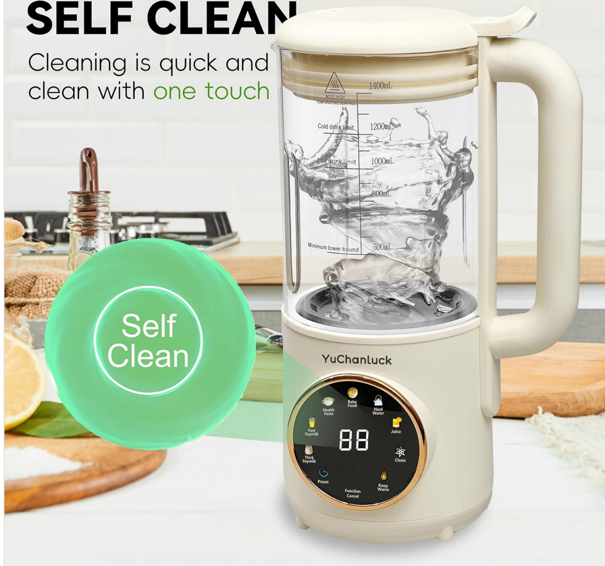
Image: The self-cleaning function simplifies post-use cleanup.

Cleaning is quick and clean with one touch