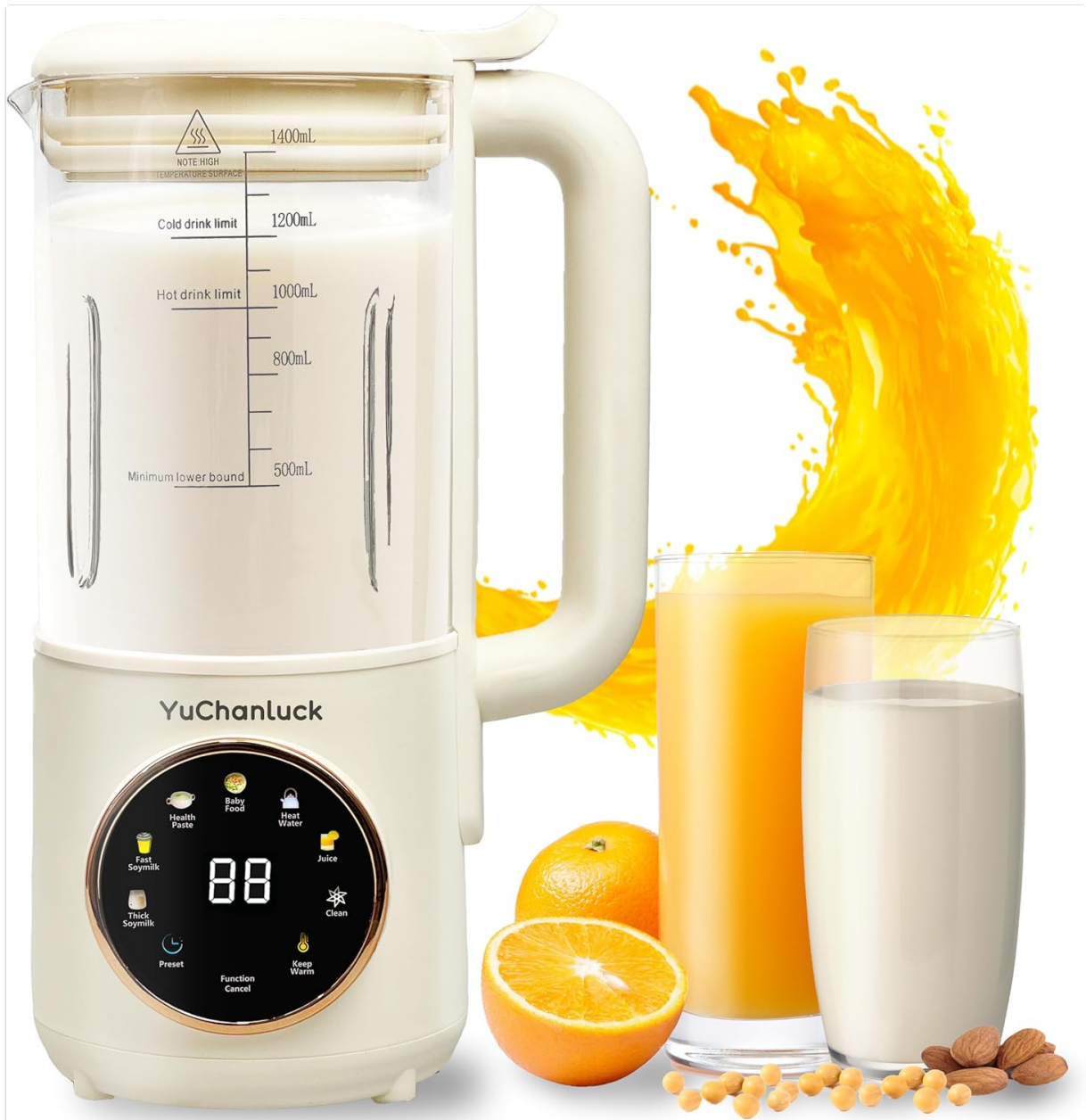
Image: The YUCHANLUCK Nut Milk Maker JX-318, showcasing its sleek design and a glass of freshly made nut milk.