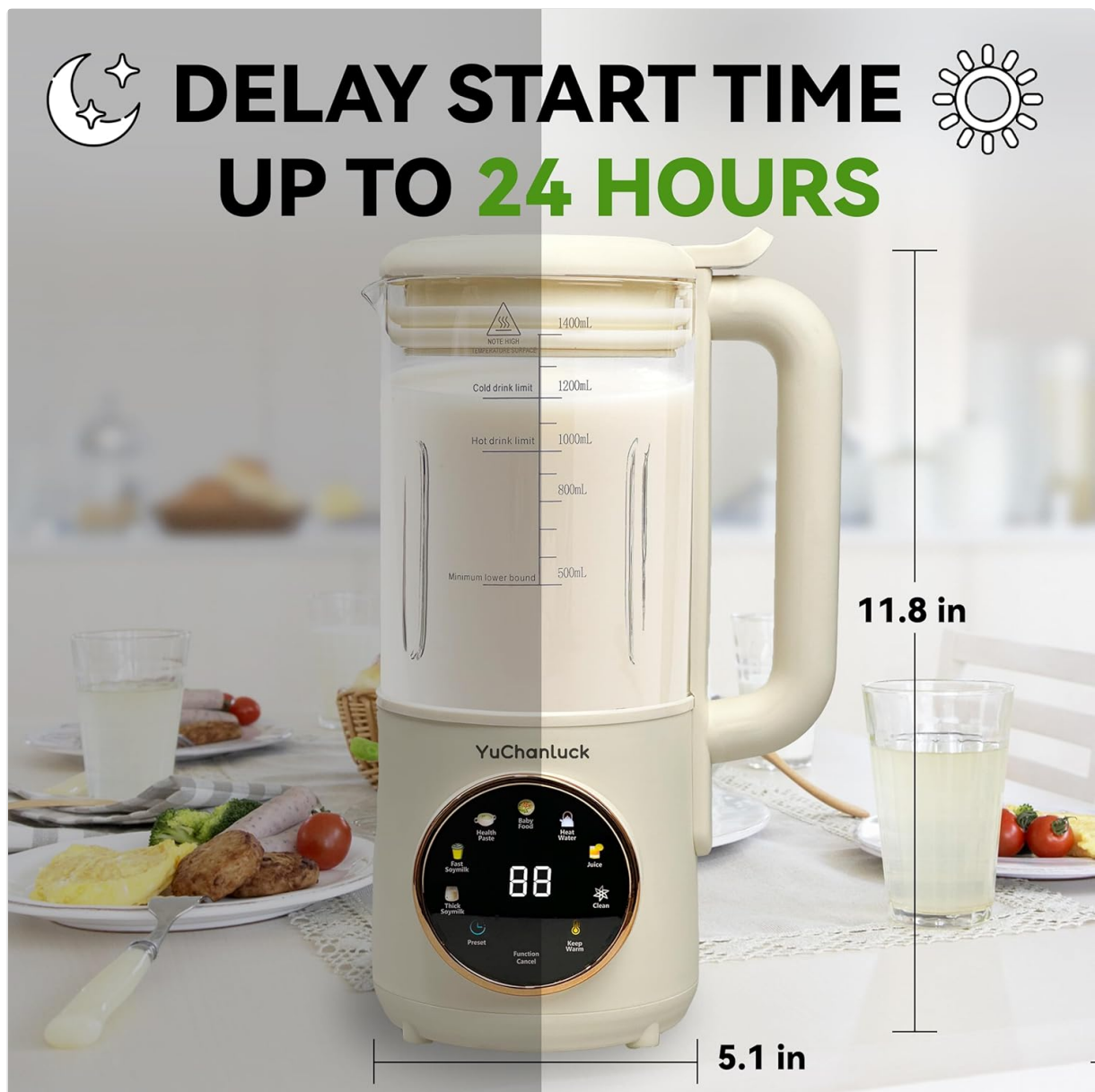
Image: The Nut Milk Maker's dimensions and the 24-hour delay start feature.