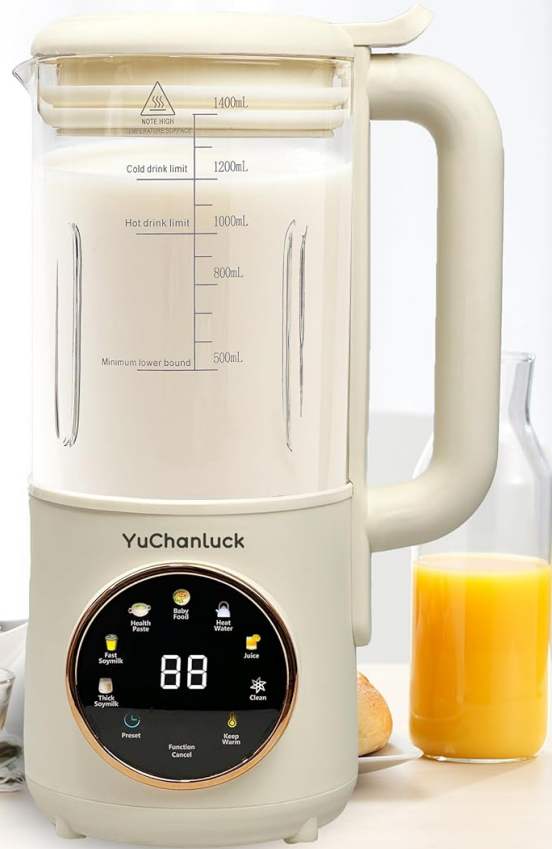
Image: The 47oz large capacity allows for making various plant-based milks like oat, cashew, coconut, and rice milk.