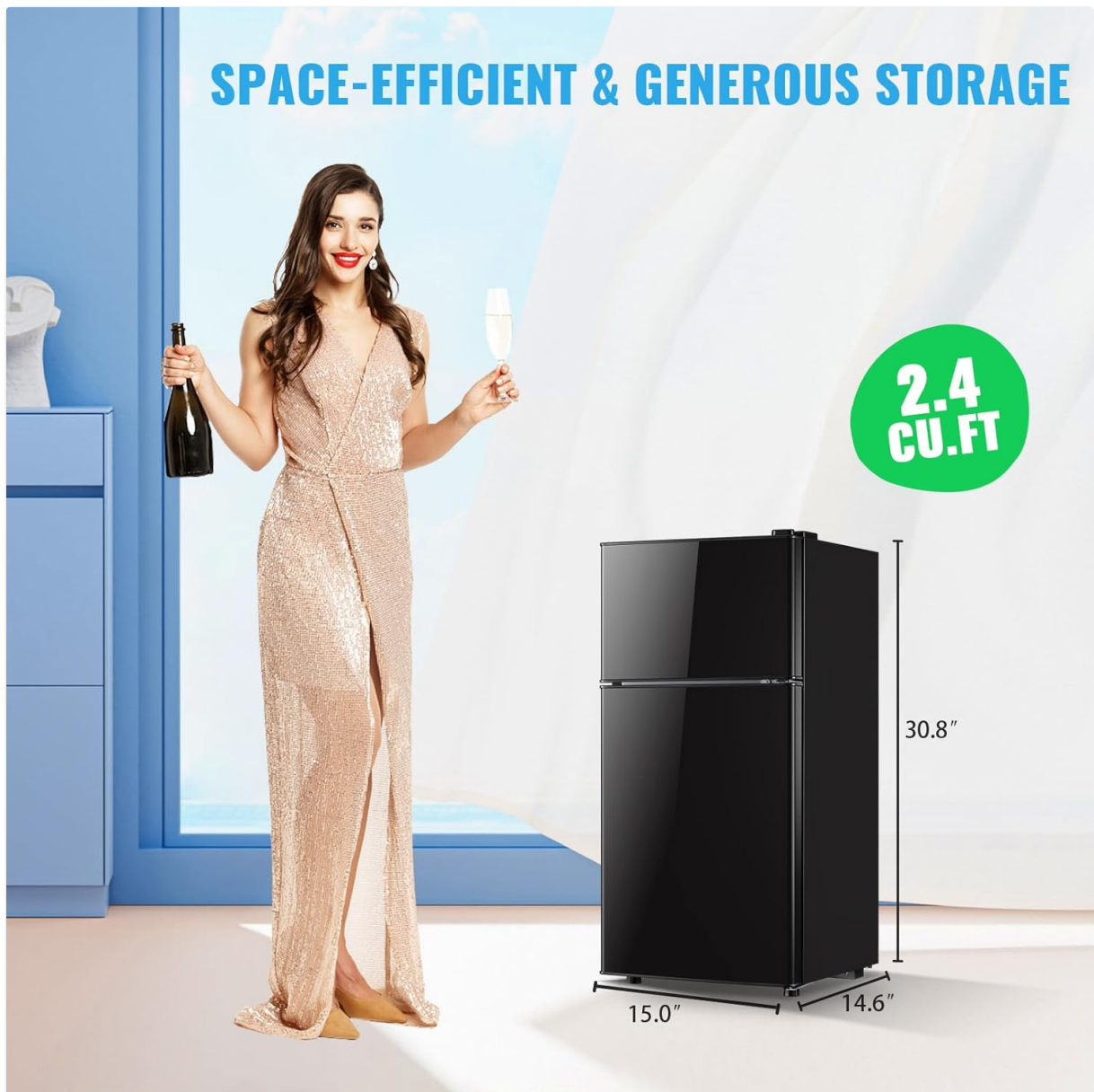
Figure 2: Product dimensions showing 15.0" width, 14.6" depth, and 30.8" height.