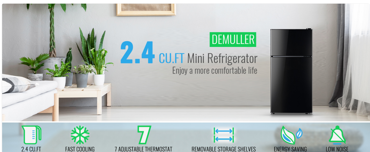
Figure 3: Visual overview highlighting key features such as 2.4 Cu.Ft capacity, fast cooling, 7 adjustable thermostat, removable storage shelves, energy saving, and low noise operation.