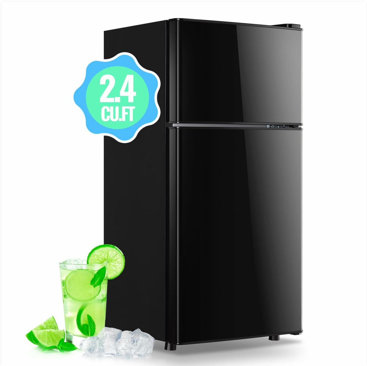
Figure 1: Front view of the DEMULLER 2.4 Cu.Ft Mini Fridge with Freezer in black.