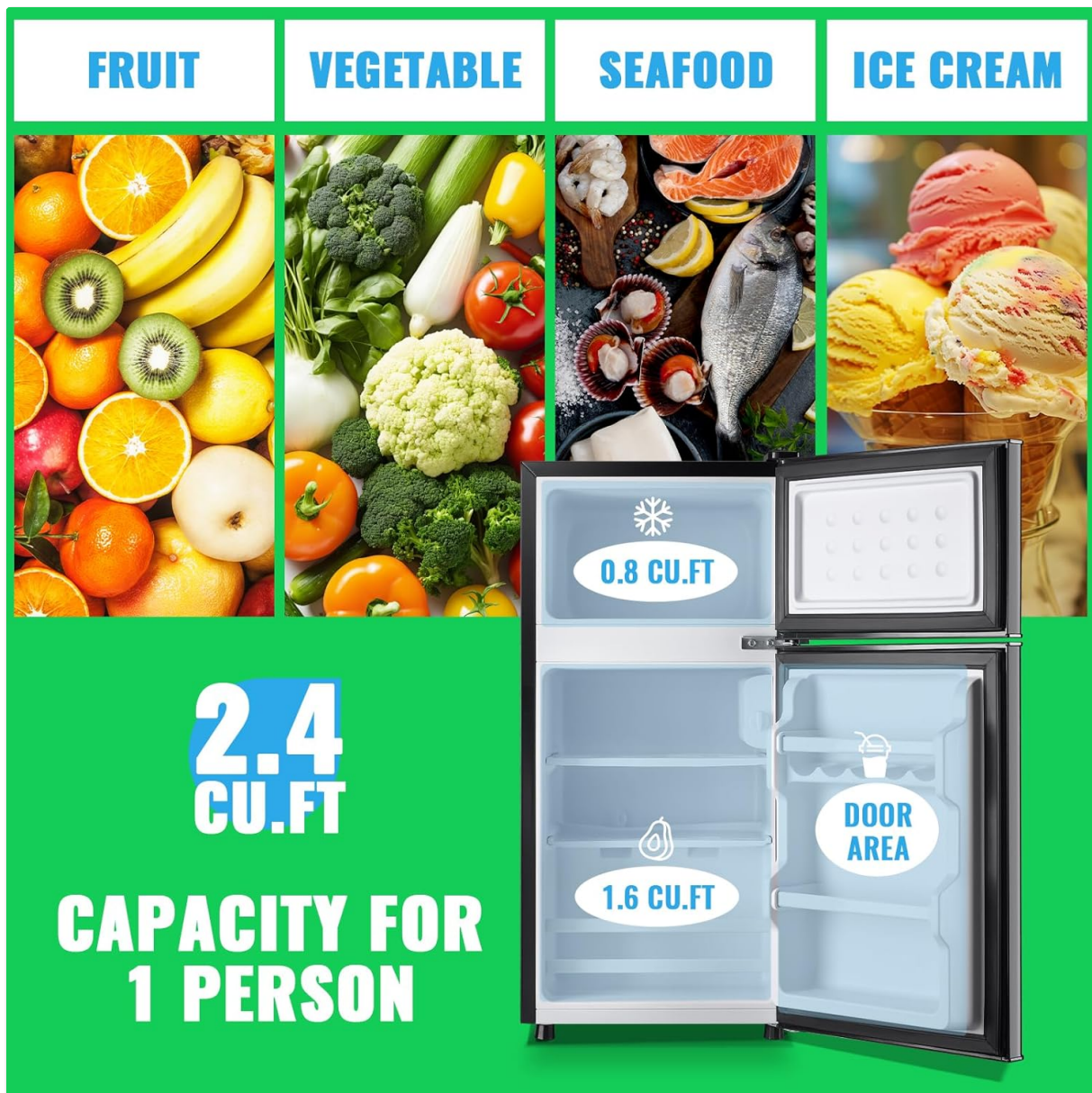
Figure 6: Interior view of the refrigerator and freezer compartments, demonstrating storage capacity for various items.

Your browser does not support the video tag.