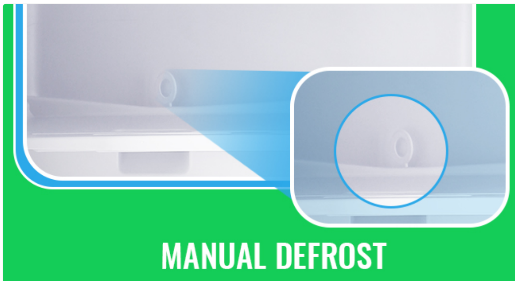
Figure 7: Illustrates the manual defrost feature, emphasizing the need for periodic defrosting to maintain efficiency.