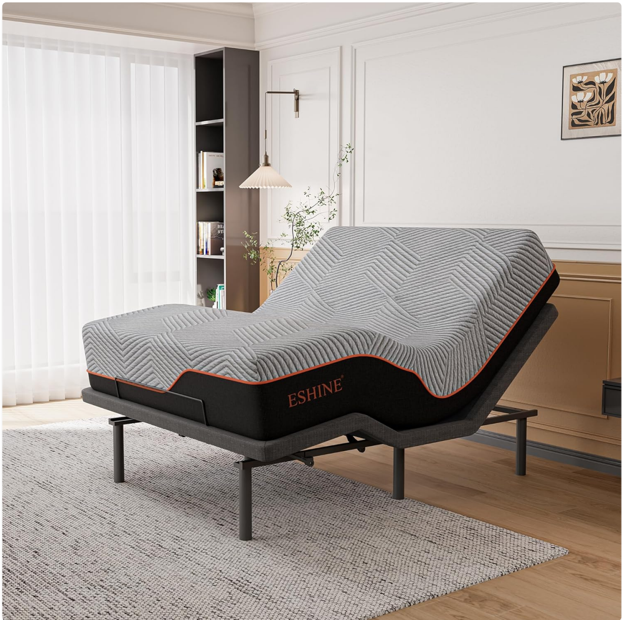
Figure 1: ESHINE 3100 Series Adjustable Bed Frame with 14-inch Memory Foam Mattress in an elevated position.

The ESHINE 3100 Series offers features such as customized positions for reading, watching TV, or sleeping, a massage vibration function with adjustable intensity and modes, and convenient remote and app control. The included 14-inch pure memory foam mattress conforms to your body for superior comfort and is infused with green tea extract for natural freshness.