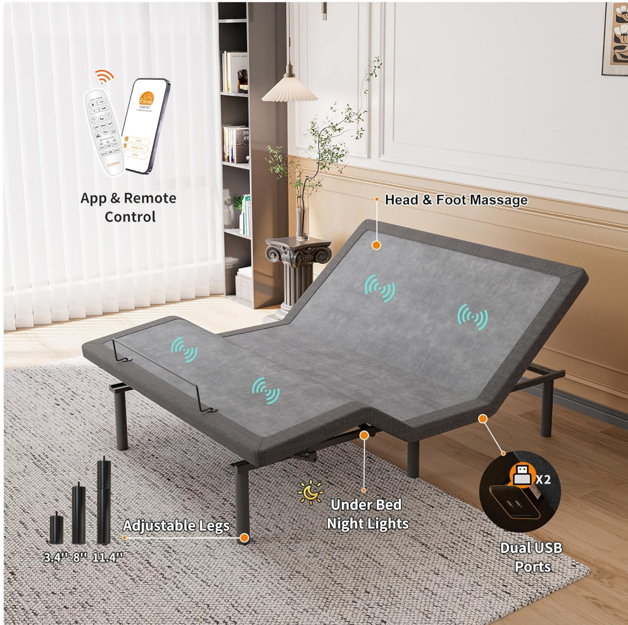
Figure 3: Key Features of the ESHINE Adjustable Bed Frame.

Convenient dual USB charging ports are integrated into the bed frame, allowing you to charge your electronic devices directly from your bed.