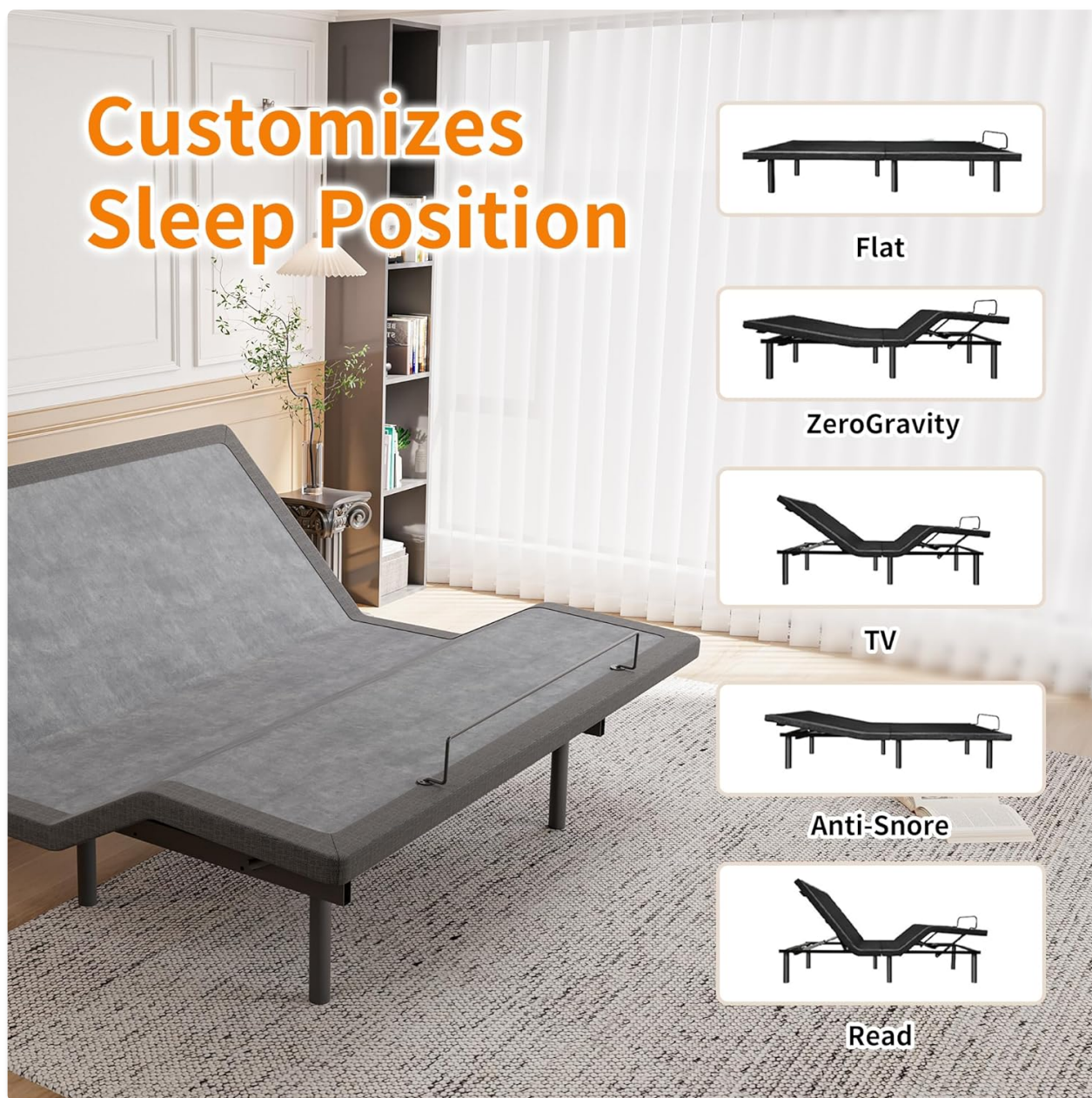
Figure 2: Customized Sleep Positions. The adjustable bed frame supports various positions for enhanced comfort.