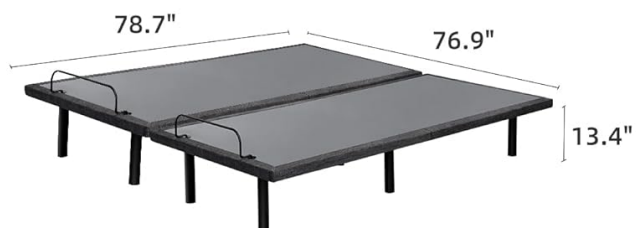
Figure 4: Product Dimensions for various bed sizes.

Product Dimensions: 78.7"L x 76.9"W x 13.4"H