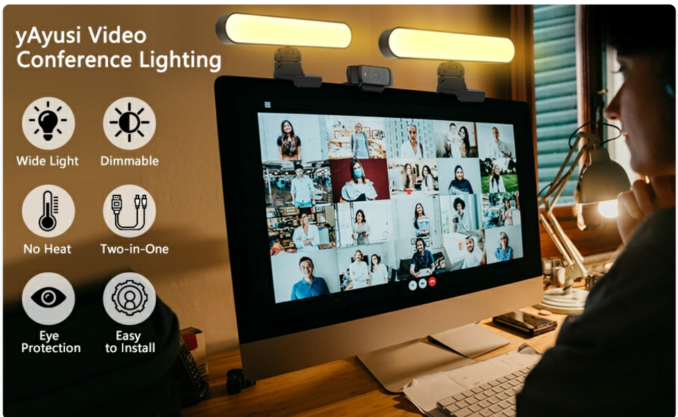
Figure 1: Overview of the yAyusi Dual-lamp Video Conference Lighting setup.

Thank you for choosing the yAyusi Dual-lamp Video Conference Lighting kit. This product is designed to enhance your video calls, streaming, and content creation by providing optimal illumination. Its dual-lamp design ensures brighter and more even lighting, helping you present your best self in any virtual environment. This manual provides detailed instructions for setup, operation, and maintenance to ensure you get the most out of your new lighting system.