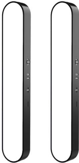
2 Conference Lights