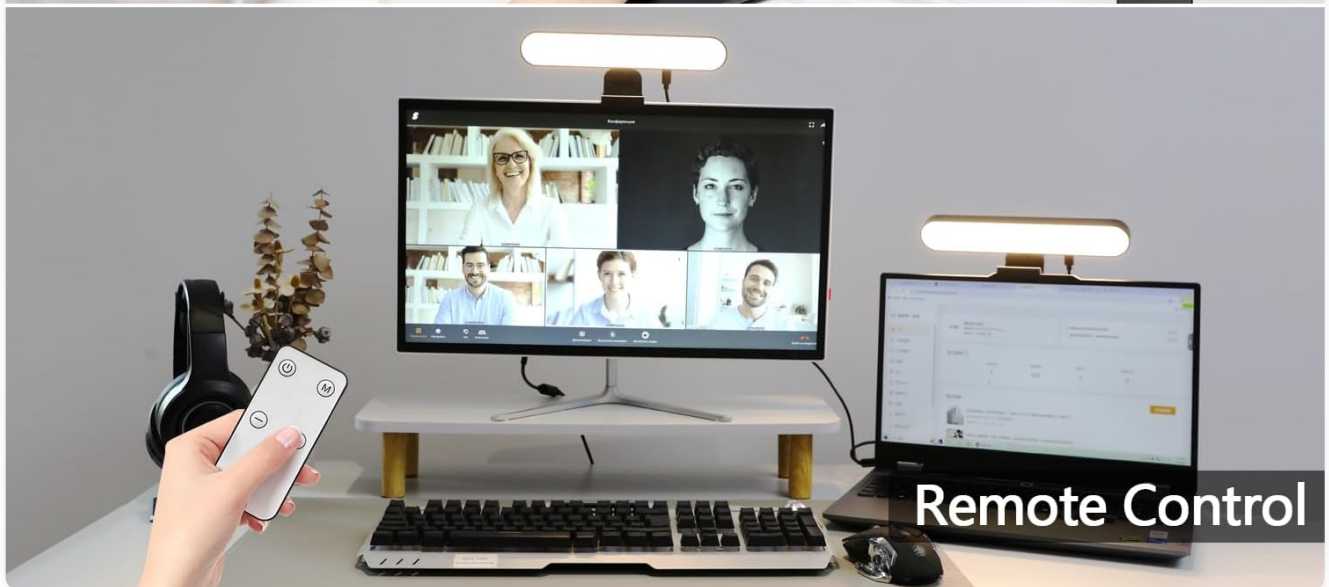
Figure 5: Demonstrating both touch and remote control functionality.