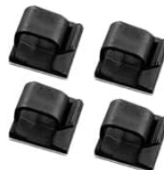
4 Wire Buckles