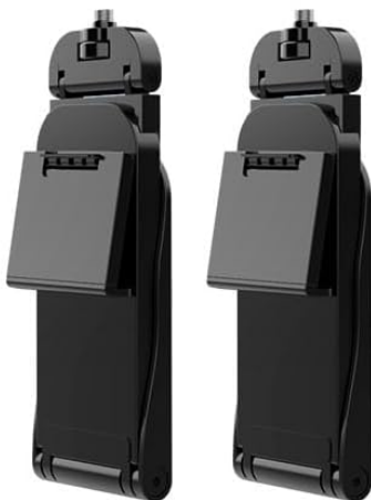
2 Light Stands