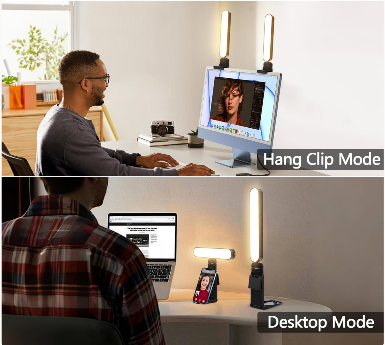
Figure 4: Lights shown in both hang clip mode and desktop mode.

Your browser does not support the video tag.