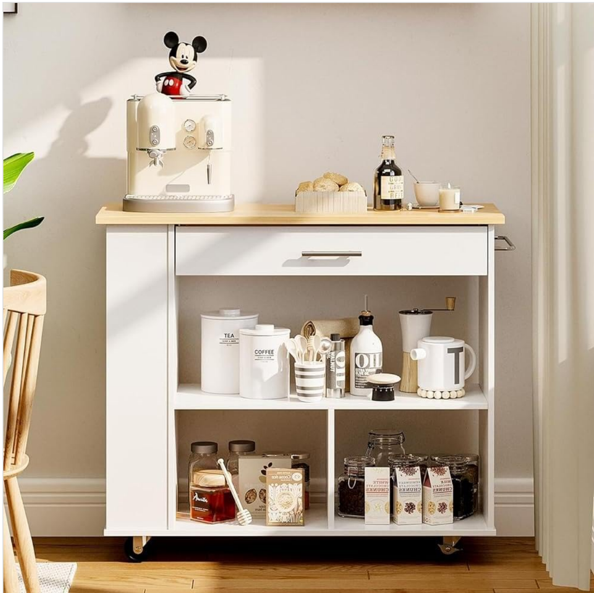
Figure 1.0: SUNLEI 40-Inch White Rolling Kitchen Cart.