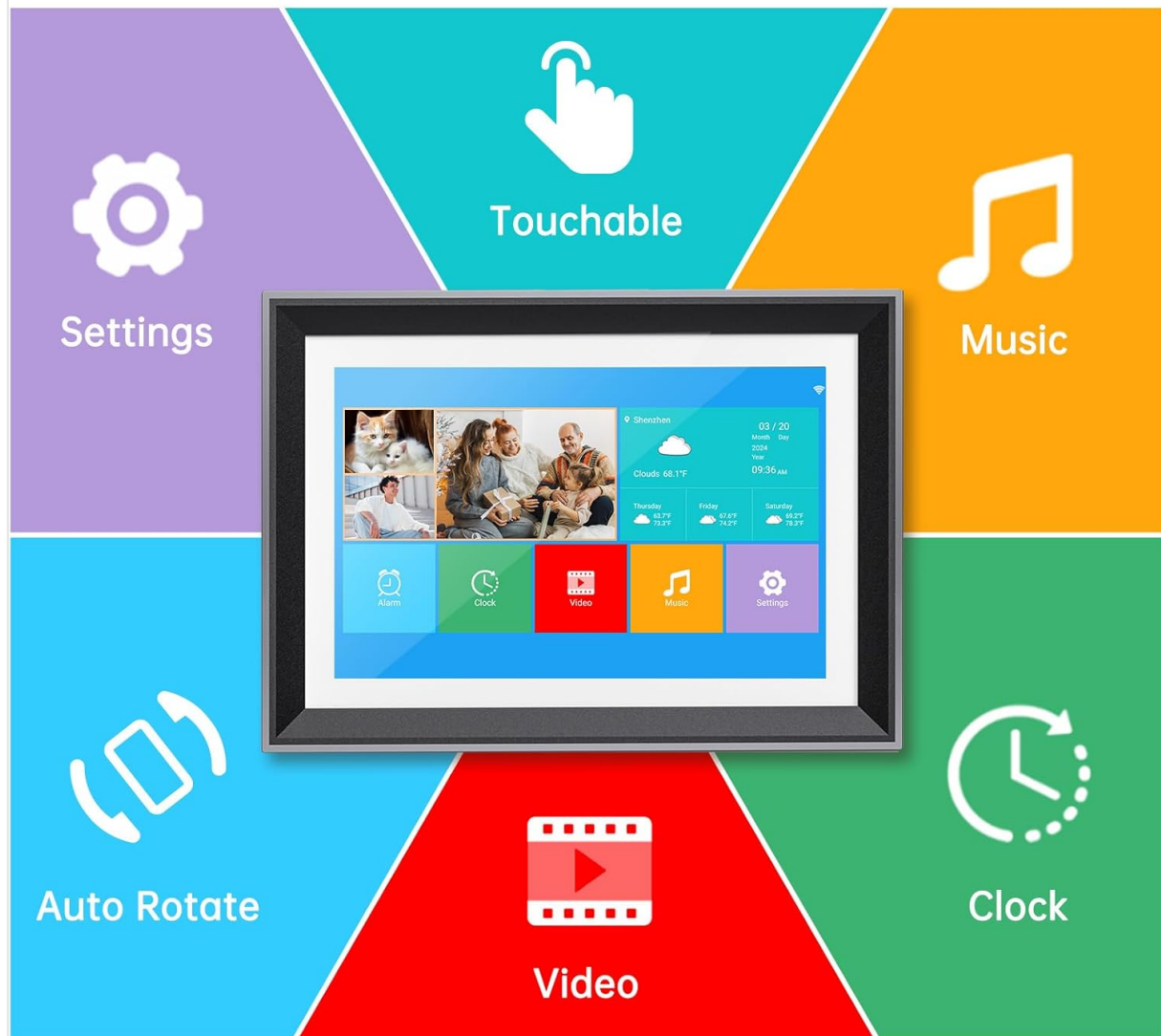
Figure 3: Main interface of the digital photo frame.