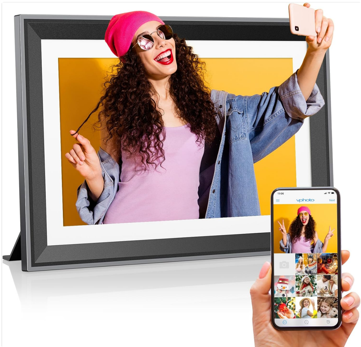
Figure 1: MELCAM 10-Inch WiFi Digital Photo Frame and companion app.