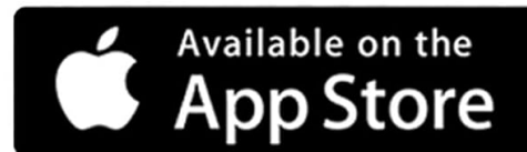
Figure 2: Vphoto App download options.