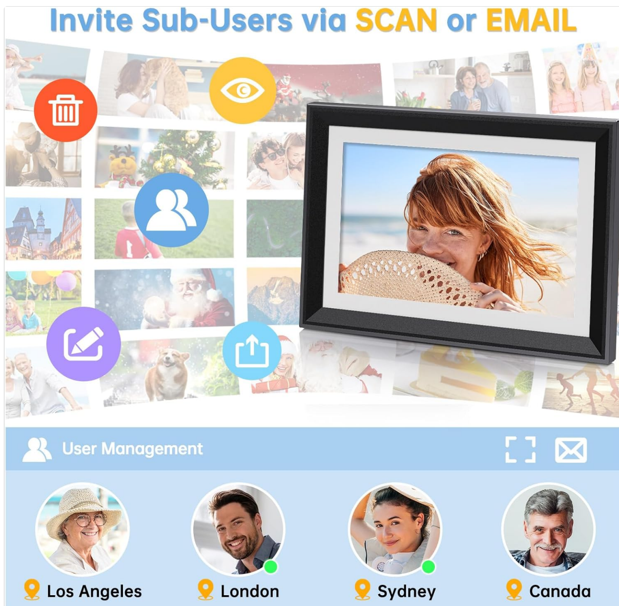
Figure 4: Multi-user sharing options.