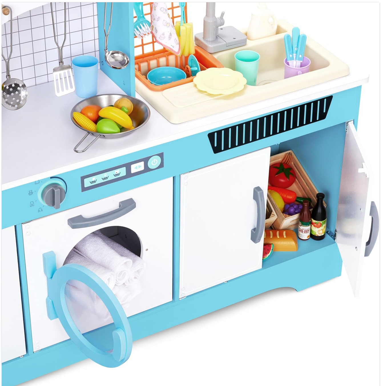
Image 7: A collection of included accessories, such as cookware (pot, frying pan), pretend food (fruits, vegetables), tableware (cups, plates, utensils), and cleaning supplies (bottle, brush).