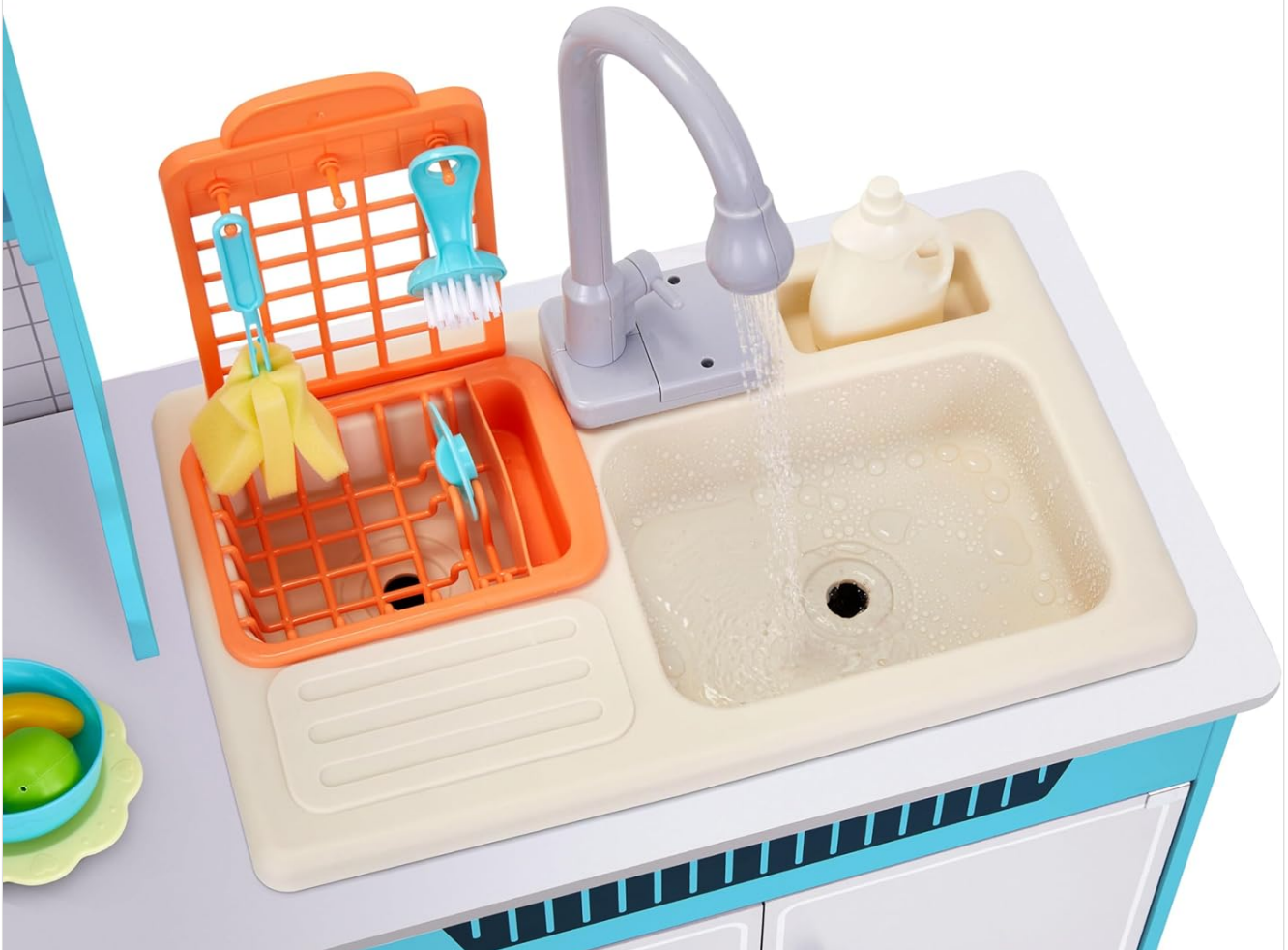
Image 5: A visual warning to keep the wooden kitchen dry, as splashing water can damage wooden components.

SPLASHING WATER ON KITCHEN CAN DAMAGE WOODEN PARTS