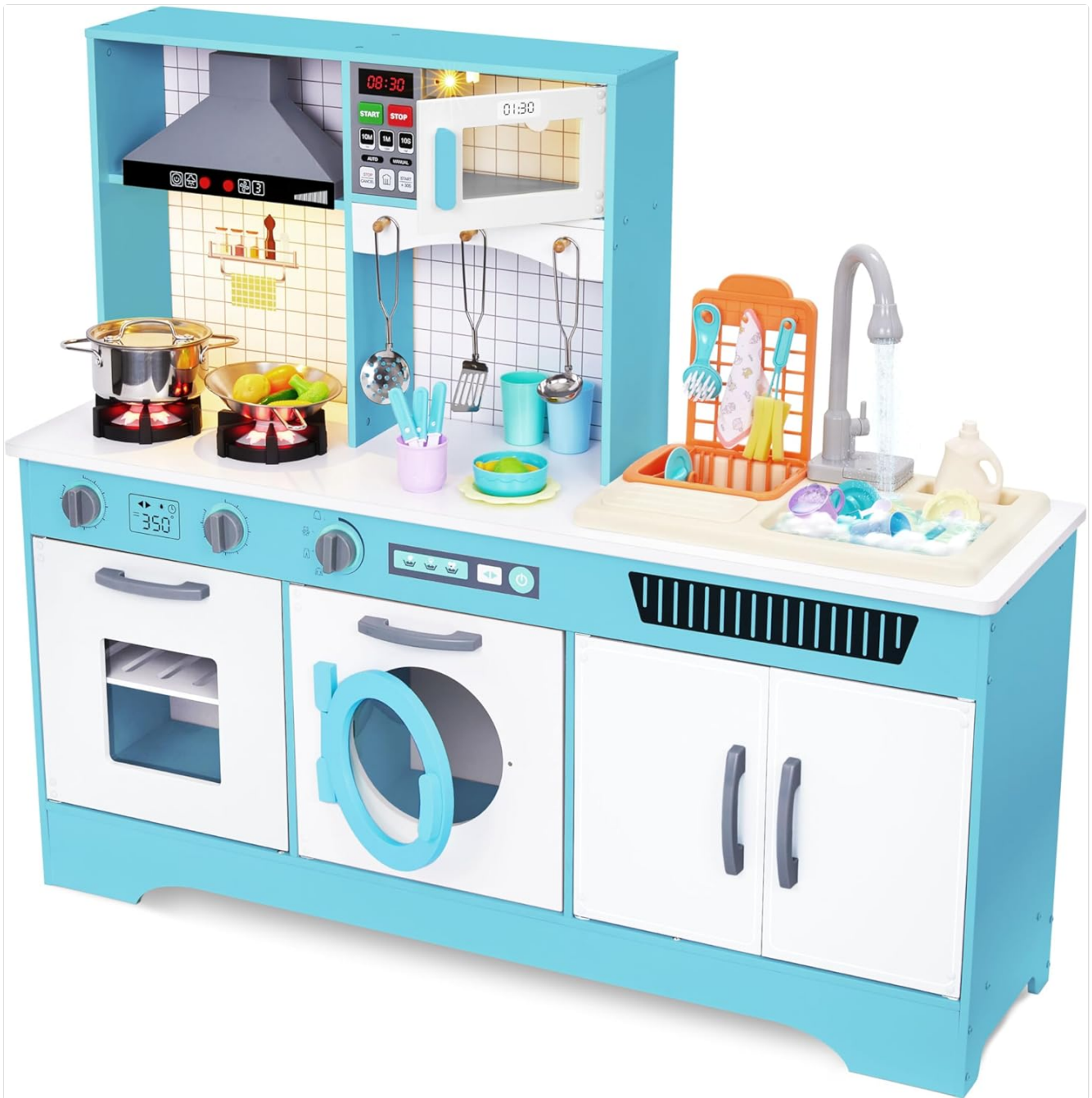
Image 1: The complete Lil' Jumbi Kids Wooden Blue Kitchen Set, showcasing its various components.