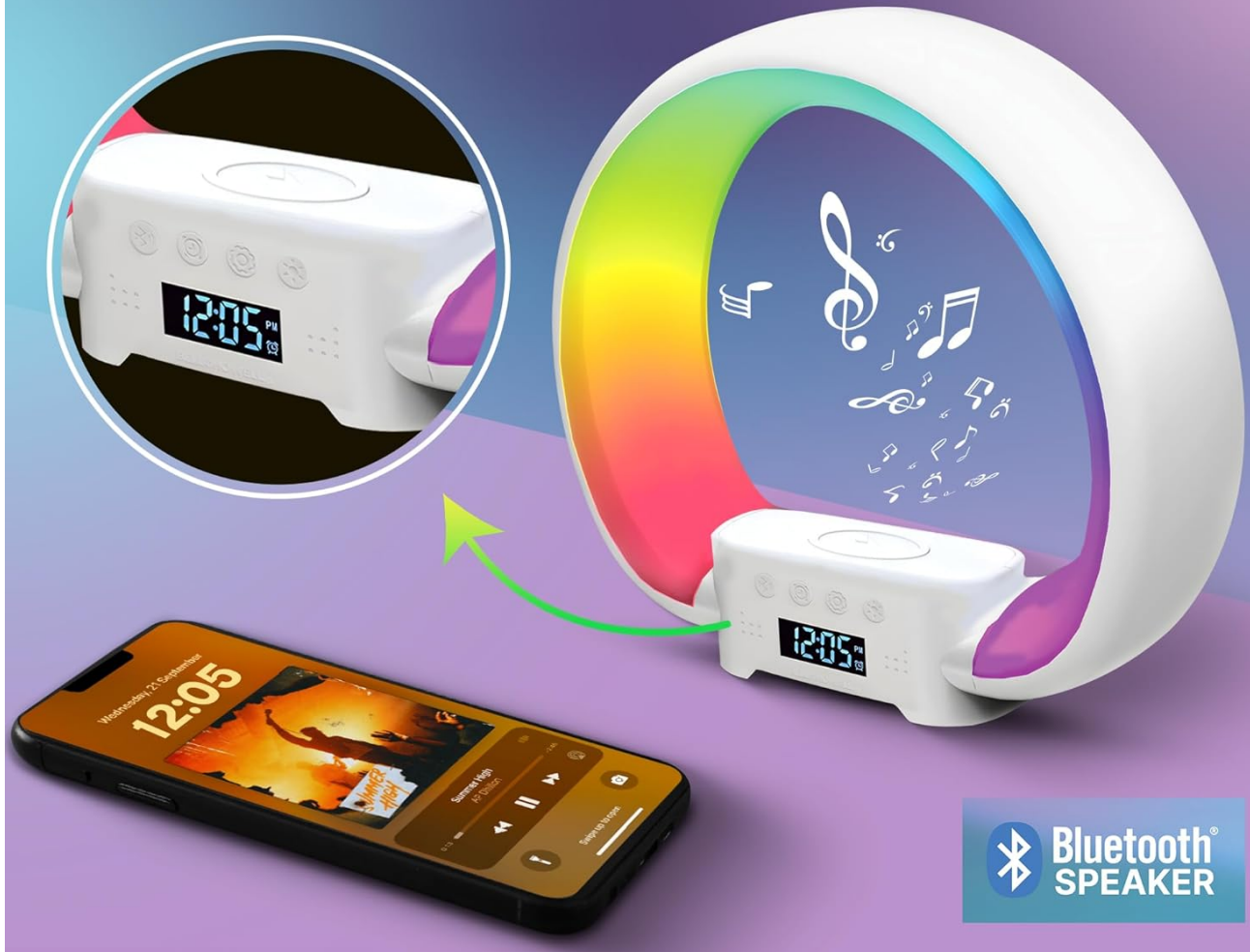
Image: The alarm clock displaying warm white light and a color wheel indicating 6 color modes, showcasing its lighting capabilities.