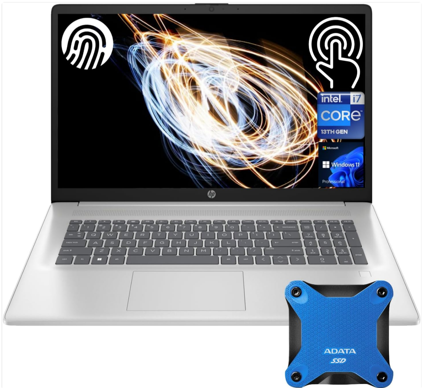
Figure 2.1: HP 17.3-inch Business Laptop with included ADATA 512GB External SSD.

This image displays the HP 17.3-inch Business Laptop in silver, alongside the bundled blue ADATA 512GB External Solid State Drive. The laptop features a large screen, full-size keyboard, and a touchpad. The external SSD is compact and portable.