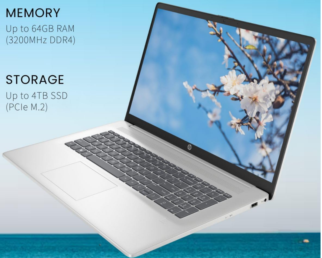
Figure 4.3: Key internal components of the HP laptop.

This image highlights the core specifications of the HP laptop, including the Intel Core i7-1355U processor, up to 64GB DDR4 RAM, and up to 4TB PCIe M.2 SSD storage, emphasizing its productivity capabilities.