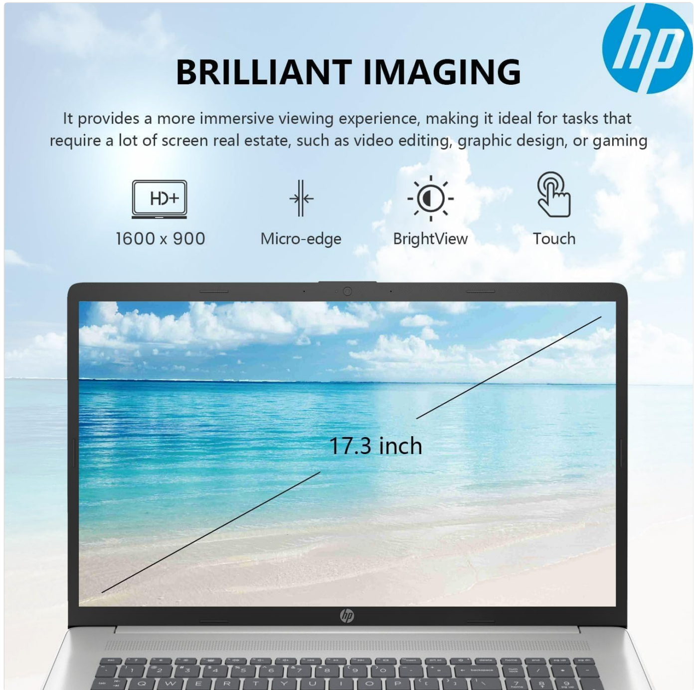
Figure 4.1: Visual representation of the HP laptop's 17.3-inch HD+ Touchscreen display.

This image highlights the 17.3-inch HD+ display of the HP laptop, emphasizing its touch capability, BrightView technology, and micro-edge design for an immersive viewing experience.