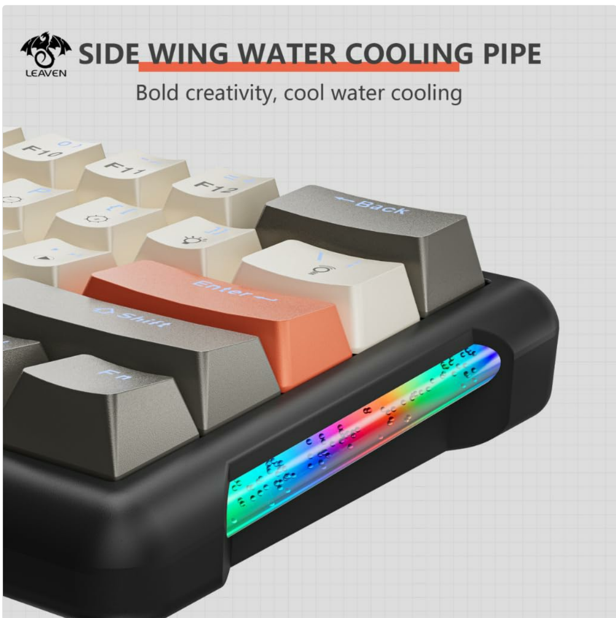
Image: Close-up side view of the Leaven K610 keyboard, highlighting the "Side Wing Water Cooling Pipe" which illuminates with RGB lighting, adding to the aesthetic appeal.