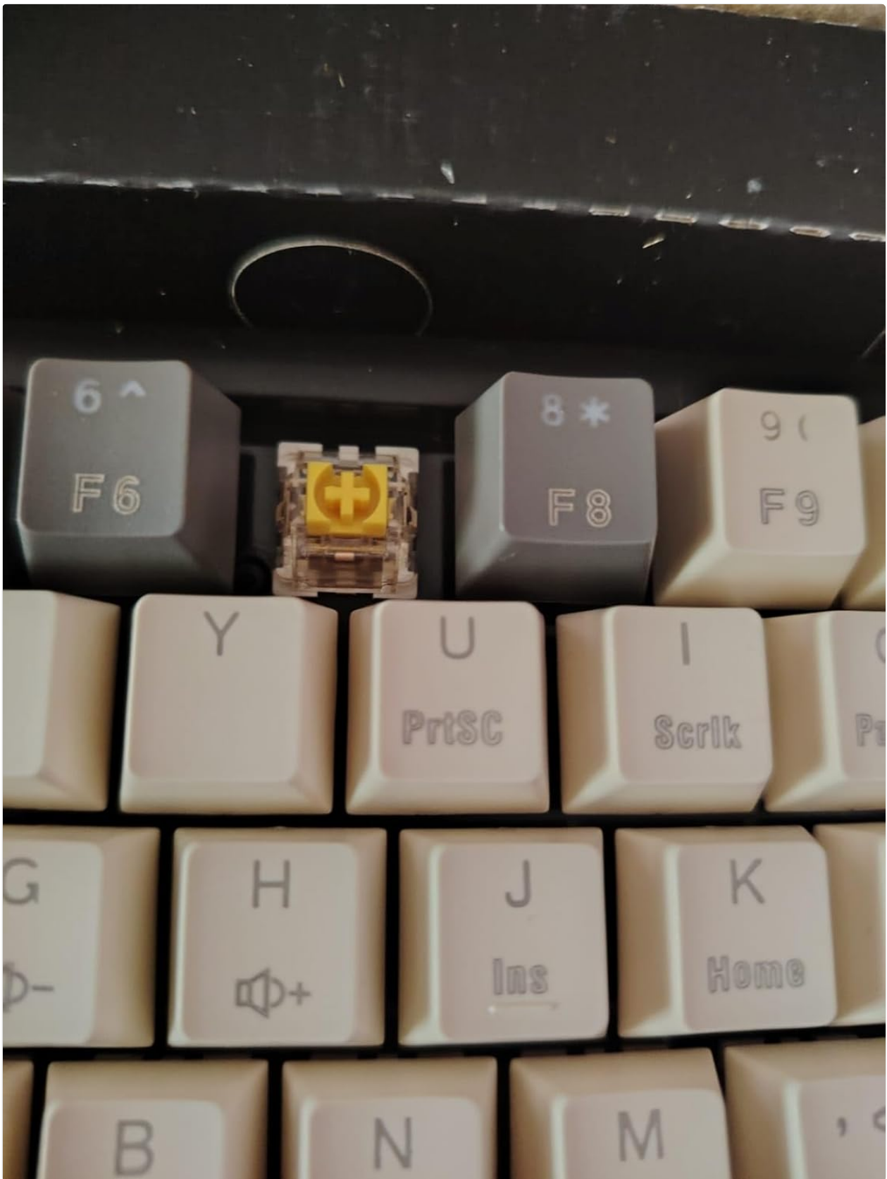
Image: A close-up view of a mechanical switch on the Leaven K610 keyboard, demonstrating the hot-swappable nature of the switches, allowing for easy replacement or customization.