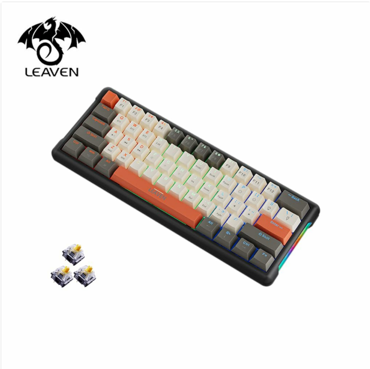
Image: Diagram illustrating the 61-key compact arrangement of the Leaven K610 keyboard, emphasizing its minimalist design while retaining essential functionality.

Note: Specific key combinations may vary slightly. Always refer to the legends printed on your keycaps.