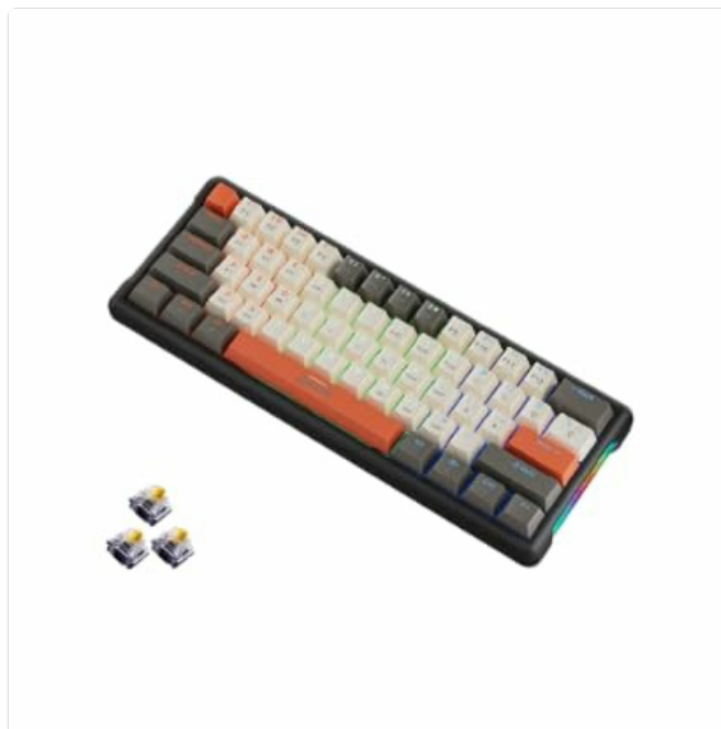
Image: Leaven K610 Tri-Mode Mechanical Wireless Gaming Keyboard, showcasing its compact design and included spare switches.

Thank you for choosing the Leaven K610 Tri-Mode Mechanical Wireless Gaming Keyboard. This manual provides detailed instructions on how to set up, operate, and maintain your new keyboard. Designed for versatility and performance, the K610 offers seamless connectivity via Bluetooth 5.0, 2.4 GHz wireless, and wired Type-C connections, along with vibrant RGB lighting and a satisfying mechanical typing experience.