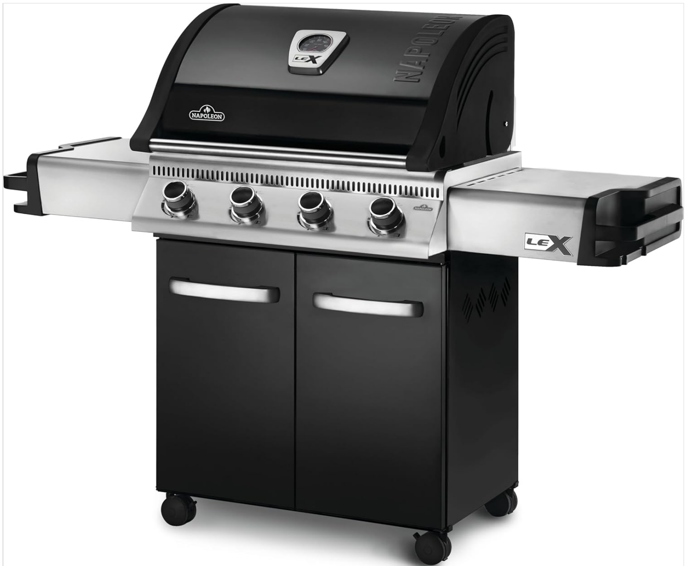
Figure 1: Front view of the assembled Napoleon 485 Propane Gas Grill with the lid closed, showcasing the stainless steel construction and control panel.