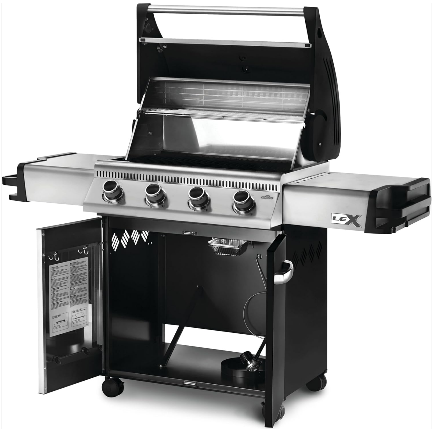
Figure 3: Side view of the Napoleon 485 Propane Gas Grill with the lid and cabinet doors open, showing the internal components and side shelf.