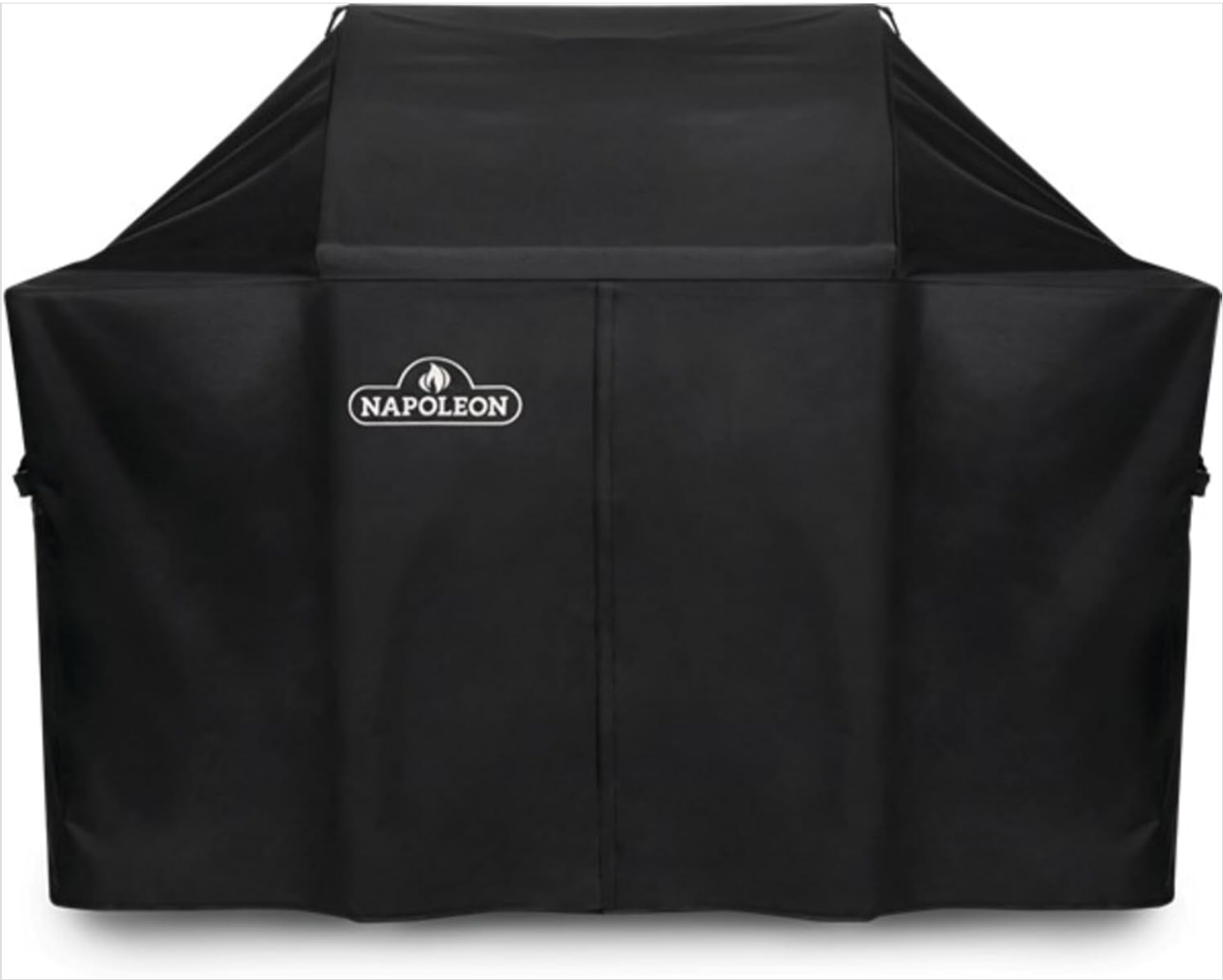
Figure 4: The Napoleon grill protected by a black cover, suitable for outdoor storage.