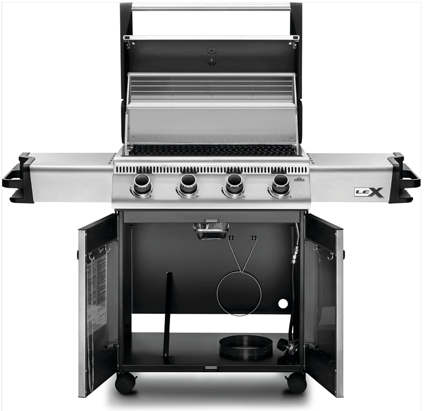
Figure 2: Front view of the Napoleon 485 Propane Gas Grill with the cabinet doors open, revealing the propane tank storage area and internal components.