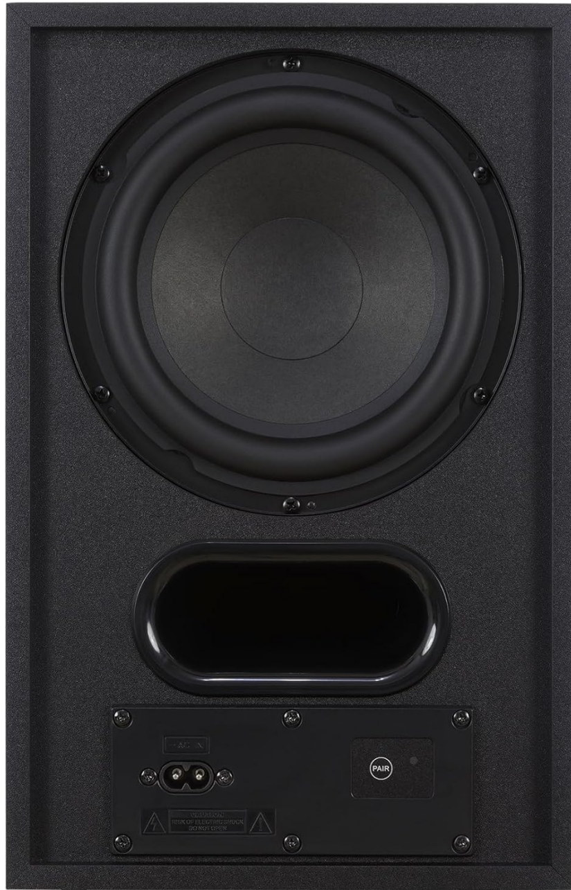
Image 4.1: Rear panel of the JBL Cinema SB180 Wireless Subwoofer. This image shows the power input and the "PAIR" button on the back of the subwoofer, essential for wireless connection.