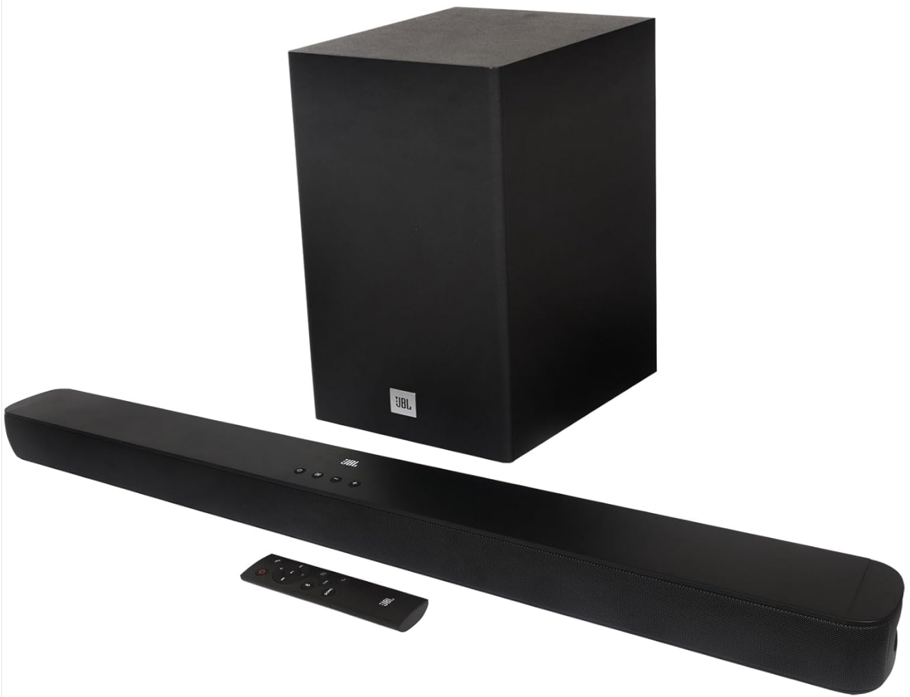
Image 1.1: JBL Cinema SB180 Soundbar, Wireless Subwoofer, and Remote Control. This image displays the complete JBL Cinema SB180 system, including the main soundbar unit, the cubic wireless subwoofer, and the compact remote control, all in black finish.