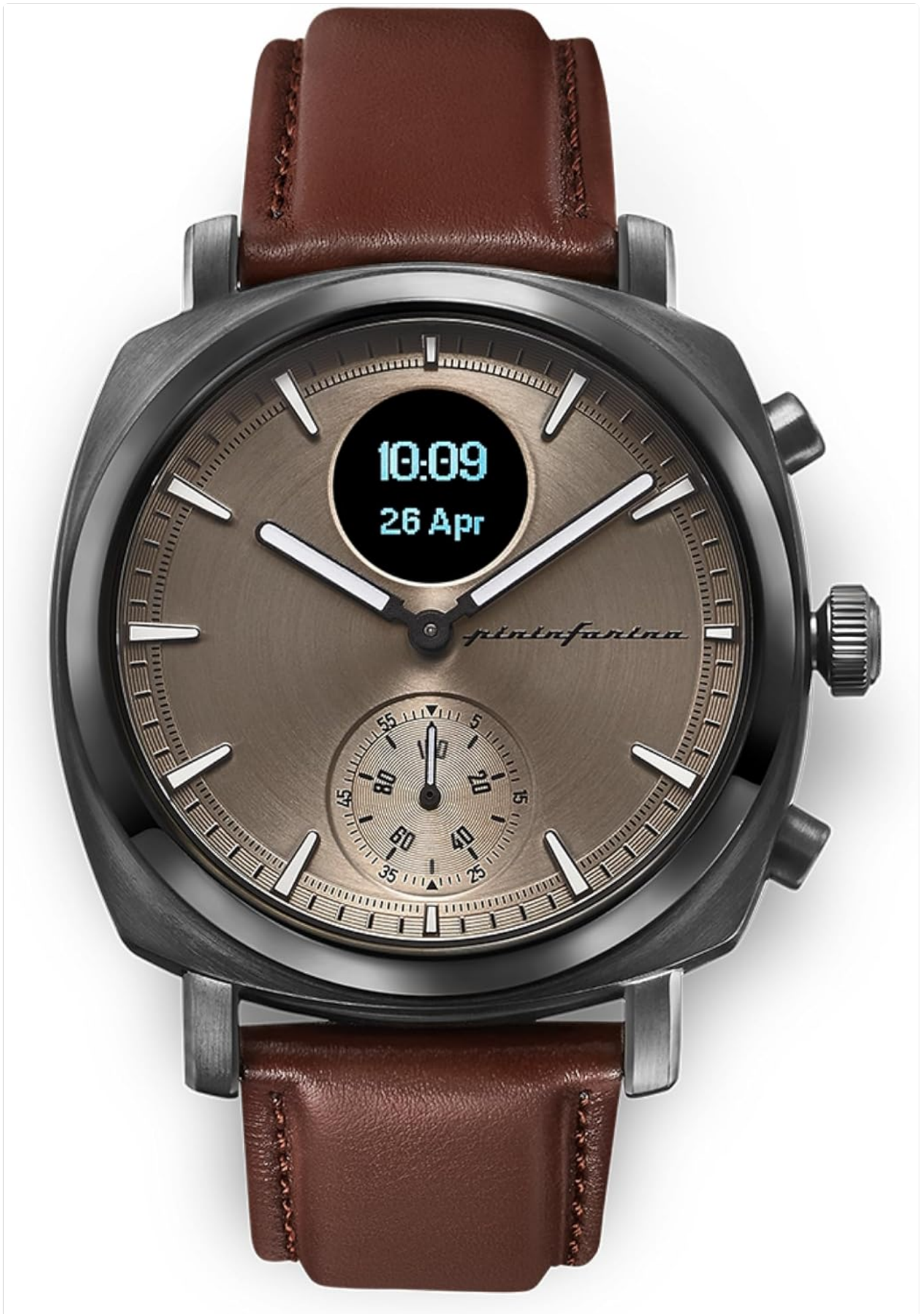
The main display of the Pininfarina Senso Hybrid Smartwatch.