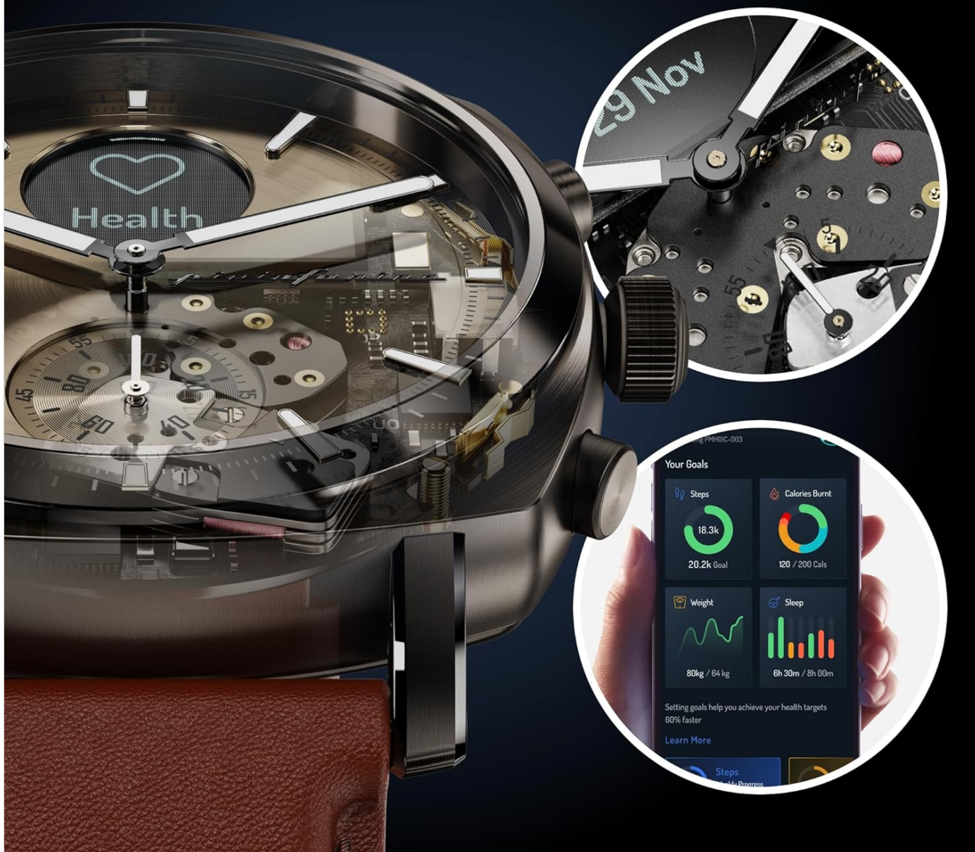
The watch's internal mechanics and digital display showing health data.