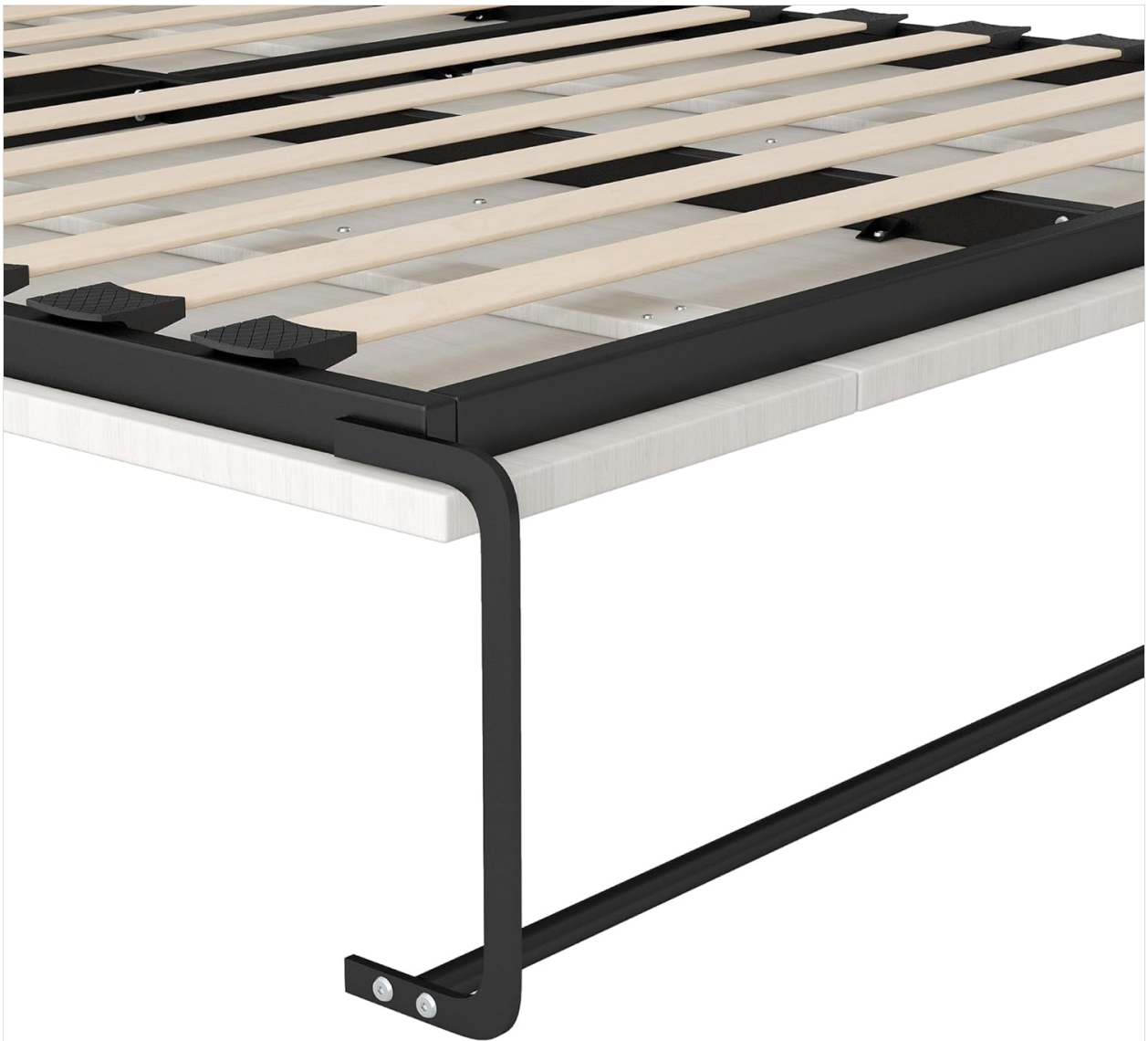
Figure 9: Detailed view of the sturdy bed frame and wooden slat support system.