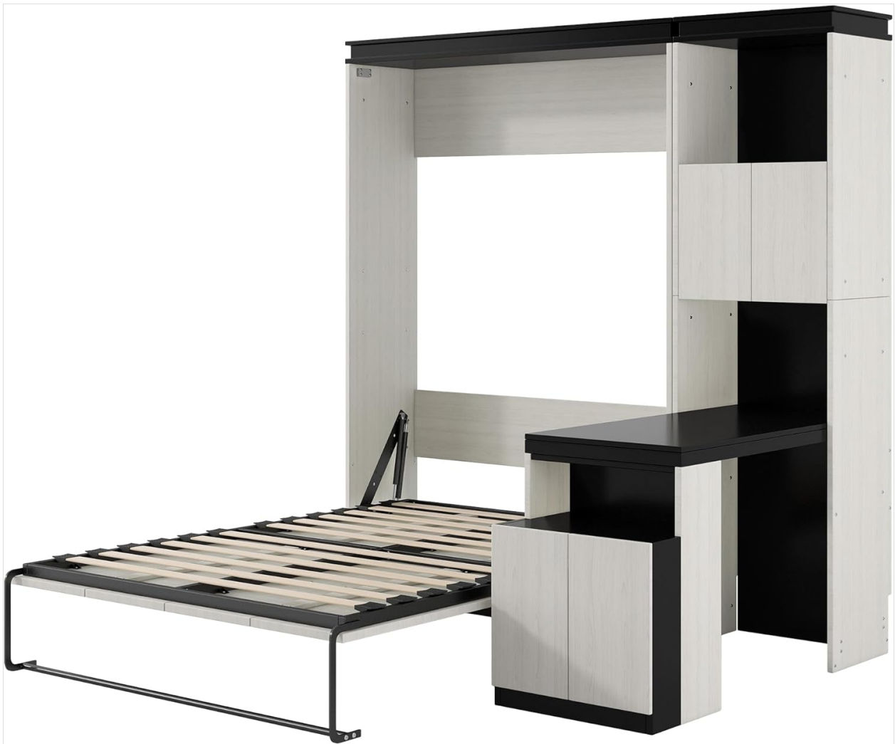
Figure 4: The Murphy Bed with the full-size bed frame partially extended from the cabinet.