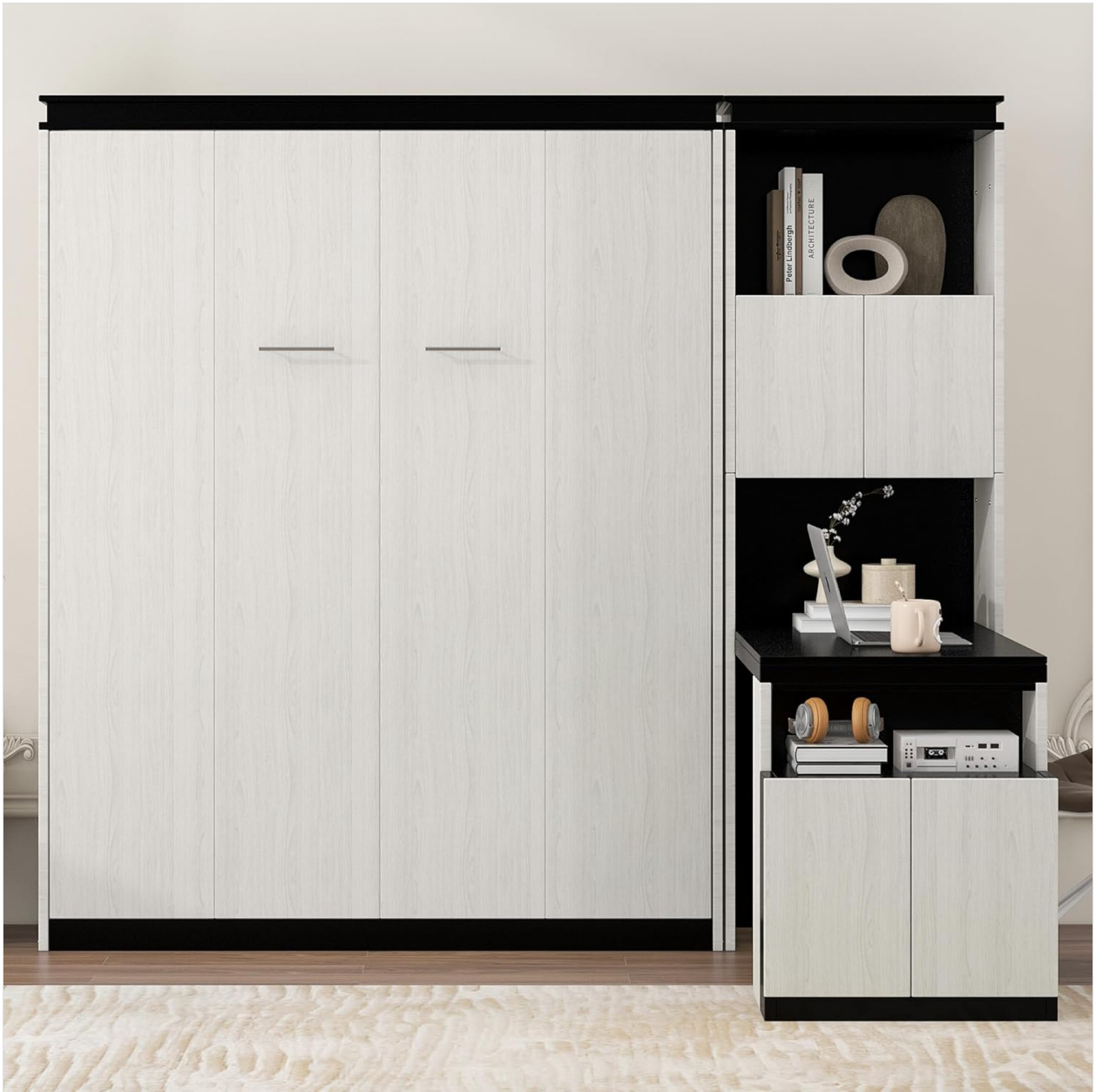
Figure 5: The Murphy Bed in its closed position, showcasing the functional desk and storage.