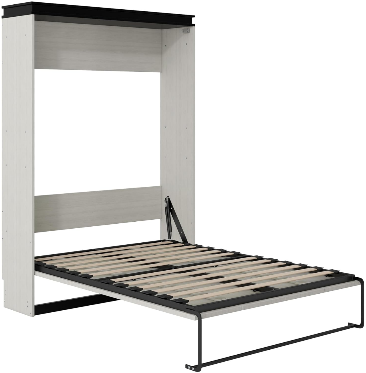
Figure 7: Side view of the Murphy Bed with the full-size bed extended, showing the support mechanism.