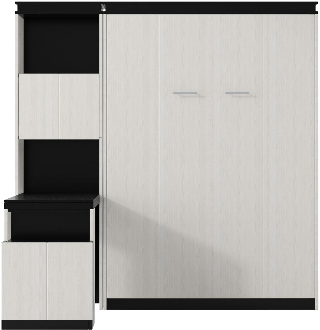
Figure 6: Front view of the Murphy Bed when fully closed, appearing as a sleek cabinet unit.