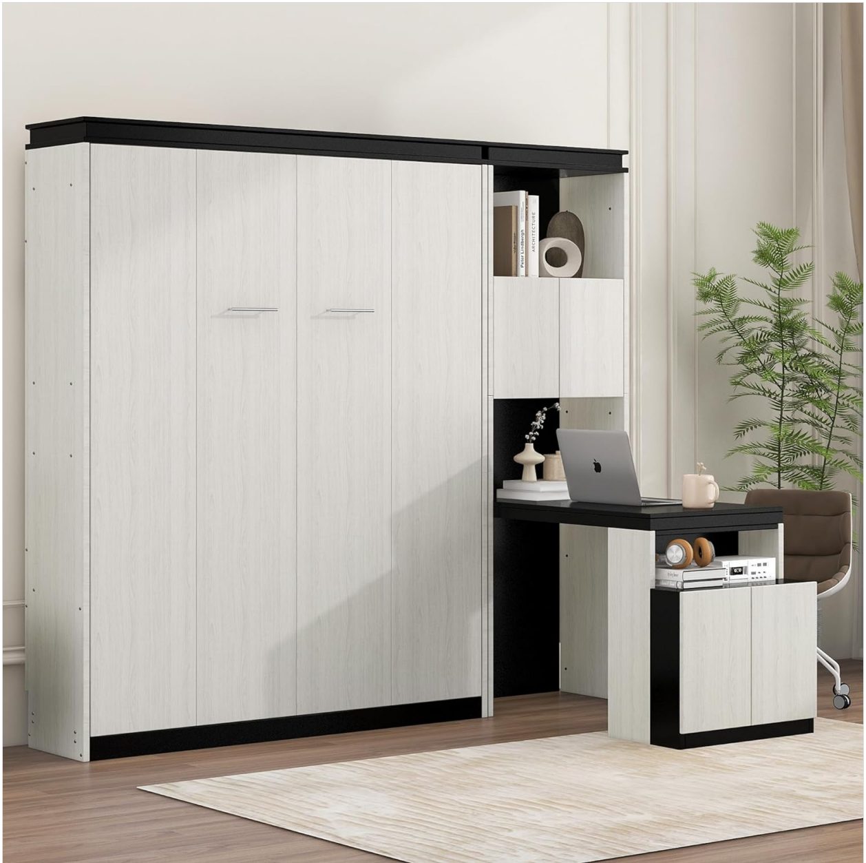
Figure 1: Fully assembled RuiSiSi Murphy Bed with desk and storage, shown in a room.