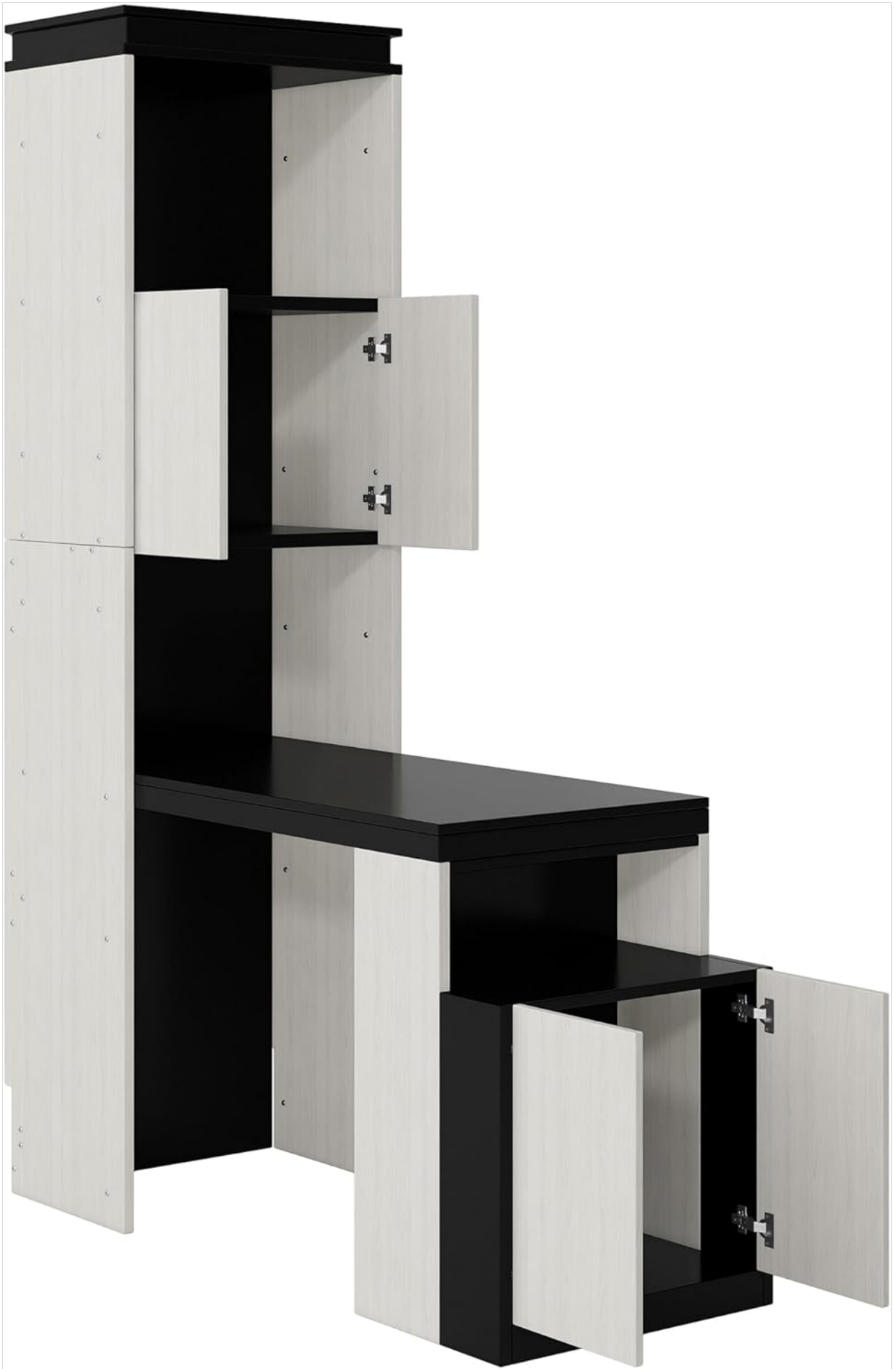
Figure 8: Close-up view of the desk area and storage cabinets with doors open.