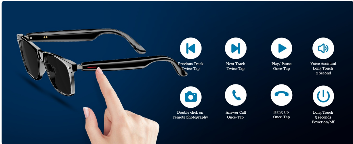
Figure 5: Touch control functions.

Your Blackview Smart Glasses feature intuitive touch controls located on the temples: