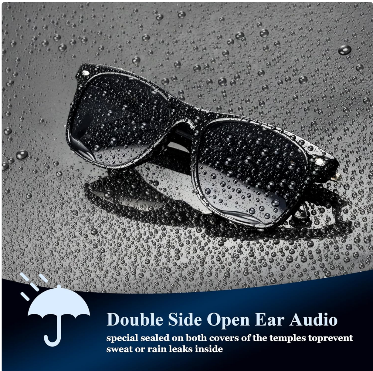
Figure 7: Smart Glasses demonstrating water resistance.