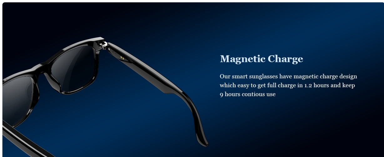
Figure 4: Magnetic charging connection.