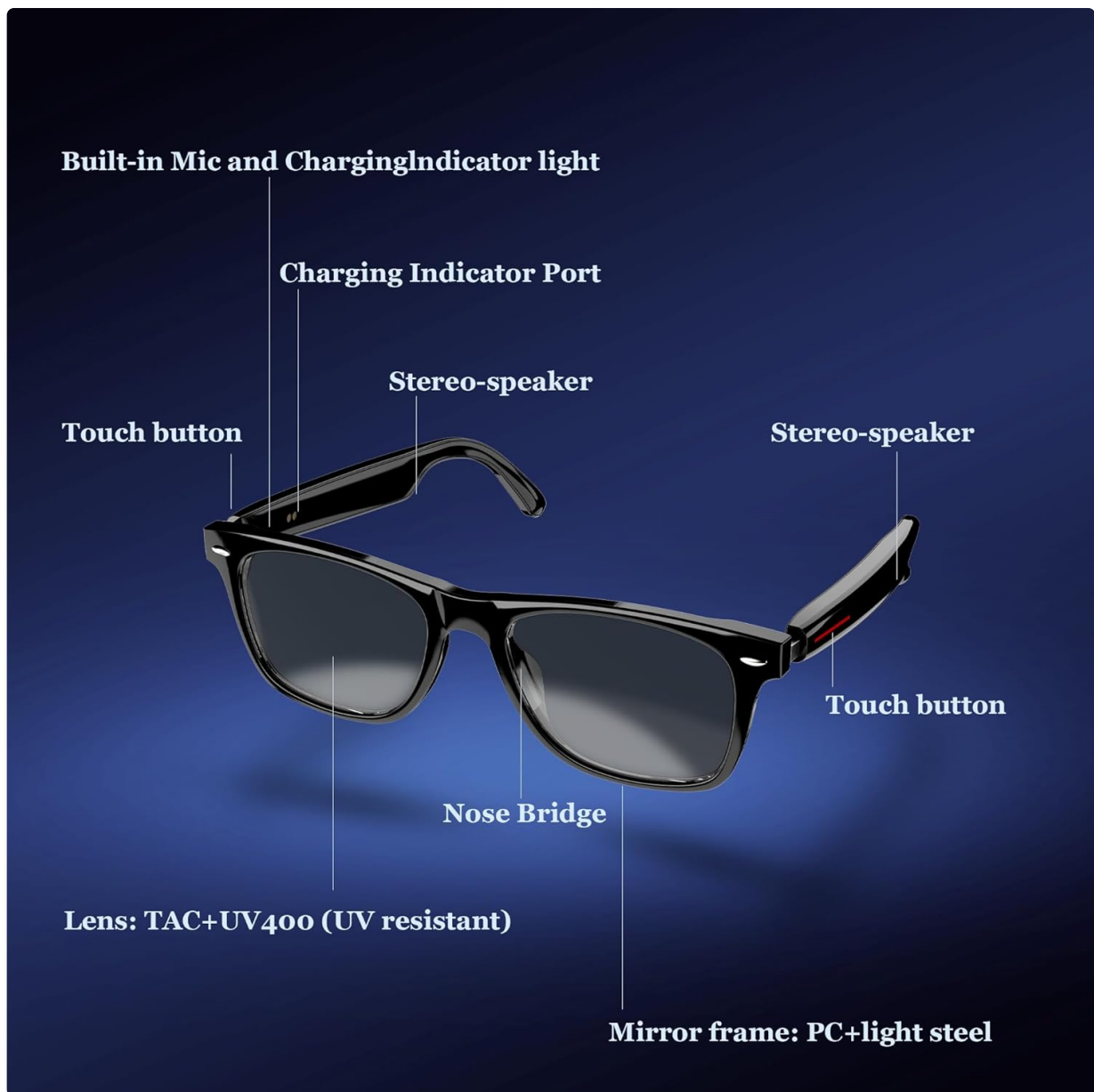
Figure 2: Key components of the Smart Glasses.