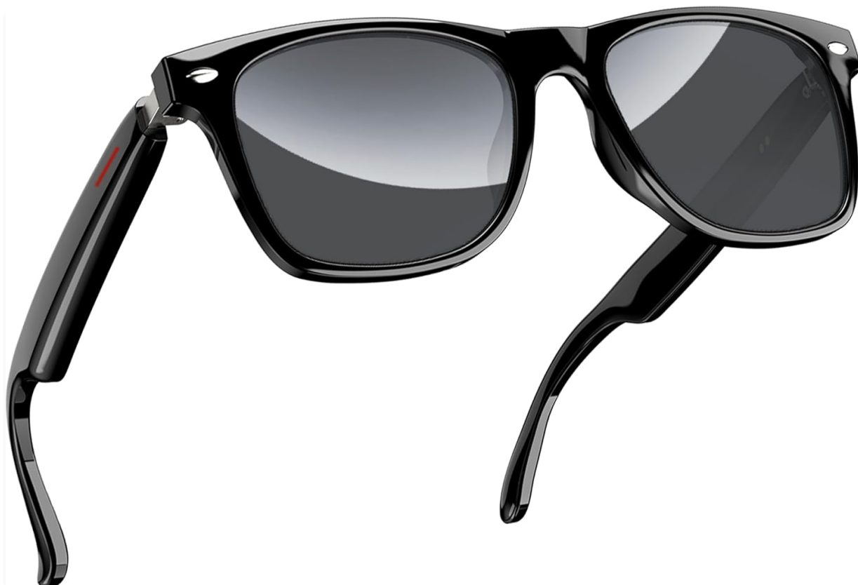
Figure 1: Front view of Blackview Smart Glasses.

Thank you for choosing Blackview Smart Glasses. These innovative sunglasses combine stylish design with advanced audio technology, allowing you to enjoy music, make calls, and interact with your voice assistant while staying aware of your surroundings. This manual provides detailed instructions for setup, operation, and maintenance to ensure optimal performance and longevity of your device.