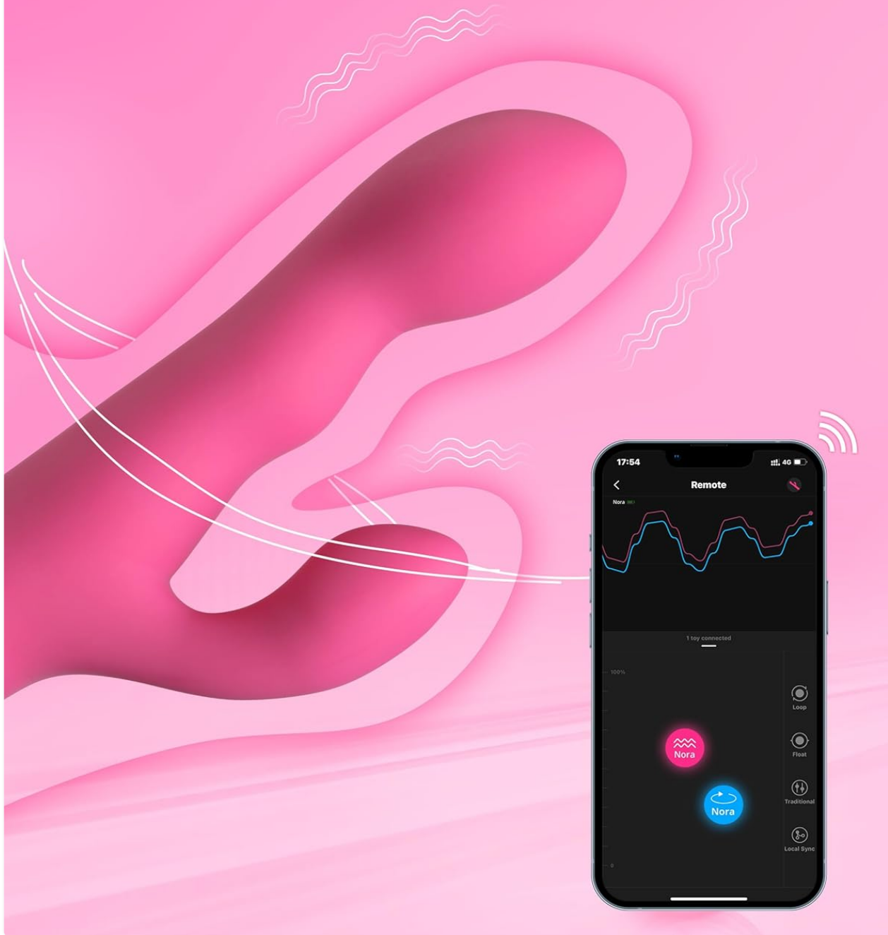
Image 4: LOVENSE Nora demonstrating app control for various vibration settings.