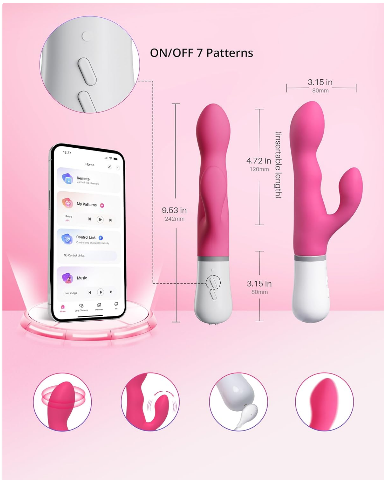
Image 5: LOVENSE Nora showing physical buttons for power and pattern selection.