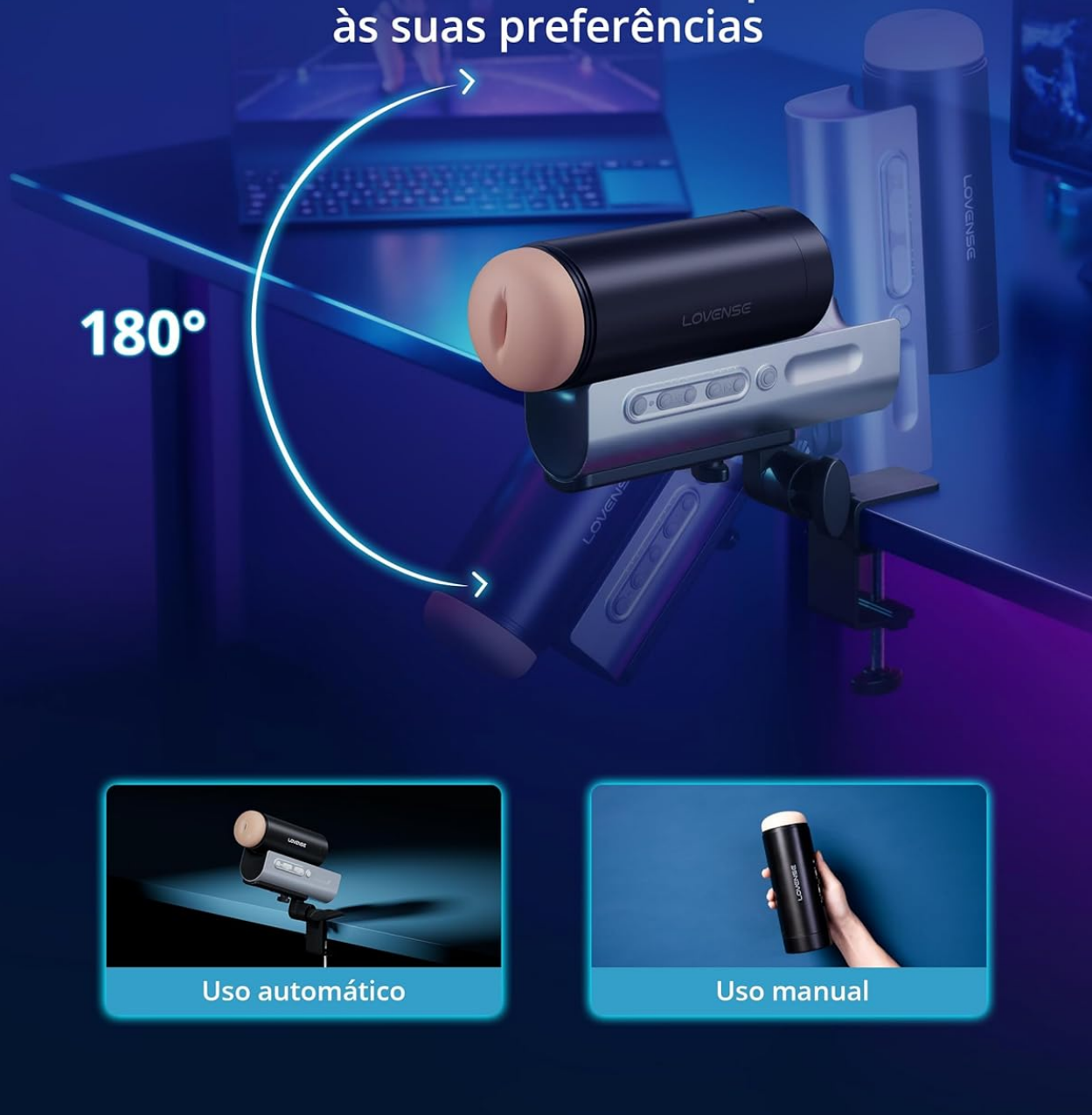
Image 3: LOVENSE Solace Pro demonstrating automatic and manual use options.

Modo automático com as mãos livres ou controle manual Uso flexível para atender às suas preferências