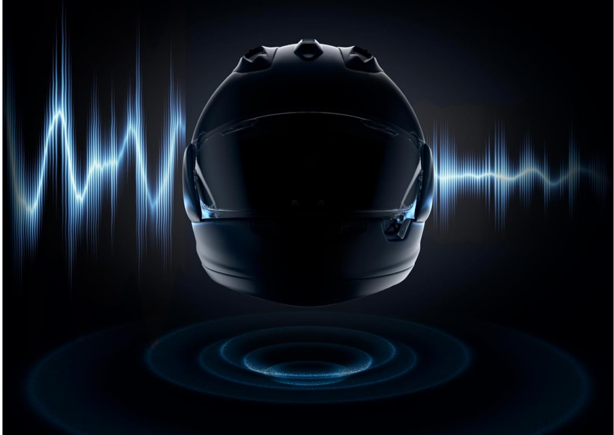
Image 4.5: A graphic depicting a helmet with sound waves emanating from it, illustrating the intelligent ENC/DSP noise cancellation technology. The text indicates clear communication at speeds up to 160 km/h.

Speed 160km/h, Communication Voice Remains Crystal Clear