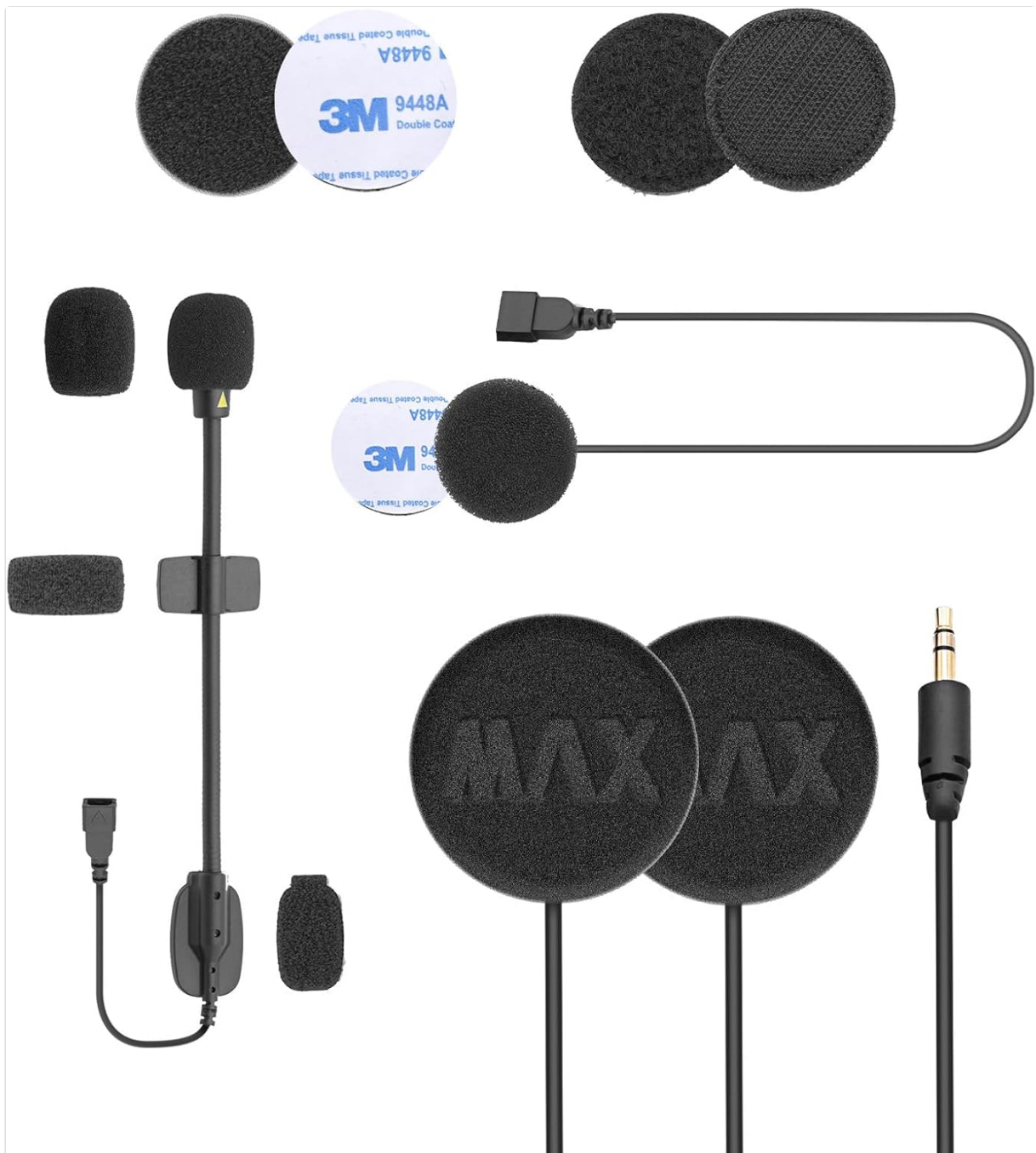
Image 3.2: Various components of the ASMAX F1 headset laid out, including speakers, microphones, and adhesive pads, ready for helmet installation. This image details the individual parts required for setting up the headset within a motorcycle helmet.