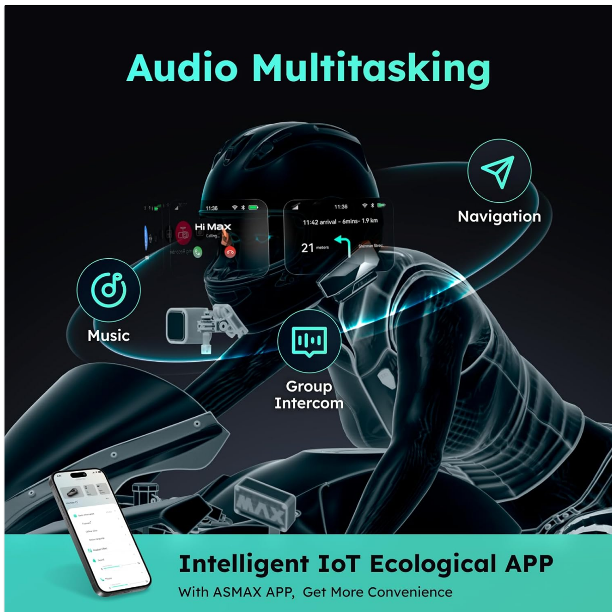
Image 4.4: A visual representation of a motorcyclist experiencing audio multitasking, with icons for music, navigation, and group intercom active simultaneously. The image also shows a smartphone displaying the ASMAX app, indicating integration with an IoT Ecological APP.