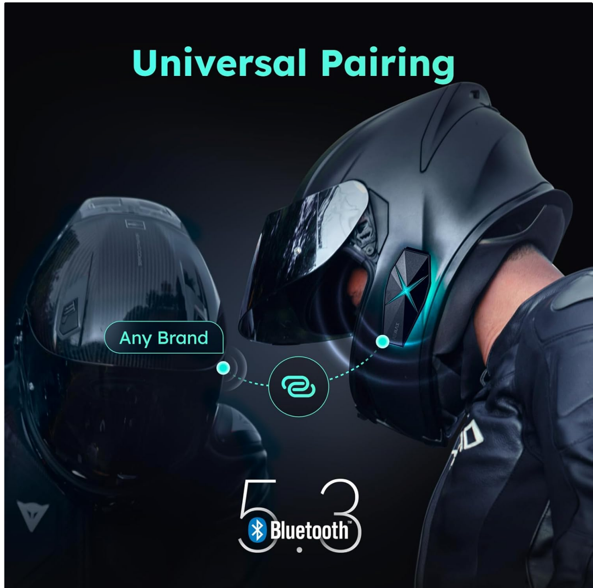
Image 4.1: Two motorcycle helmets, one equipped with the ASMAX F1 headset and another with a different brand headset, illustrating the universal Bluetooth 5.3 pairing capability. This image demonstrates the F1 headset's compatibility with various other Bluetooth devices.

The ASMAX F1 supports universal pairing with other brands of Bluetooth motorcycle headsets.