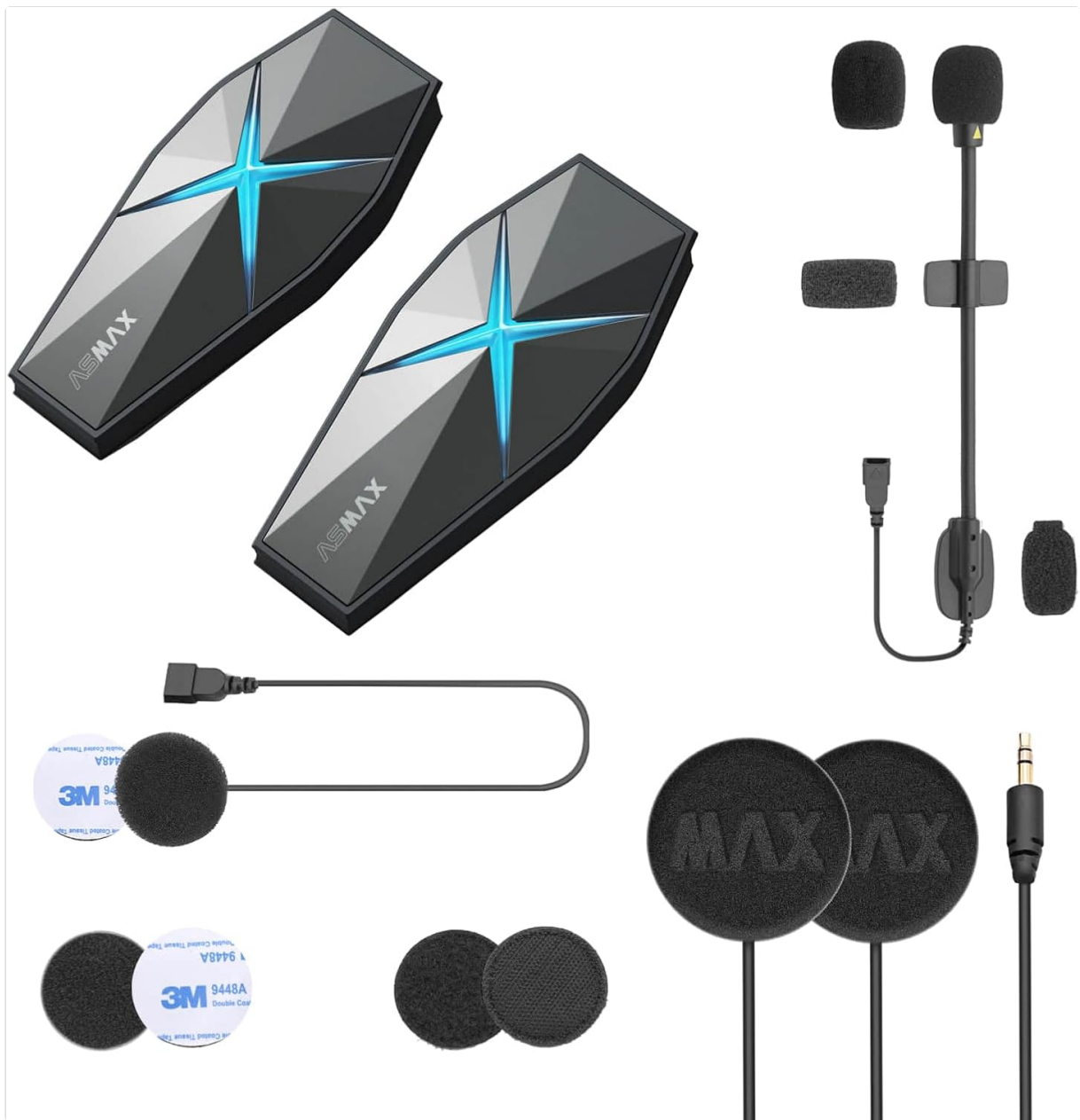
Image 2.1: Overview of ASMAX F1 Motorcycle Bluetooth Headset and included accessories. The image displays two main headset units, two sets of helmet speakers, two boom microphones, two soft wire microphones, magnetic mounting bases, USB-C charging cables, and various adhesive pads.