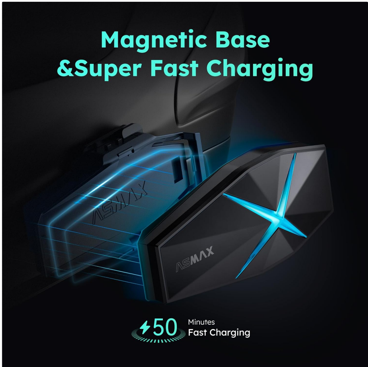
Image 3.1: The ASMAX F1 headset unit magnetically attaching to its charging base, illustrating the fast charging capability. The image highlights the magnetic connection and indicates a 50-minute fast charging time.