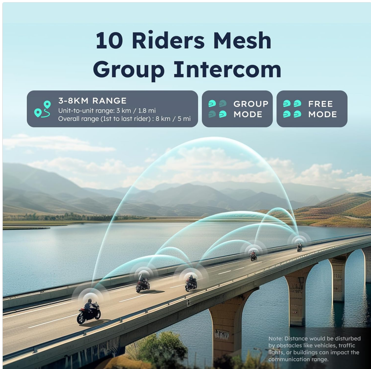
Image 4.2: An illustration of multiple motorcycles riding across a bridge, connected by a mesh network, demonstrating the 10-rider group intercom feature with a range of 3-8 KM. The image highlights both Group Mode and Free Mode options.

Refer to the quick start guide for specific button sequences to initiate and manage intercom modes.