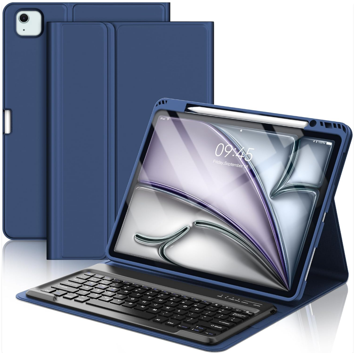
Image 1.1: The SENGIRCH iPad Air 13 inch Case Keyboard in Navy Blue, shown with an iPad inserted and the keyboard detached.