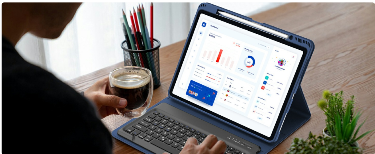
Image 4.2: Detailed steps for pairing the magnetic Bluetooth keyboard with the iPad.