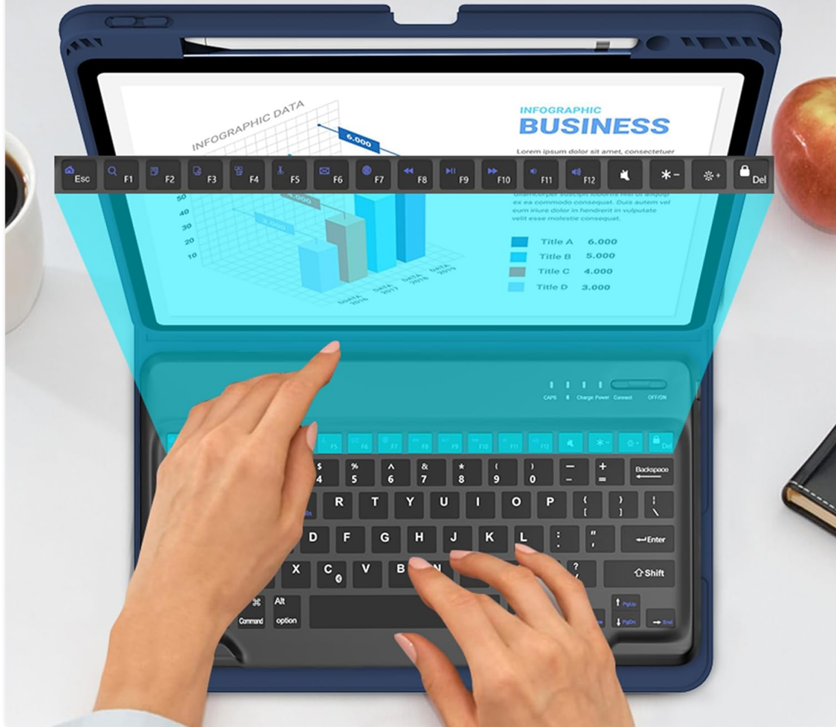
Image 5.2: A close-up of the keyboard, showing the dedicated multi-function shortcut keys for enhanced productivity.