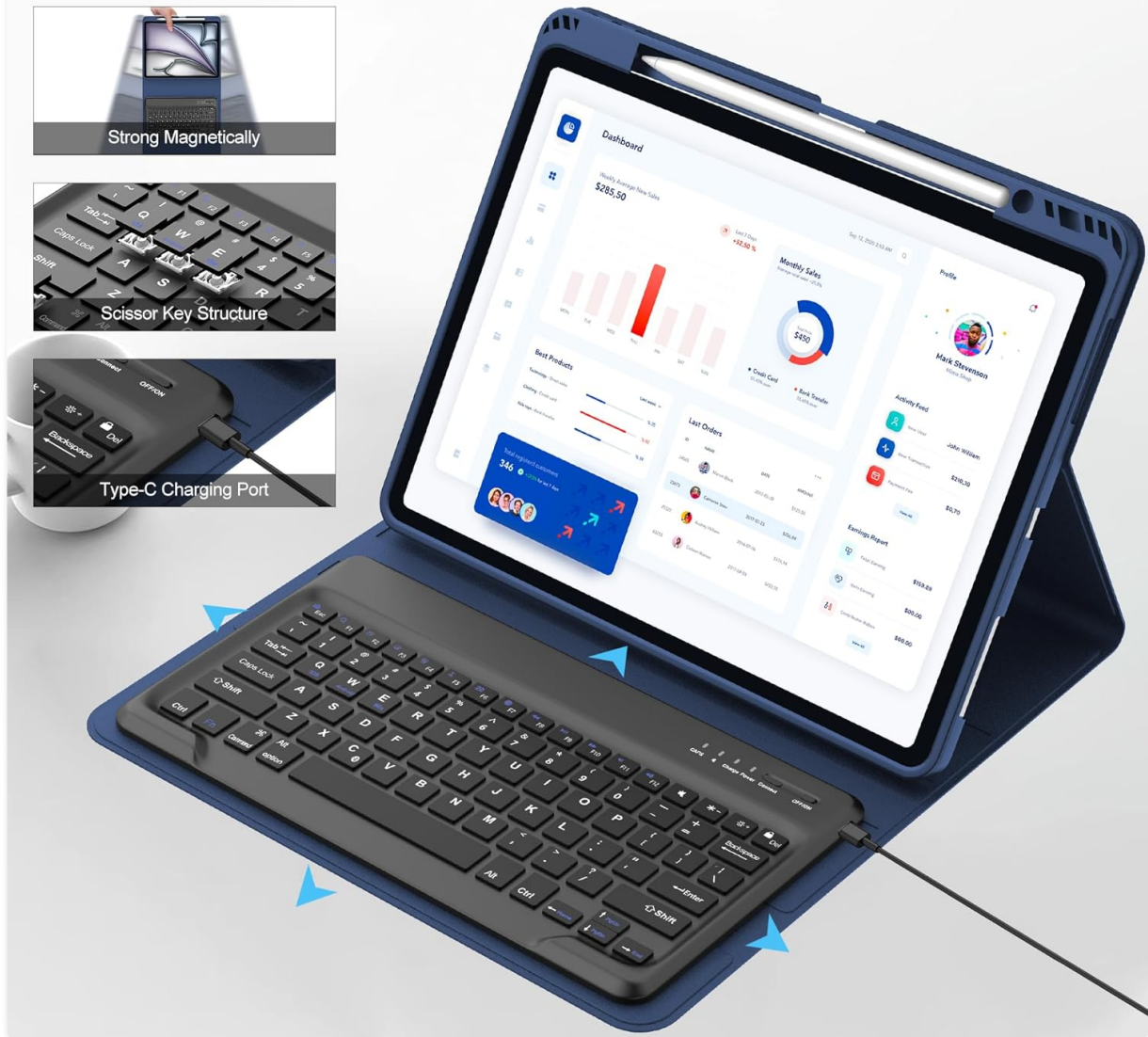
Image 4.1: The detachable Bluetooth keyboard connected to the iPad case, highlighting the Type-C charging port and scissor key structure.