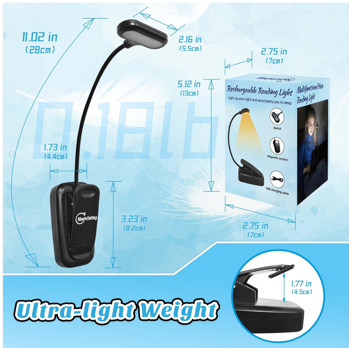
Image 7.1: Detailed dimensions and ultra-light weight of the book light.