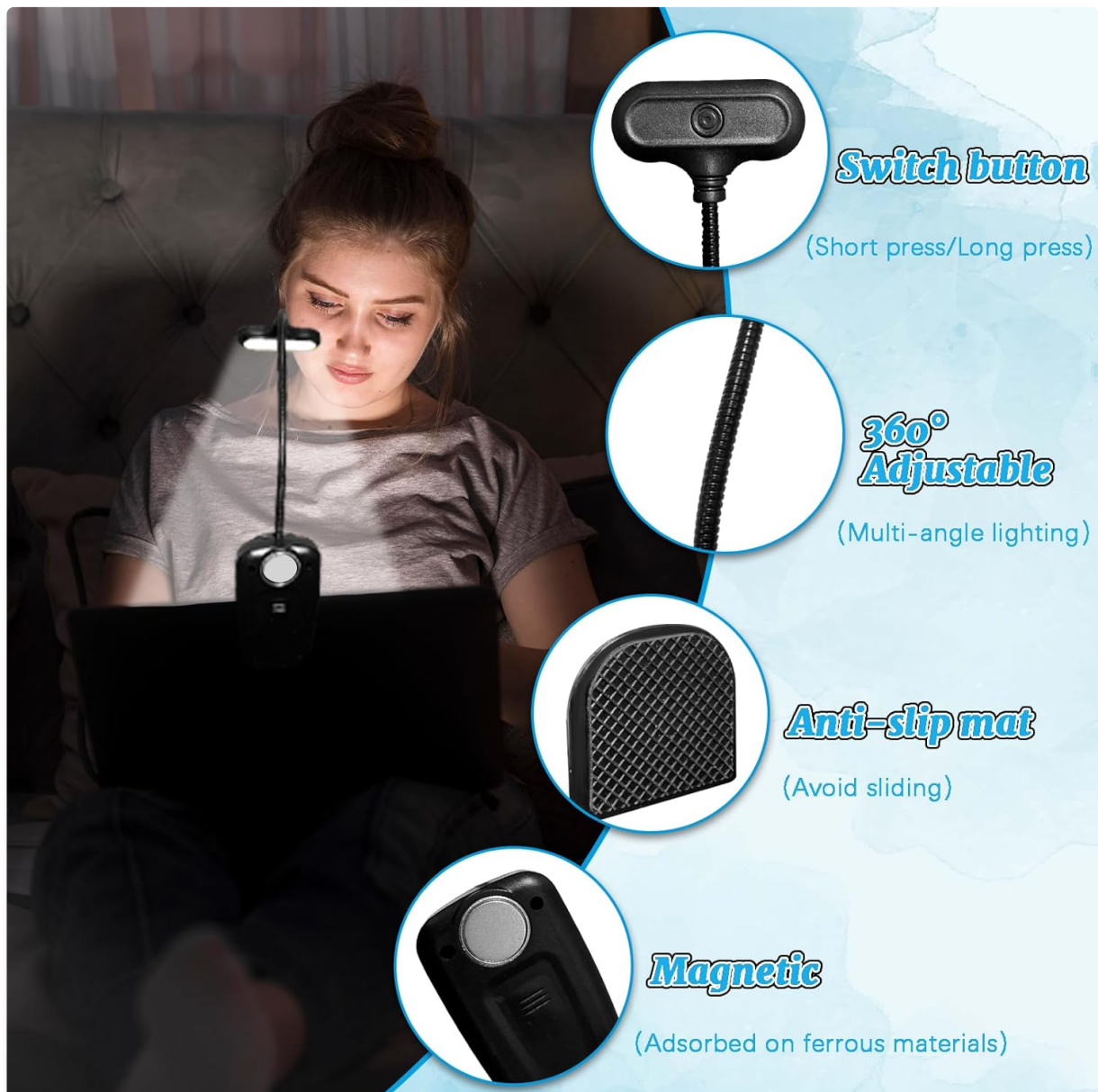
Image 4.1: Key operational features including the switch, 360° adjustable neck, anti-slip mat, and magnetic base.