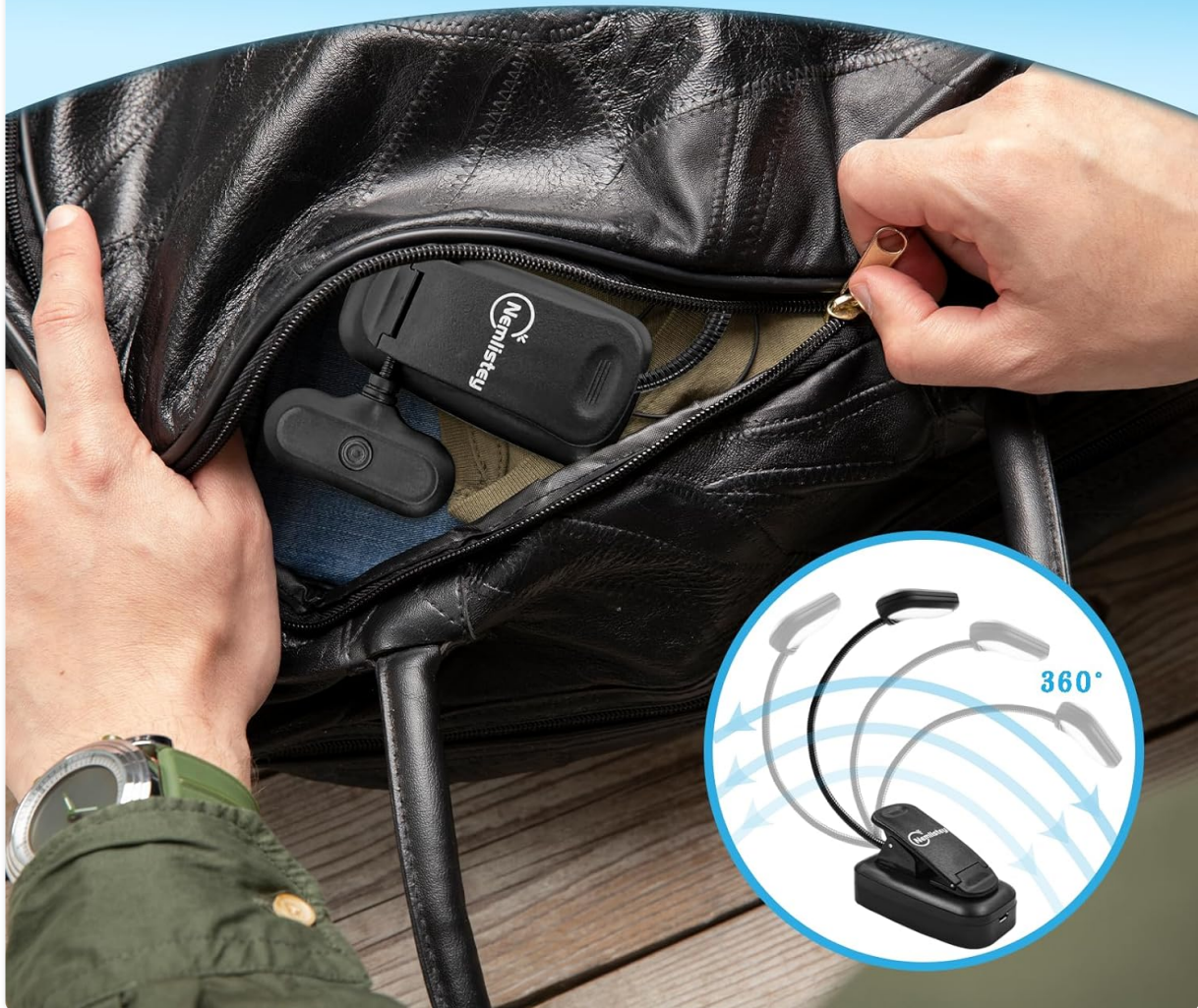
Image 4.2: The light's adjustable and portable design, showing it can be easily folded and carried.