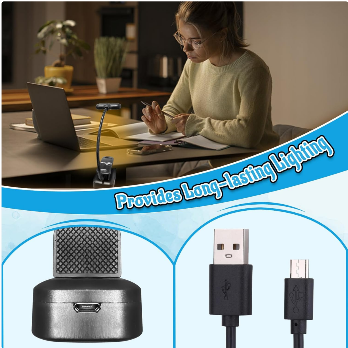
Image 3.1: The book light features a USB charging port for convenient power replenishment.