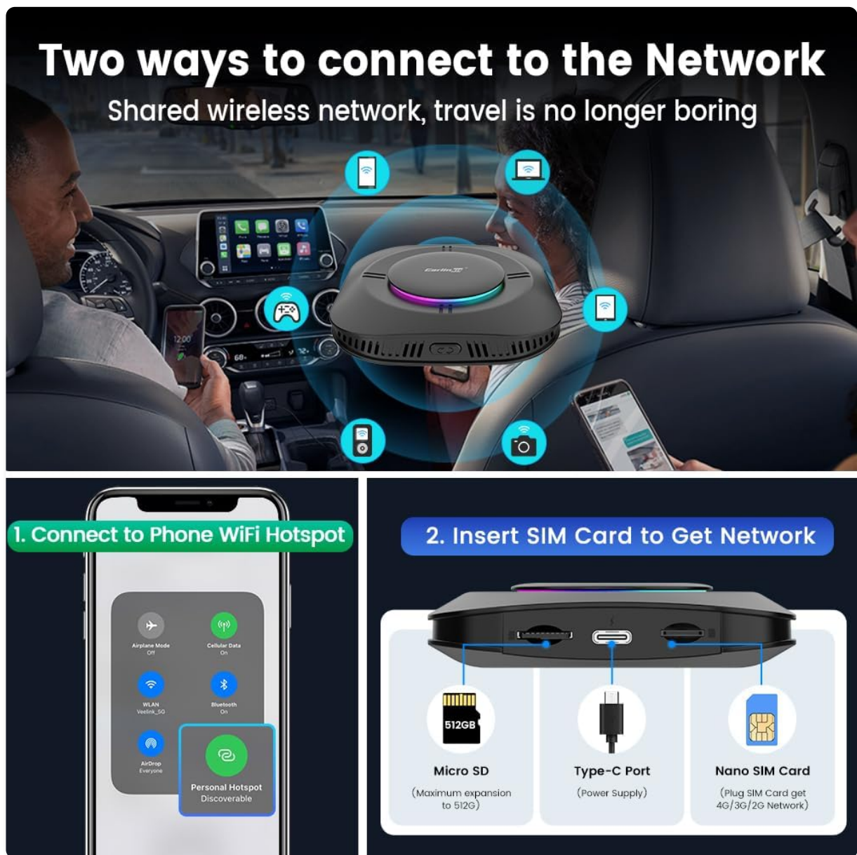
Figure 8: This image illustrates the two methods for network connection: connecting to a phone's Wi-Fi hotspot or inserting a Nano SIM card directly into the device.