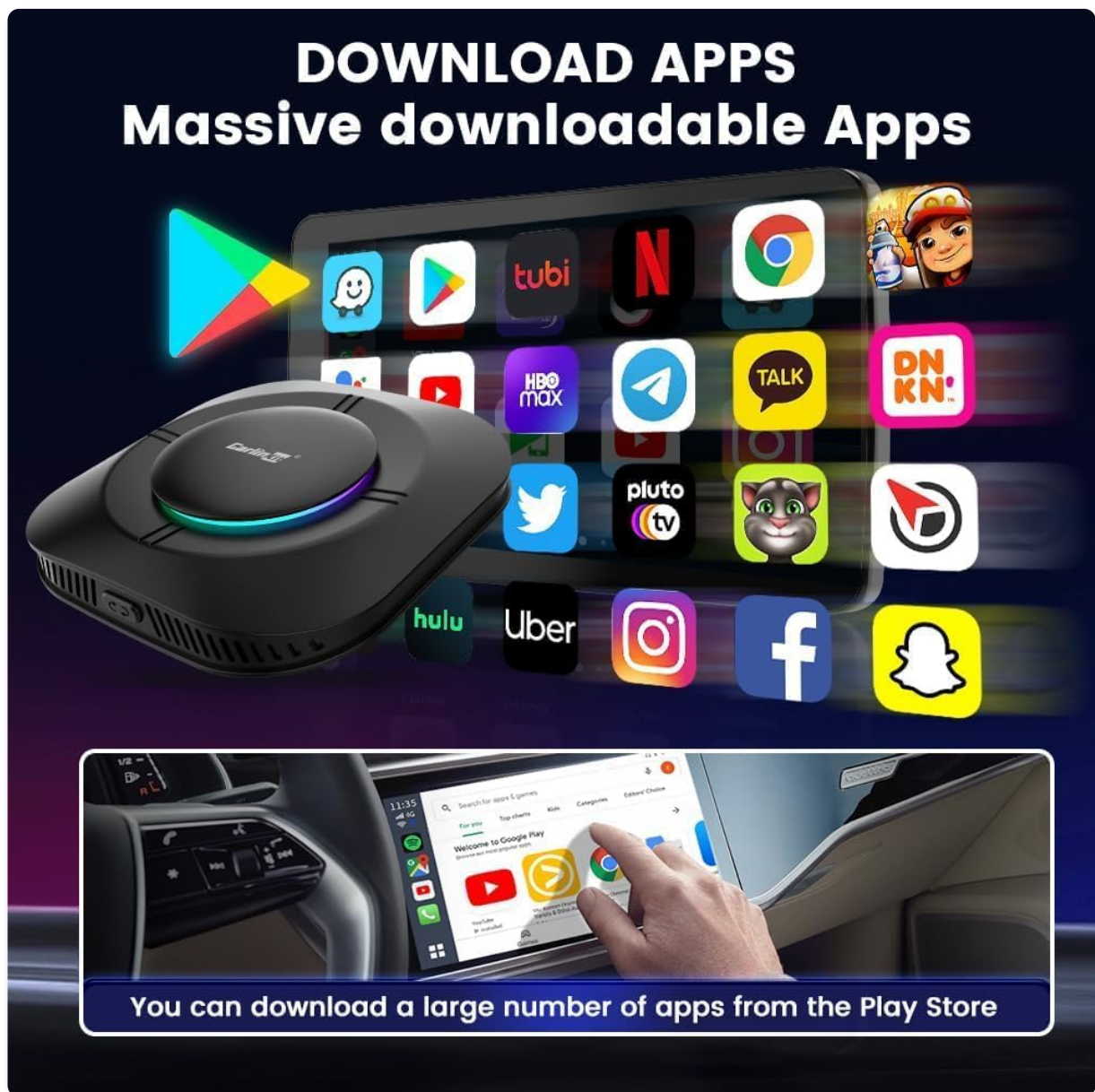
Figure 7: An image showing the Google Play Store interface on the car's screen, with various app icons surrounding the Carlinkit device, illustrating the ability to download massive apps.