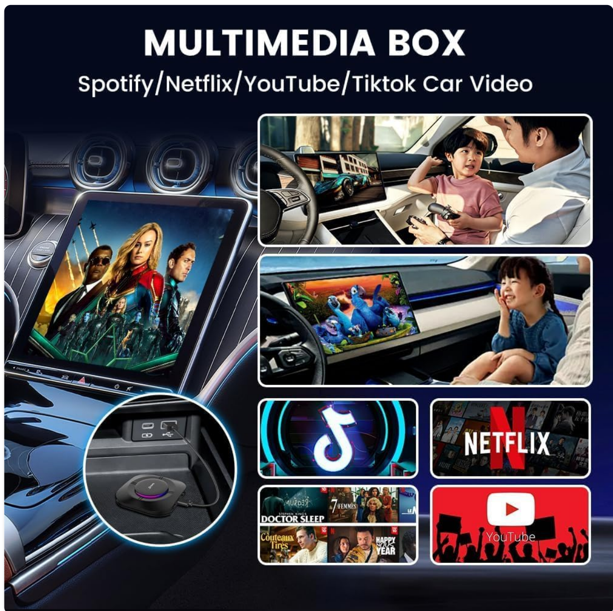
Figure 6: The multimedia box interface displaying icons for Spotify, Netflix, YouTube, and TikTok, indicating direct access to these streaming services.