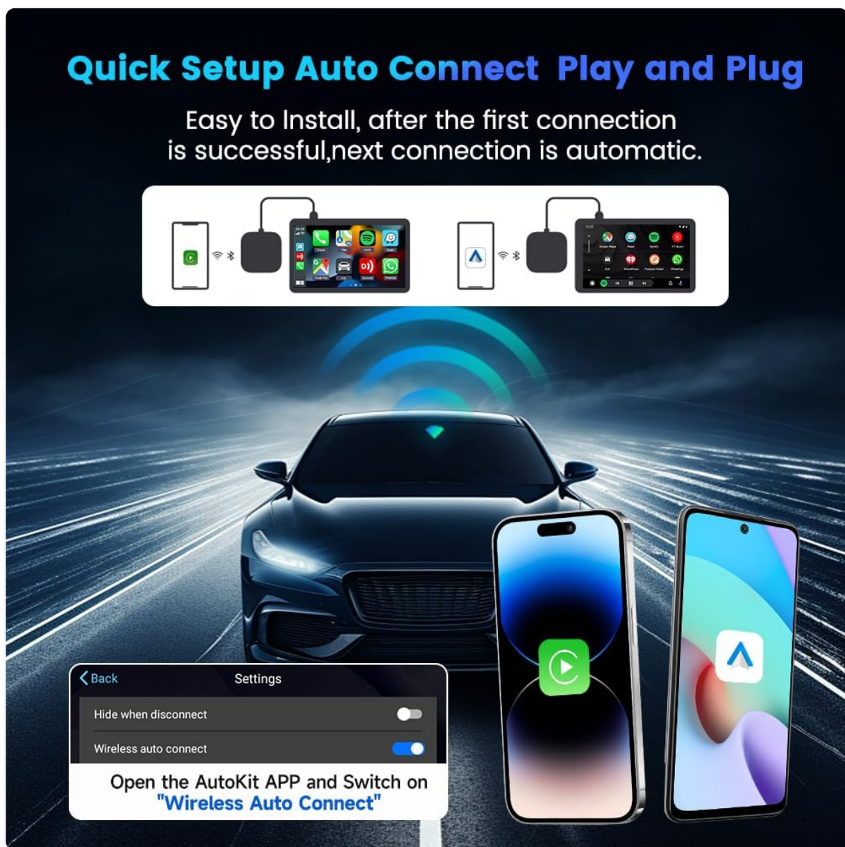
Figure 4: This image illustrates the simple plug-and-play setup process, showing the device connected to the car's USB port and the automatic connection to a smartphone.