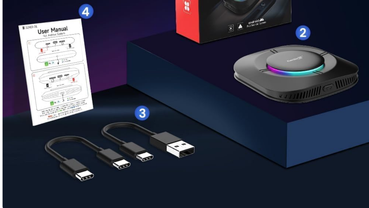
Figure 1: The image displays the Carlinkit CPC200-Tbox S2C device, two data cables (USB-A to USB-C and USB-C to USB-C), and the user manual, all neatly arranged within its retail packaging.