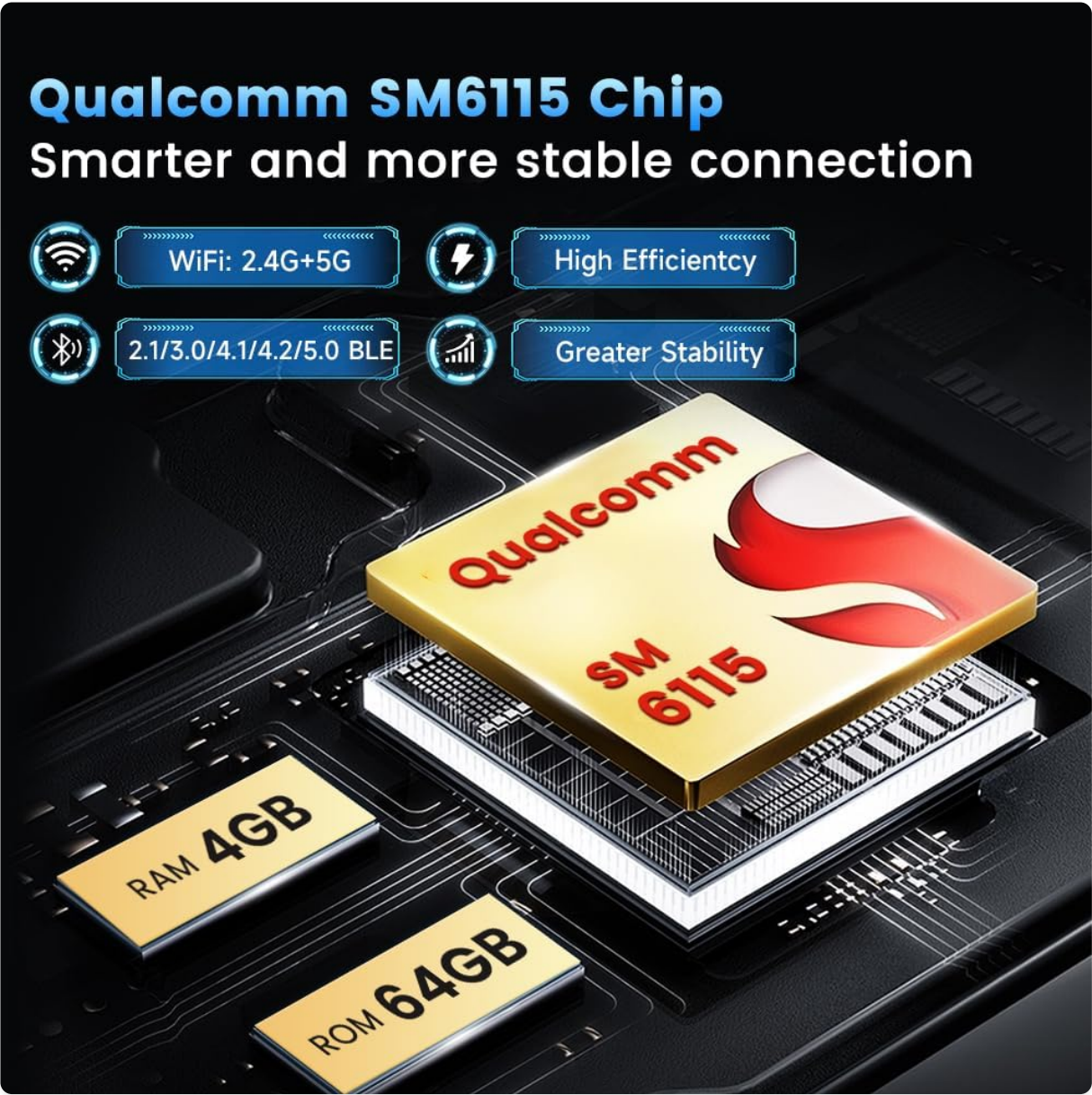
Figure 2: This image highlights the Qualcomm SM6115 chip, emphasizing its quad-core architecture, 4GB RAM, and 64GB ROM for stable and efficient performance.