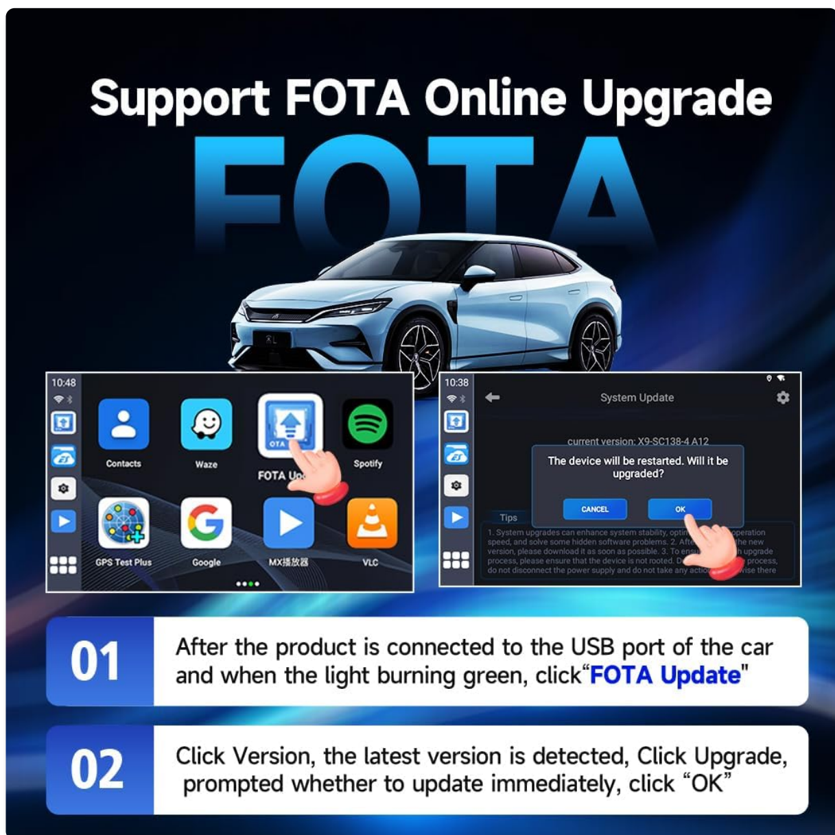
Figure 9: This image demonstrates the steps for performing a FOTA update, showing the update icon and the confirmation prompt on the screen.