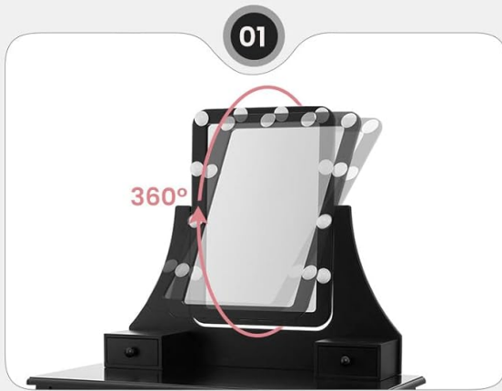
360° Rotatable Mirror