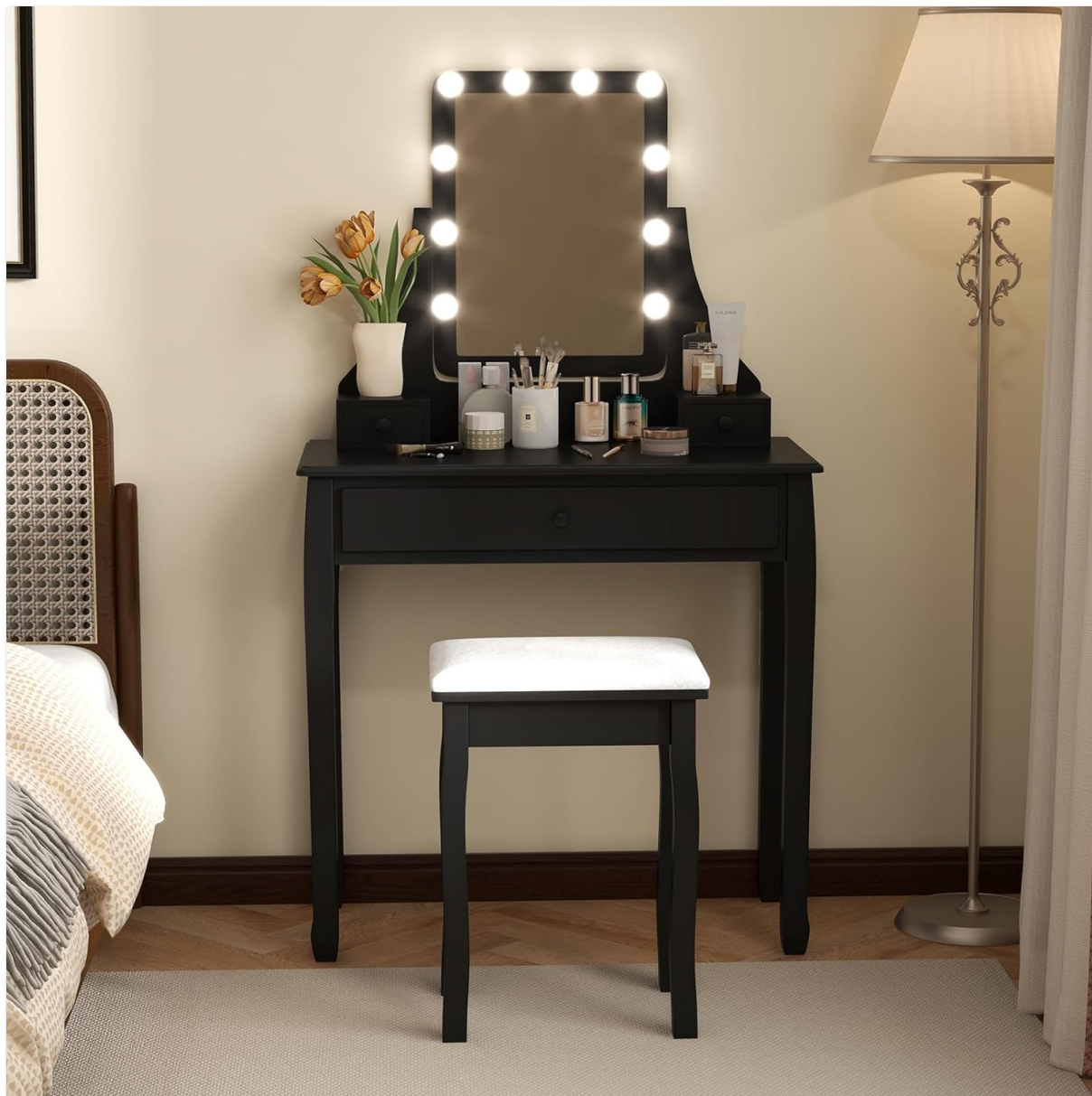
Image: Fully assembled COSTWAY Vanity Desk with Lights and stool.