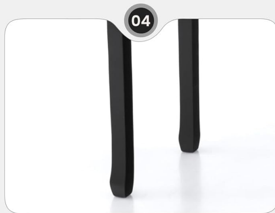
Solid Wood Legs

Image: Key features including the 360-degree rotatable mirror.