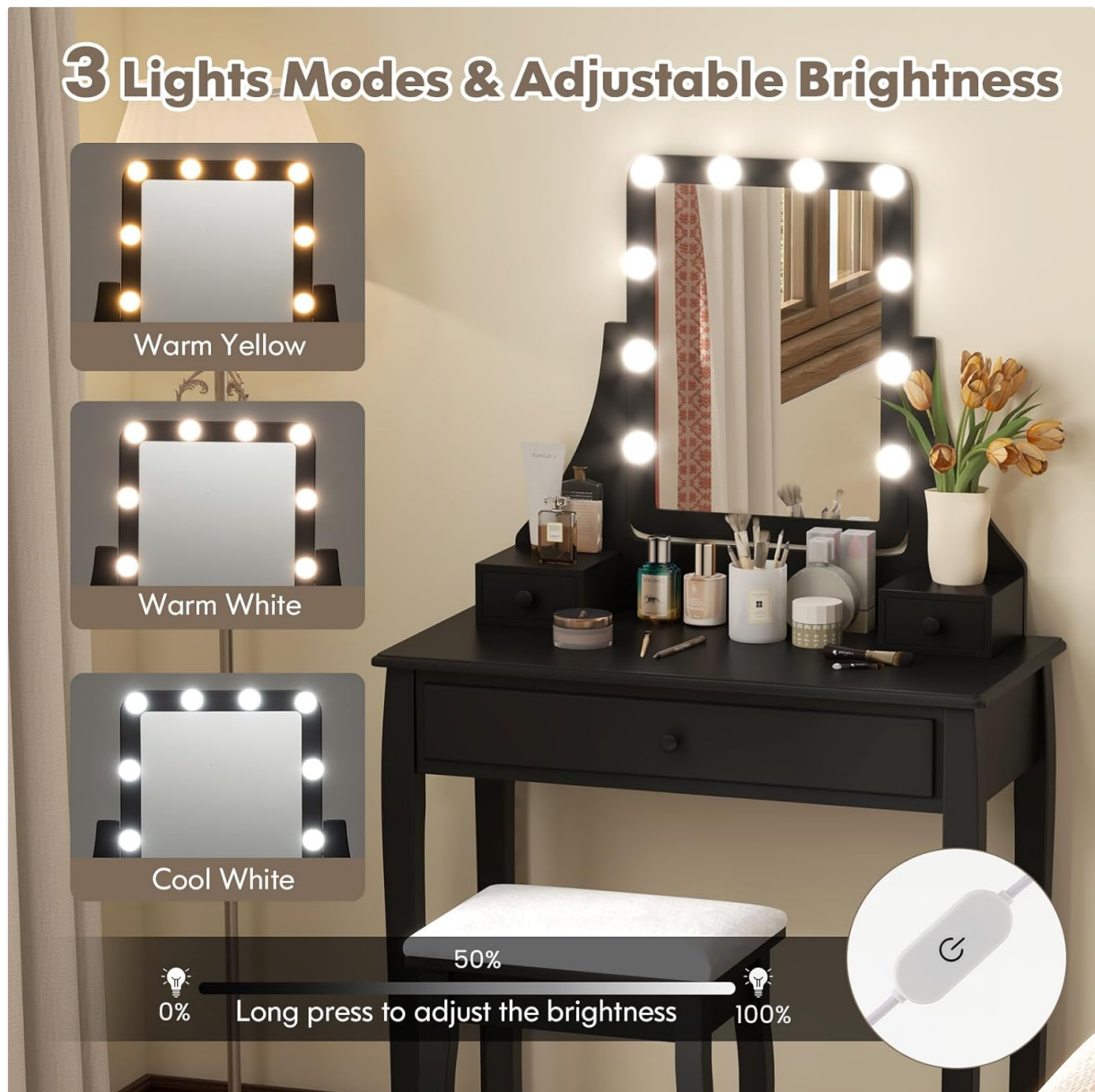
Image: LED mirror light modes and brightness control.