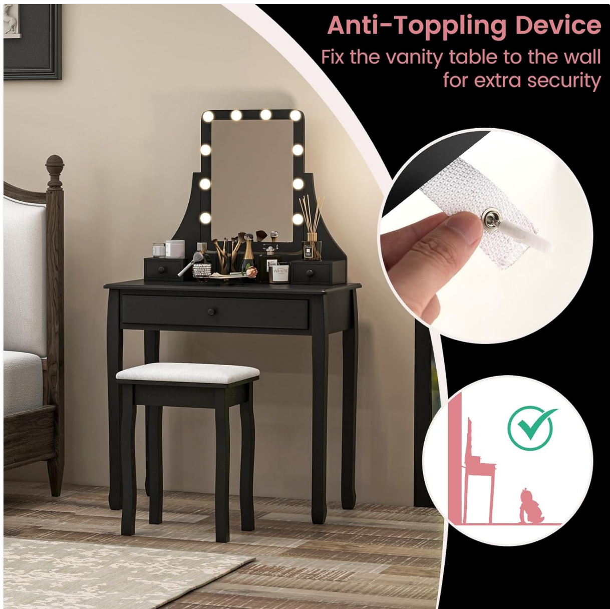
Image: Installation of the anti-tipping device to secure the vanity to the wall.