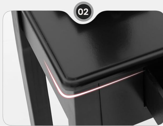
Anti-Collision Rounded Corner