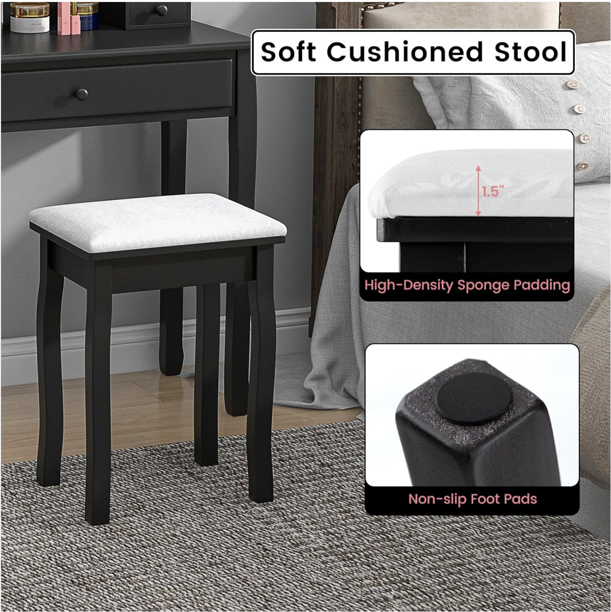
Image: Details of the cushioned stool, including padding and non-slip feet.