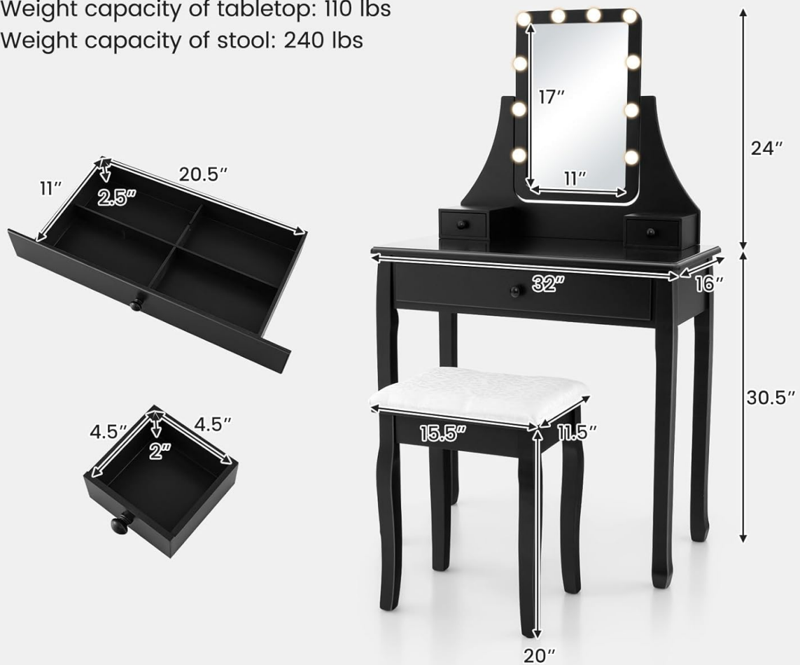
Image: Detailed product dimensions and weight capacities.