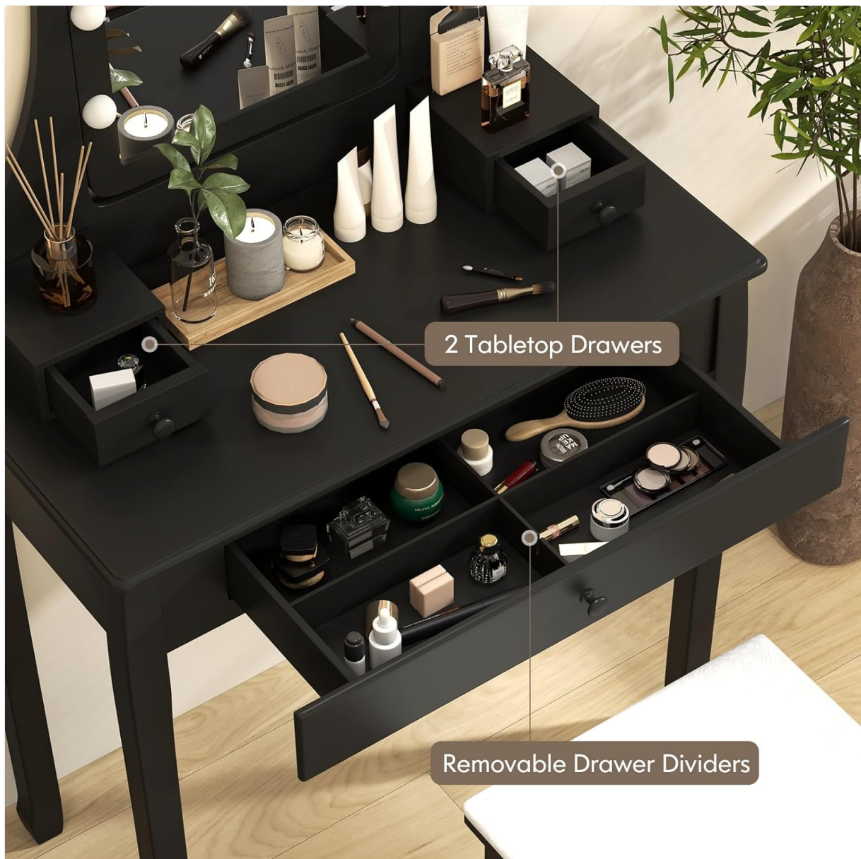
Image: Detail of the vanity desk's storage drawers, including removable dividers.