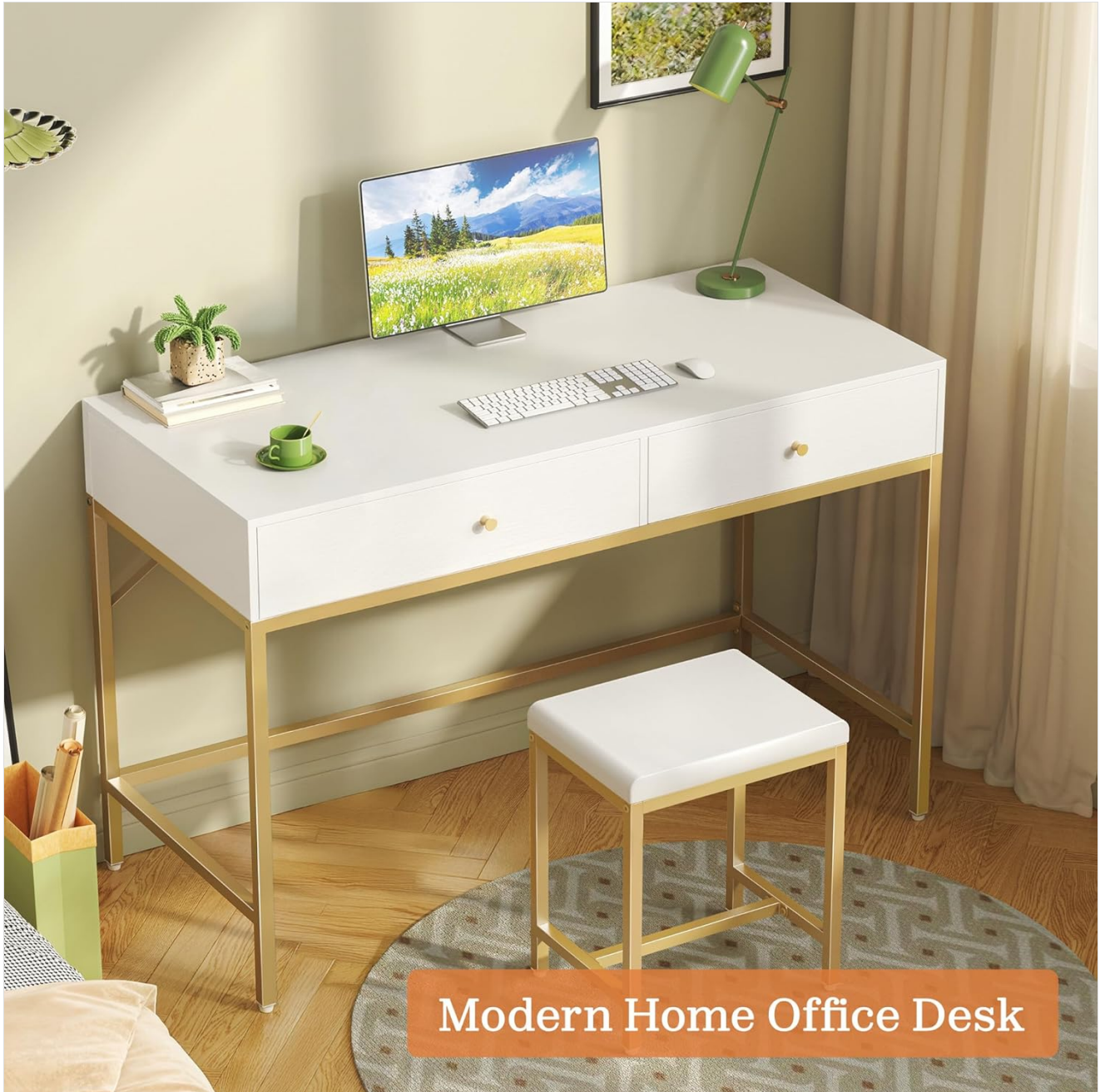
Image: The assembled desk configured as a modern home office desk, demonstrating its functional use.