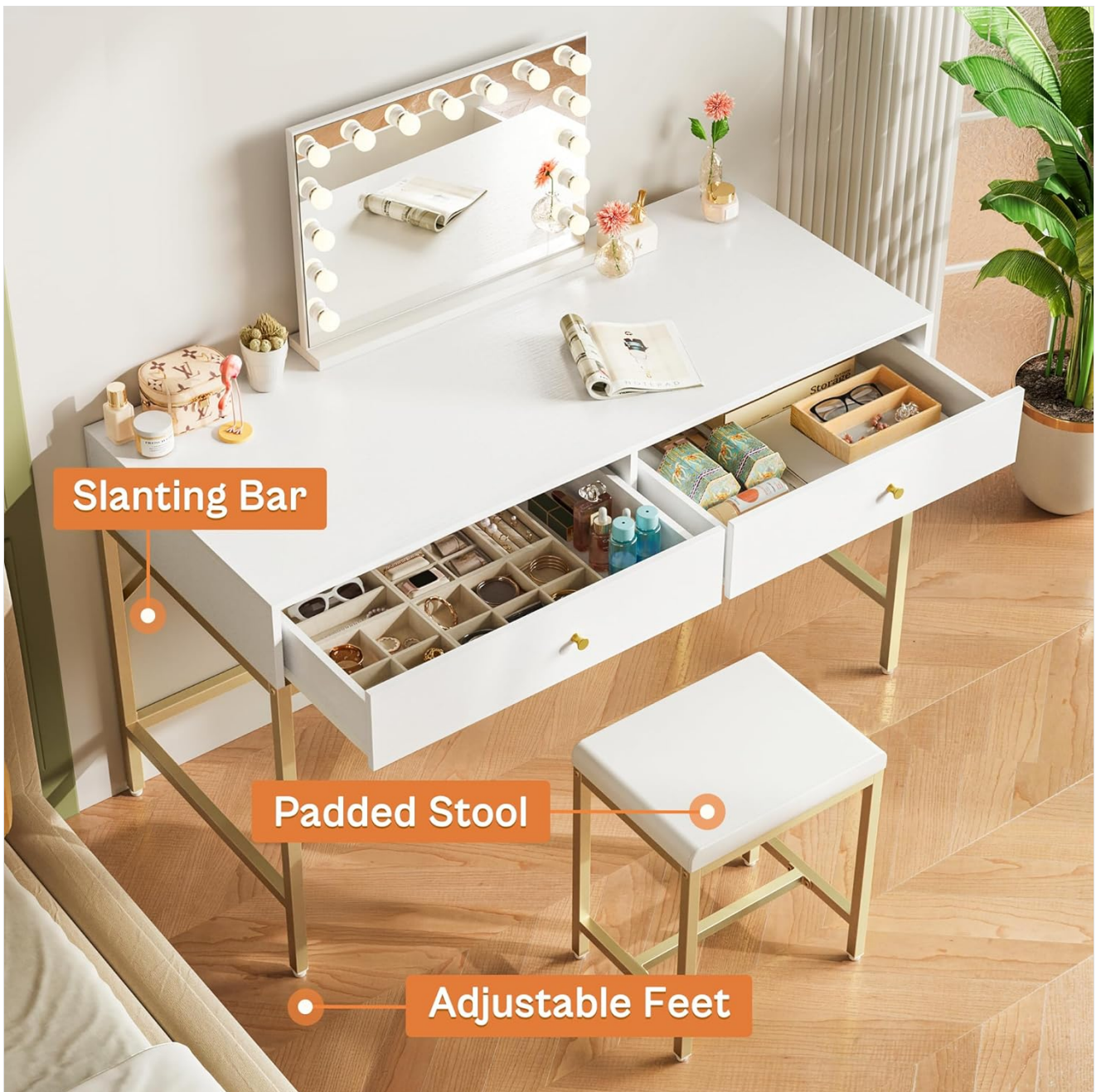
Image: The desk's drawers are open, revealing organized storage for various items like cosmetics, jewelry, and office supplies.