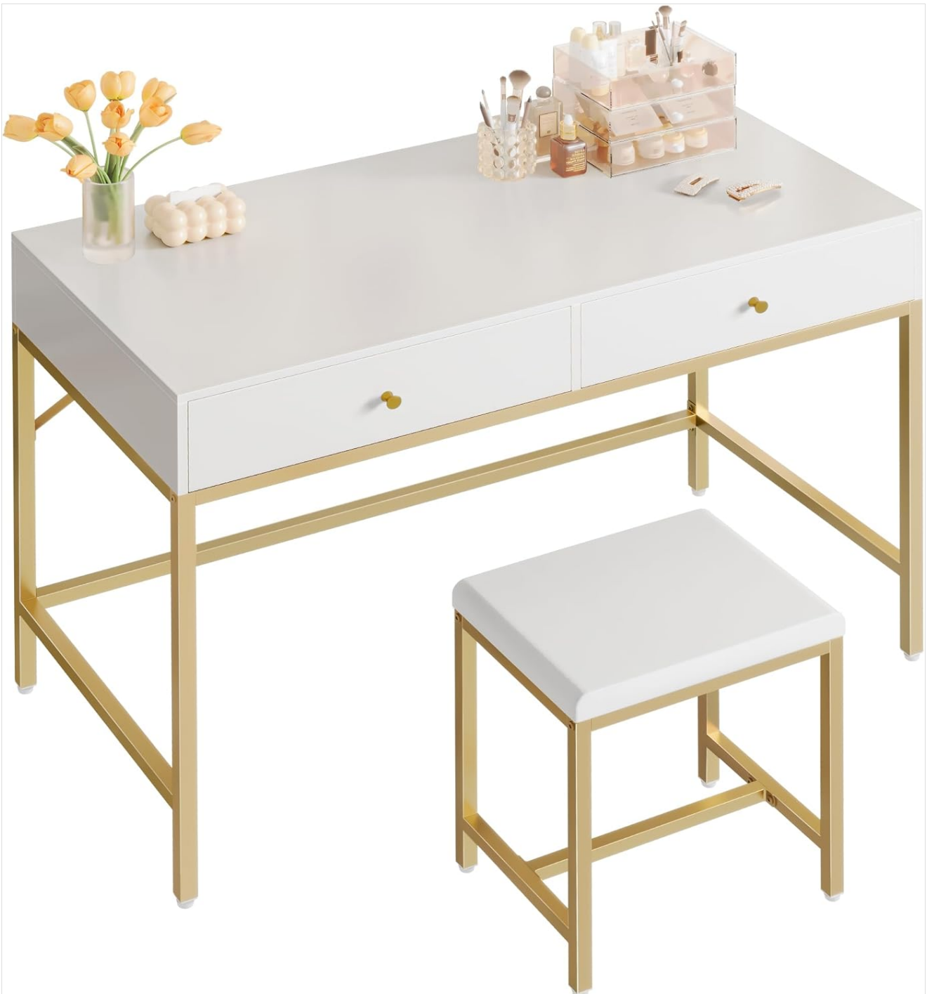
Image: The SUPERJARE 43.3-inch Modern White & Gold Desk with its accompanying padded stool, showcasing its elegant design and two drawers.