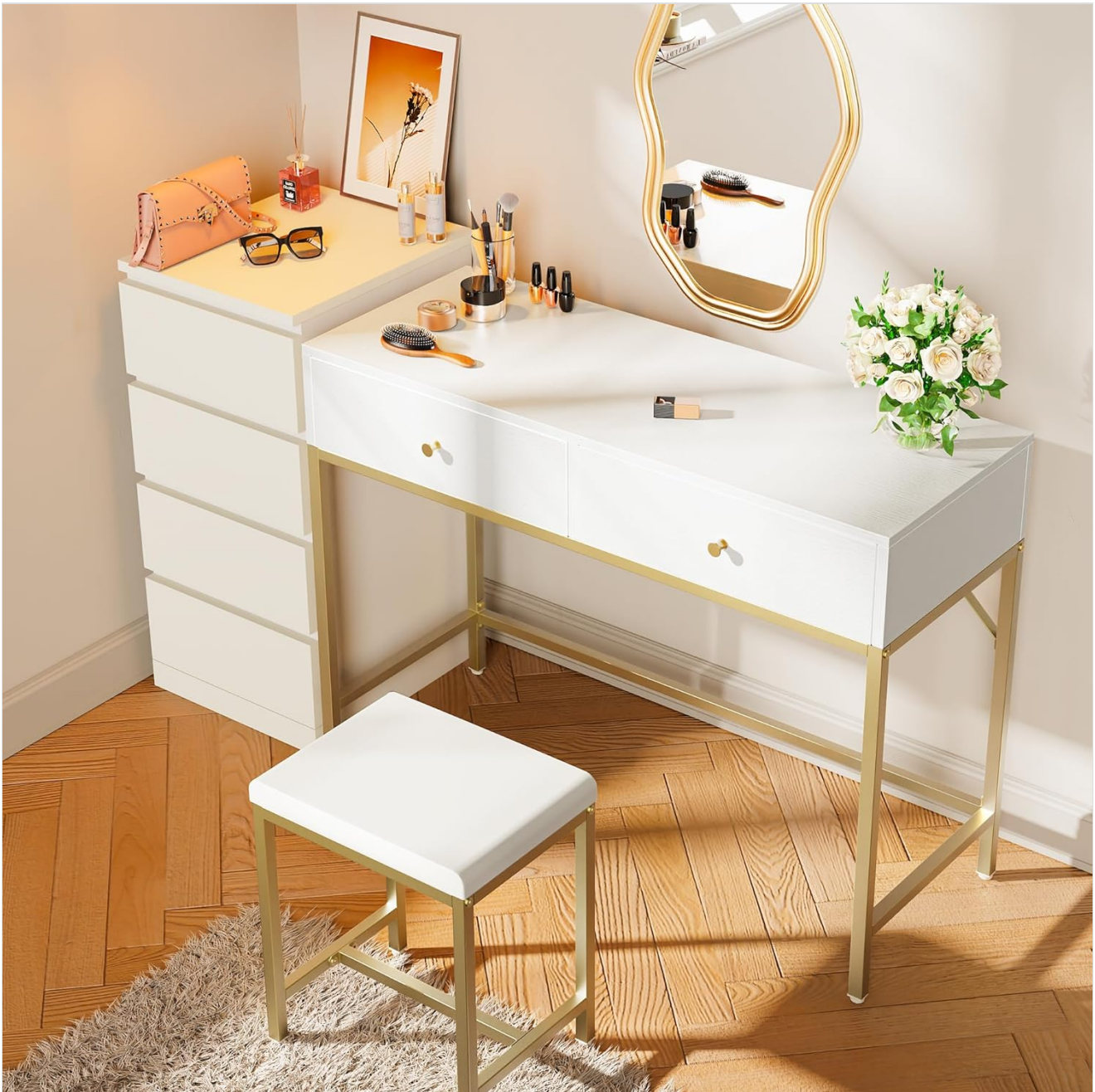
Image: An illustrative view of the desk and stool, highlighting key features like the slanting bar, padded stool, and adjustable feet.