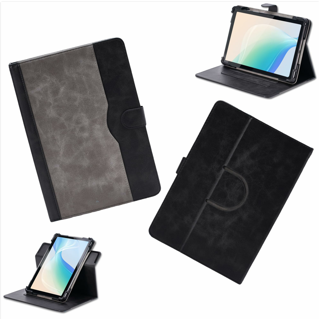
Image: The tablet case configured as a stand, highlighting the anti-slip stripe that secures the tablet for hands-free viewing.