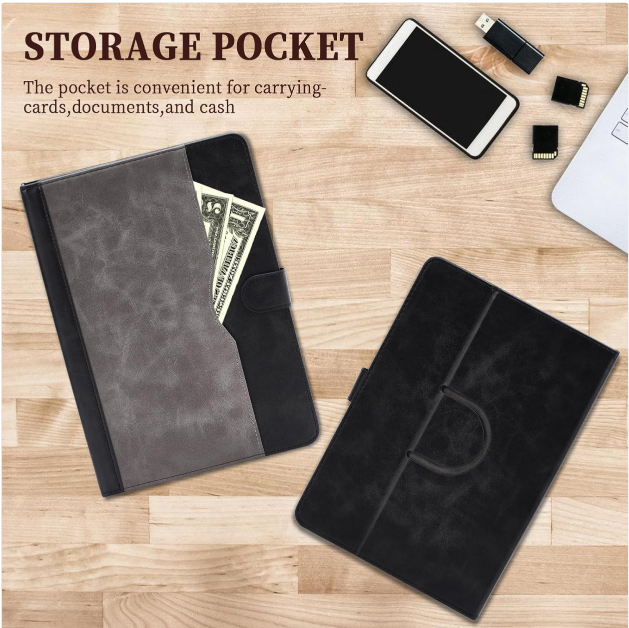
Image: An overhead view of the case's interior, showcasing the integrated storage pocket with cards and cash placed inside.

The pocket is convenient for carrying cards, documents, and cash