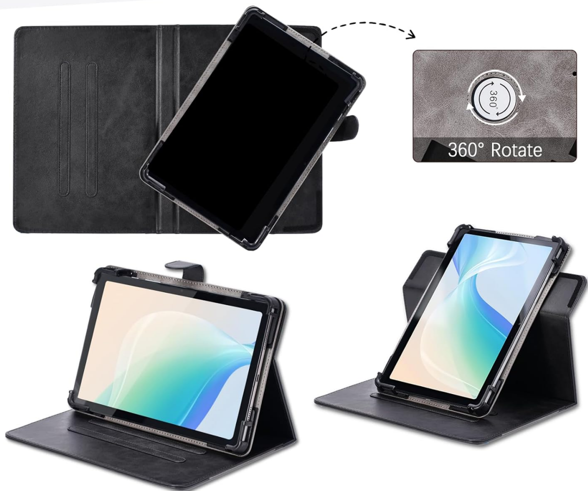
Image: Illustrations demonstrating the 360-degree rotation capability and various adjustable viewing angles provided by the case's stand function.

Supports multiple viewing angles with 360° free rotate