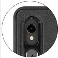
Raised Edges for Extra Protection