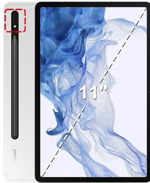
Galaxy Tab S8/S7 11" 2022/2020 (SM-X700/X706/T870/T875/T878)

Image: Compatibility chart showing supported Samsung Galaxy Tab models and their dimensions.