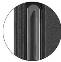
Stylus Pen Holder