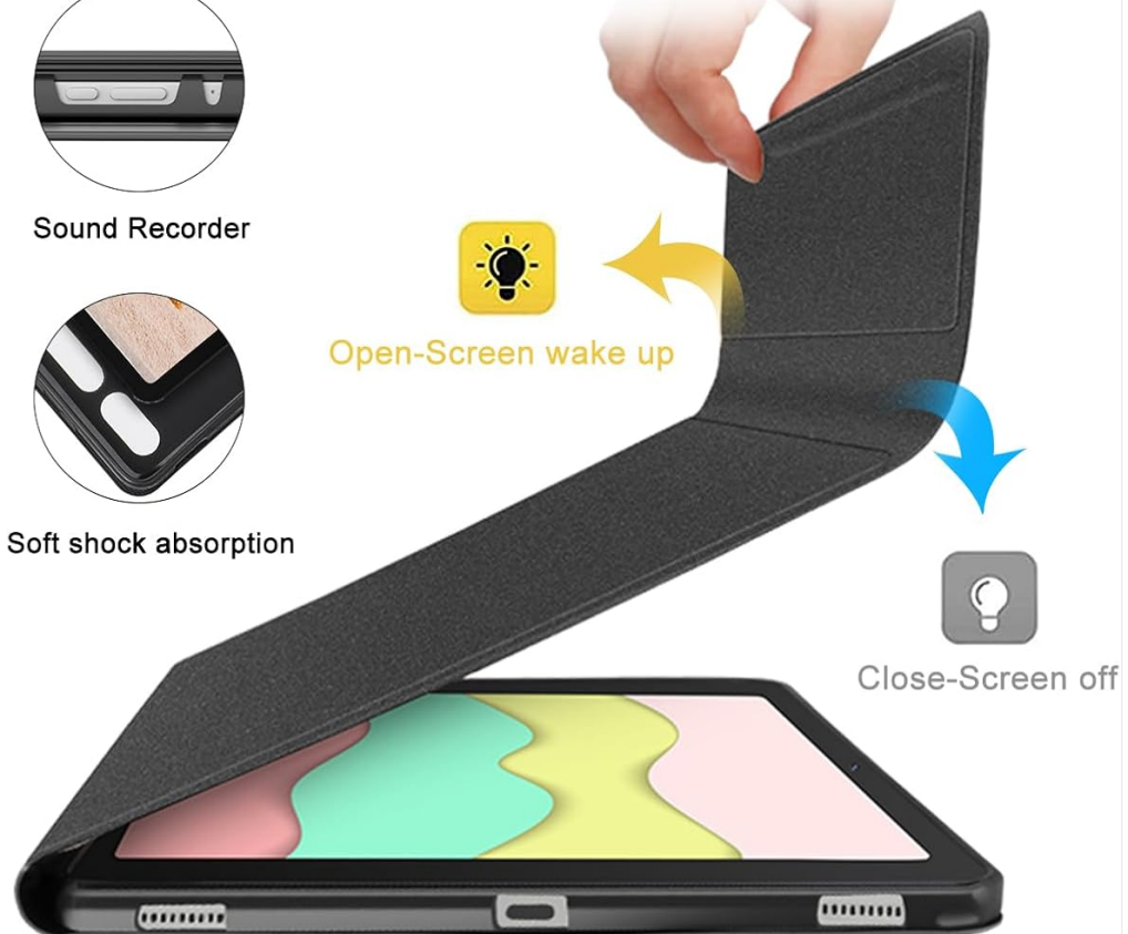
Image: Visual representation of the case's auto sleep/wake feature, showing the screen waking up when opened and turning off when closed.