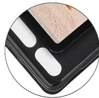
Soft shock absorption