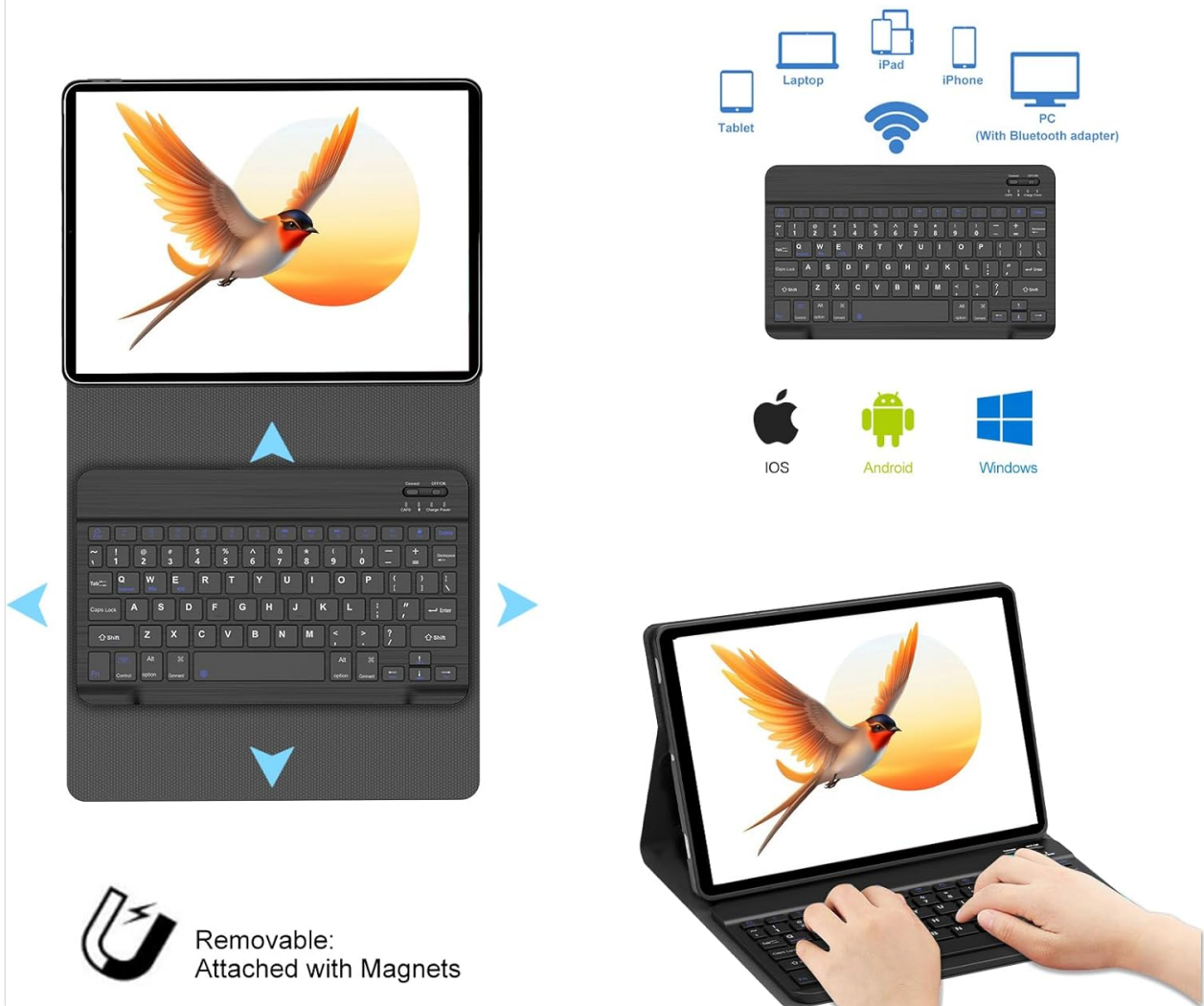
Image: Illustration of the detachable wireless keyboard and its magnetic attachment to the case, along with icons indicating multi-device compatibility.

Magnetically Integrated-Waterproof Keyboard-Multiple Compatible