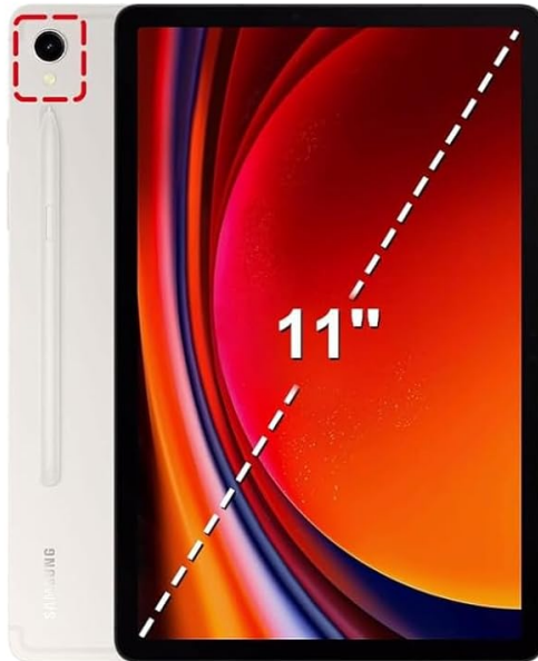
Galaxy Tab S9 11" 2023 (SM-X710/X716B/X718U)

Samsung Galaxy Tab S9 11Inch 2023 Release (Model SM-X710/X716B/X718U/X700/X706/ T870/T875/T878)