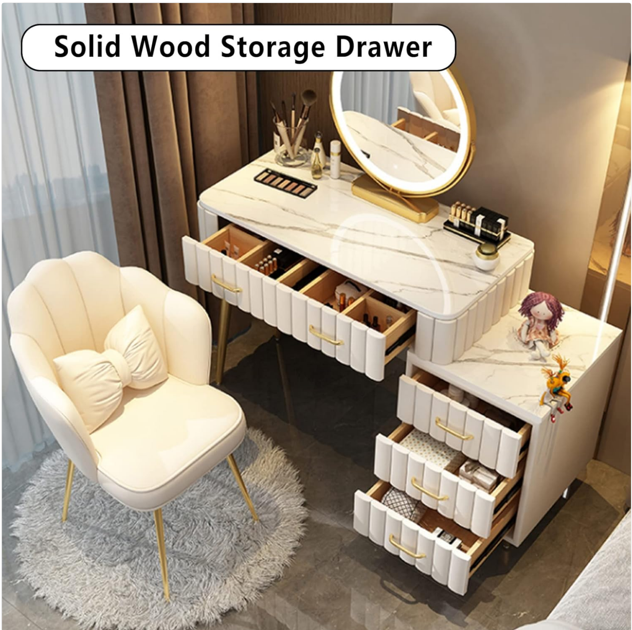
Image: The vanity desk with multiple drawers open, showcasing internal storage compartments.