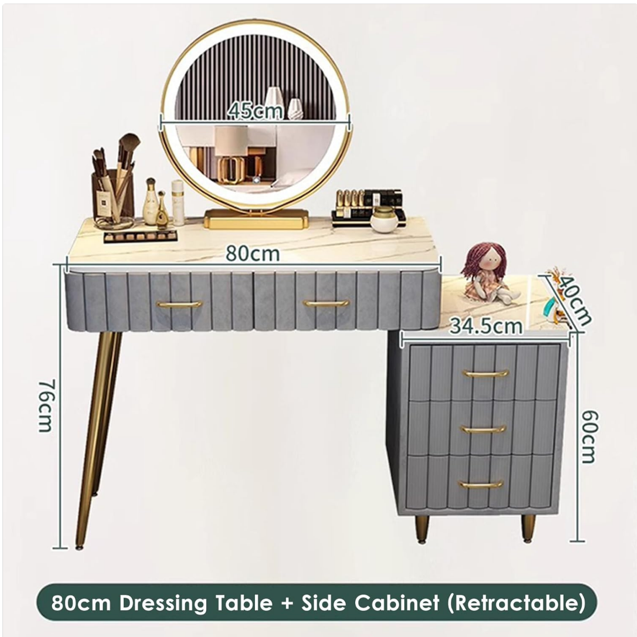
Image: Diagram showing the dimensions of the 80cm Baodiale Makeup Vanity Desk and side cabinet.