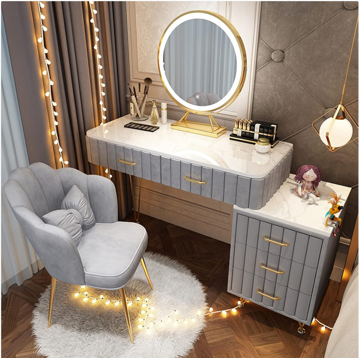
Image: Fully assembled Baodiale Makeup Vanity Desk in a bedroom setting.