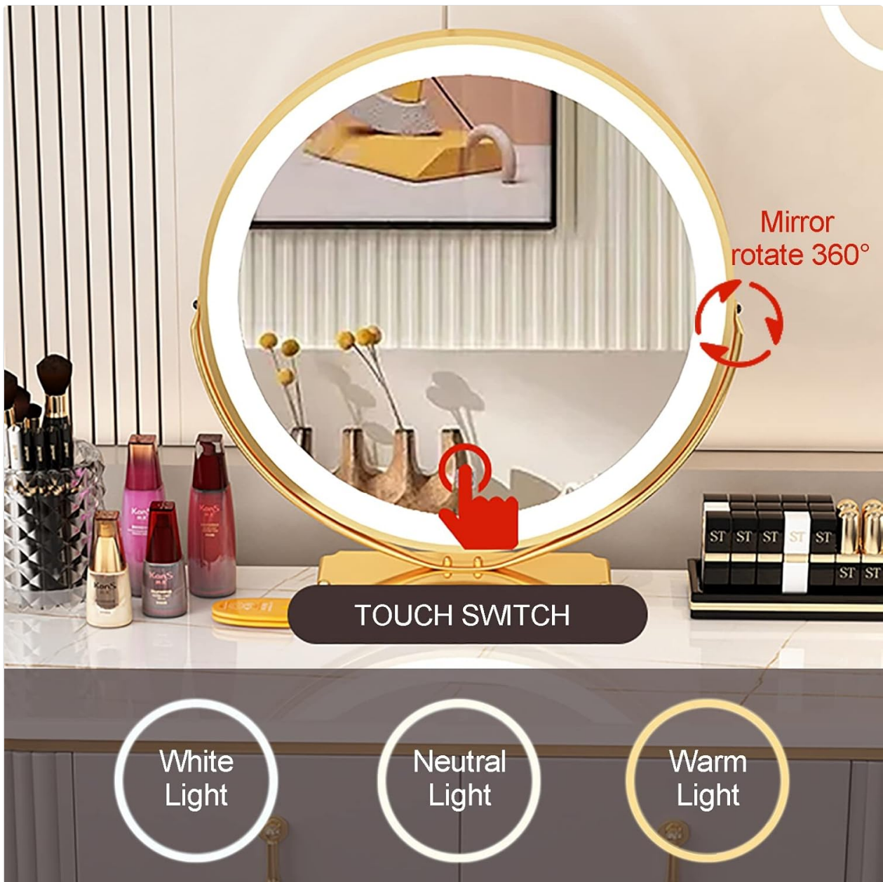
Image: Close-up of the mirror's touch switch and indicators for White, Neutral, and Warm light modes.