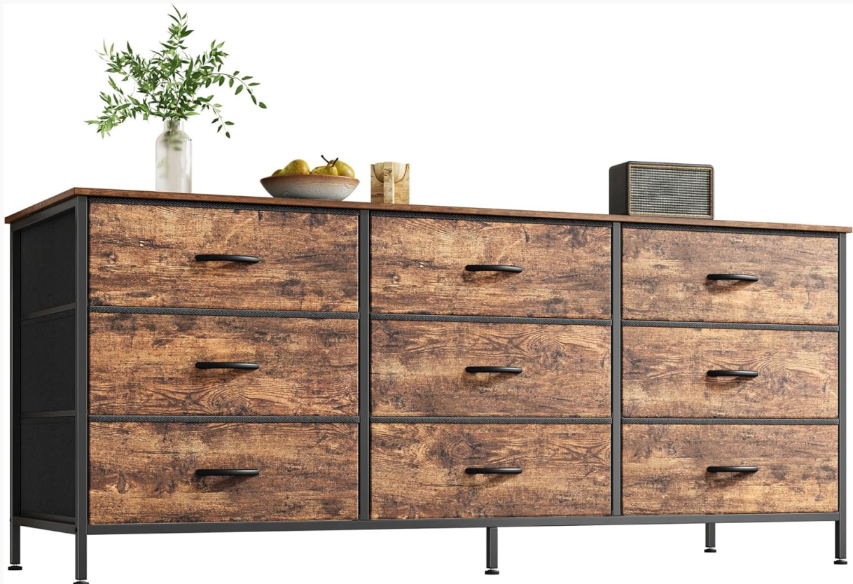
Image 1.1: The Huuger 9-Drawer Dresser in Rustic Brown. This image displays the dresser's overall appearance with its

Thank you for choosing the Huuger 9-Drawer Dresser. This versatile furniture piece is designed to provide ample storage and can also serve as a TV stand for screens up to 60 inches. Constructed with a durable metal frame, a robust wooden top, and fabric drawers, it offers a blend of functionality and style. This manual provides essential information for assembly, usage, maintenance, and safety to ensure optimal performance and longevity of your product.