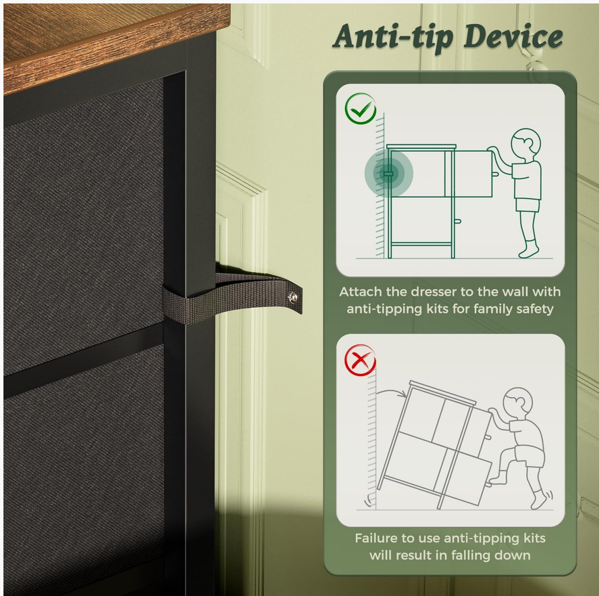
Image 2.1: A diagram illustrating the correct installation of the anti-tip device to secure the dresser to a wall, emphasizing safety.