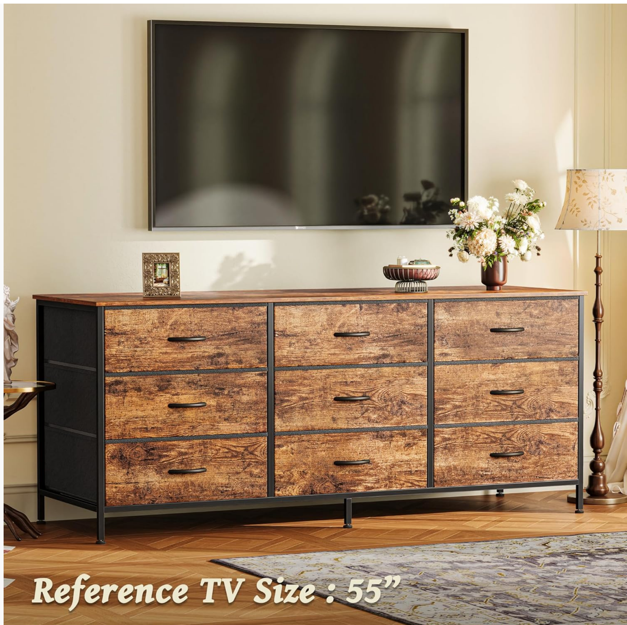
Image 5.2: The dresser functioning as a TV stand in a living room setting, with a 55-inch television placed on top.