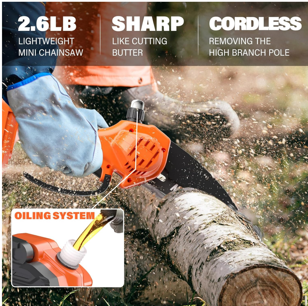
Image: Close-up of the mini chainsaw highlighting the oiling system, showing oil being poured into the transparent tank for clear view of oil level.