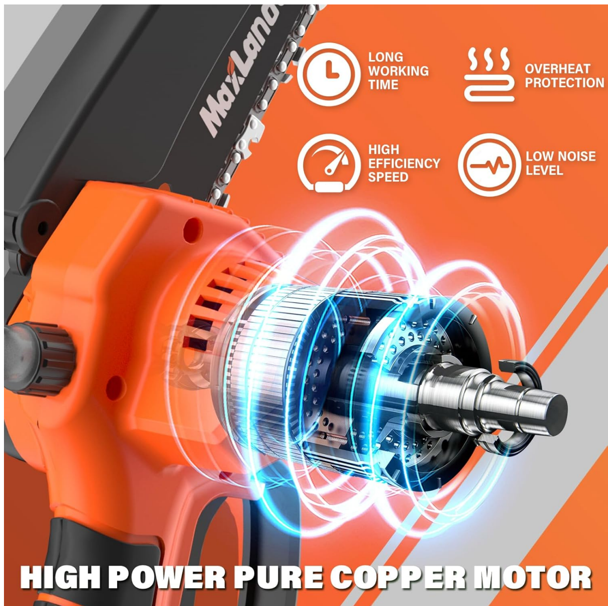
Image: Close-up view of the high-power pure copper motor, highlighting its internal components and features like long working time, overheat protection, high efficiency speed, and low noise level.