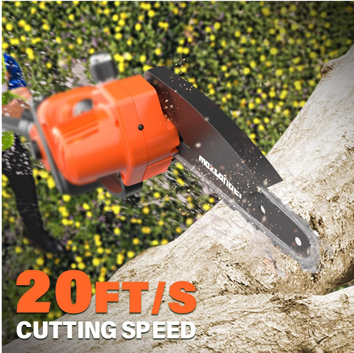
Image: The pole saw in operation, demonstrating its 20ft/s cutting speed on a tree branch.