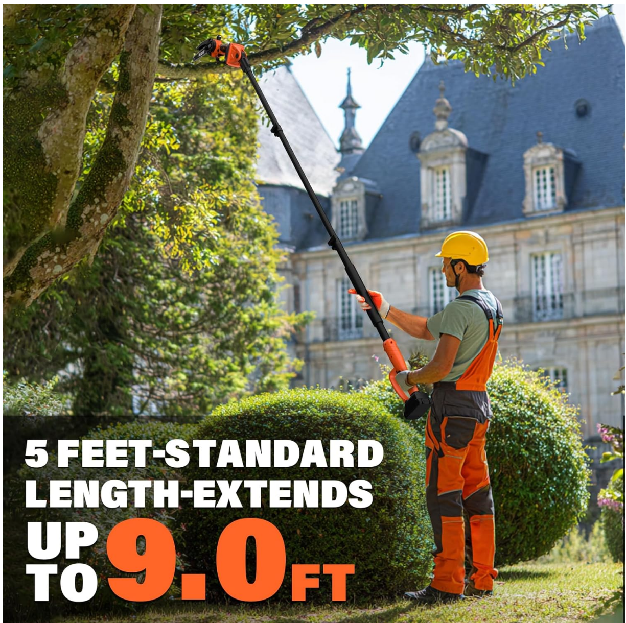
Image: A person using the MAXLANDER pole saw, extended to reach high branches for tree trimming, illustrating its 5 to 9 feet extension capability.