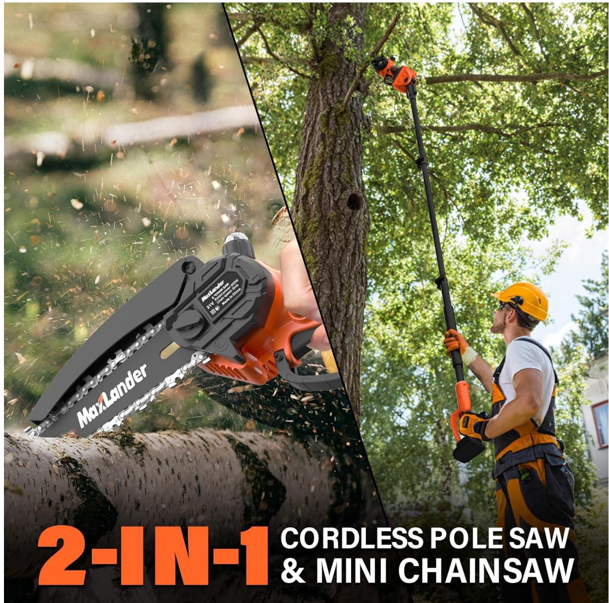
Image: Overview of the MAXLANDER 2-in-1 Cordless Pole Saw and Mini Chainsaw, showing both configurations.