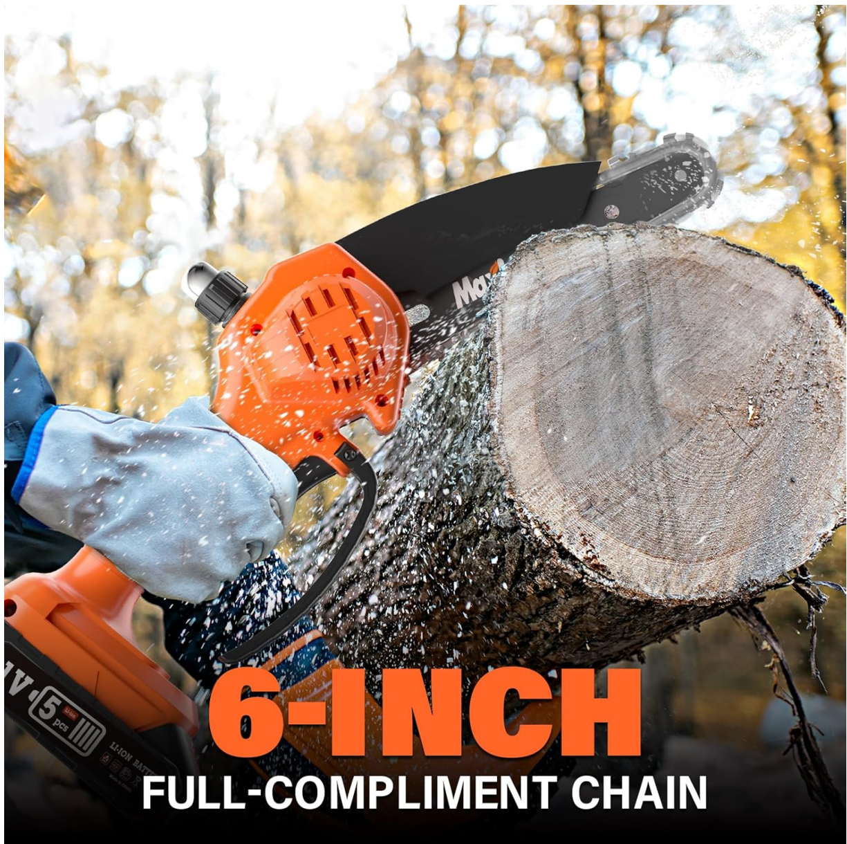
Image: The 6-inch mini chainsaw in action, demonstrating its cutting capability on a log.