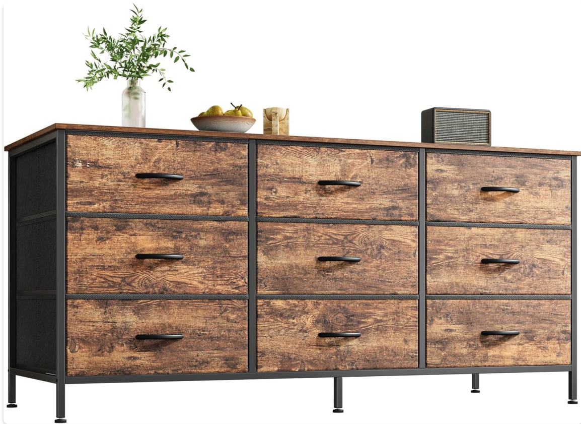
Image 1.1: The Huuger 9 Drawer Dresser in Rustic Brown, showcasing its design and nine spacious drawers.