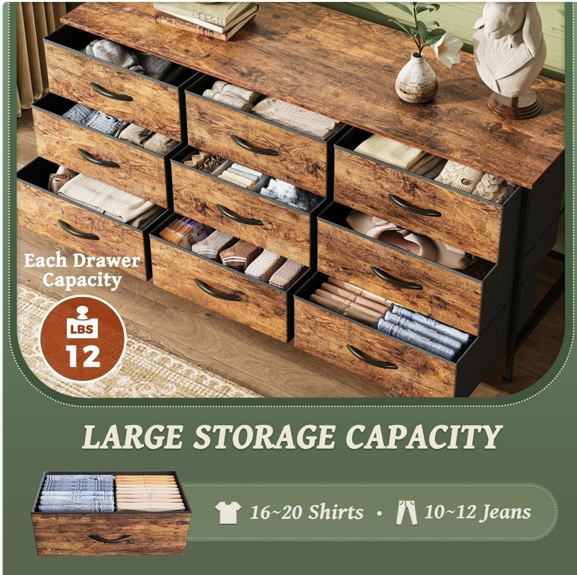
Image 5.1: The dresser with multiple drawers open, demonstrating its large storage capacity for various items.