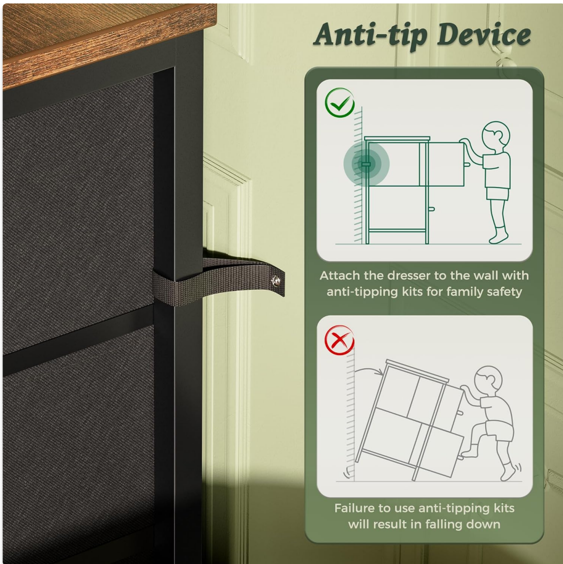
Image 2.1: Diagram illustrating the correct method for attaching the anti-tipping kit to the wall for enhanced safety.