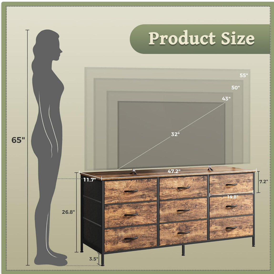
Image 8.1: Detailed product dimensions, including overall height, width, depth, and individual drawer measurements.