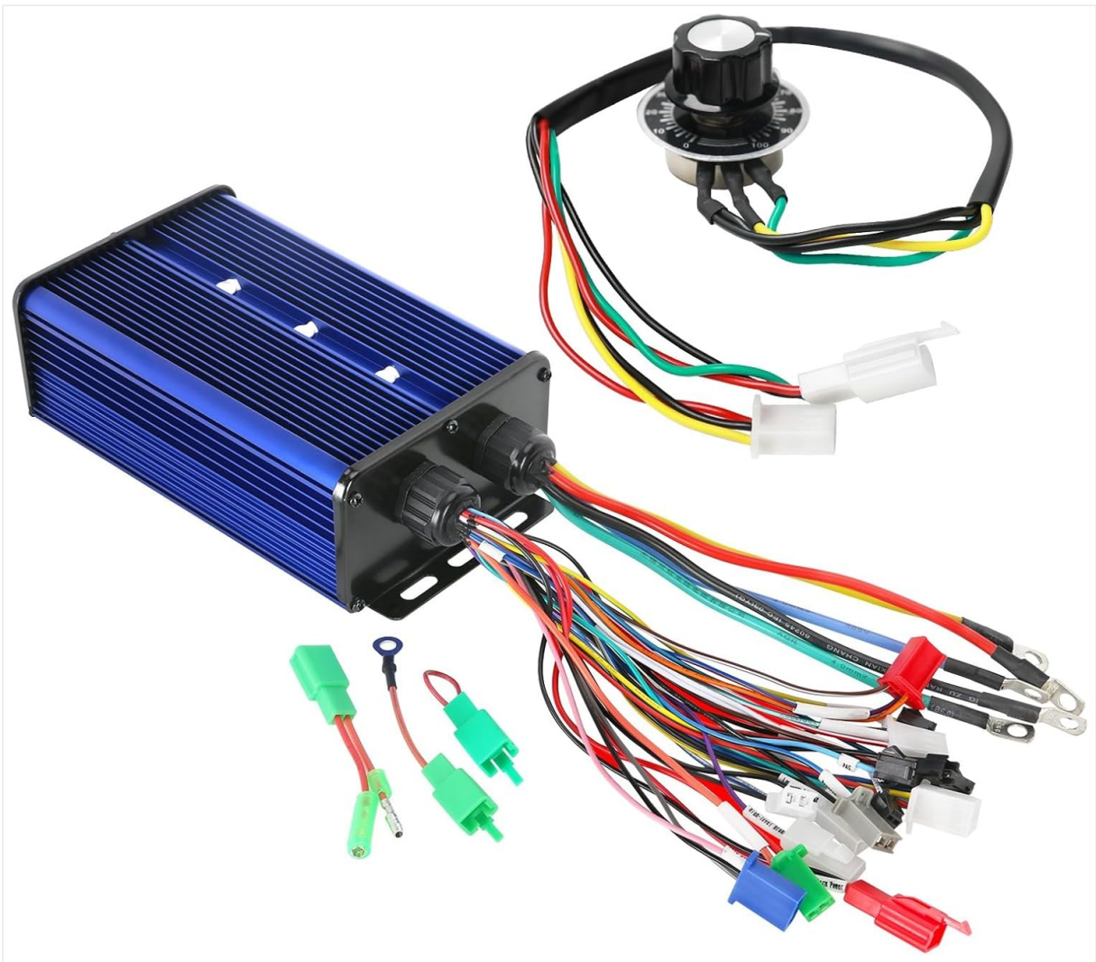
Image 2.1: The YC Yier Brushless Motor Controller and accompanying speed control knob.