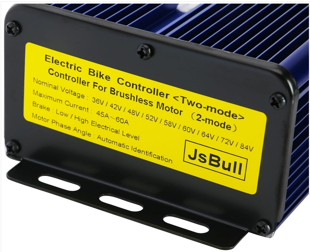
Image 3.2: Close-up view of the controller's label, displaying nominal voltage, maximum current, brake type, and motor phase angle information.

The label on the controller provides essential technical specifications such as nominal voltage range (36V/42V/48V/52V/58V/60V/64V/72V/84V), maximum current (45A-60A), brake type (Low/High Electrical Level), and motor phase angle (Automatic Identification).