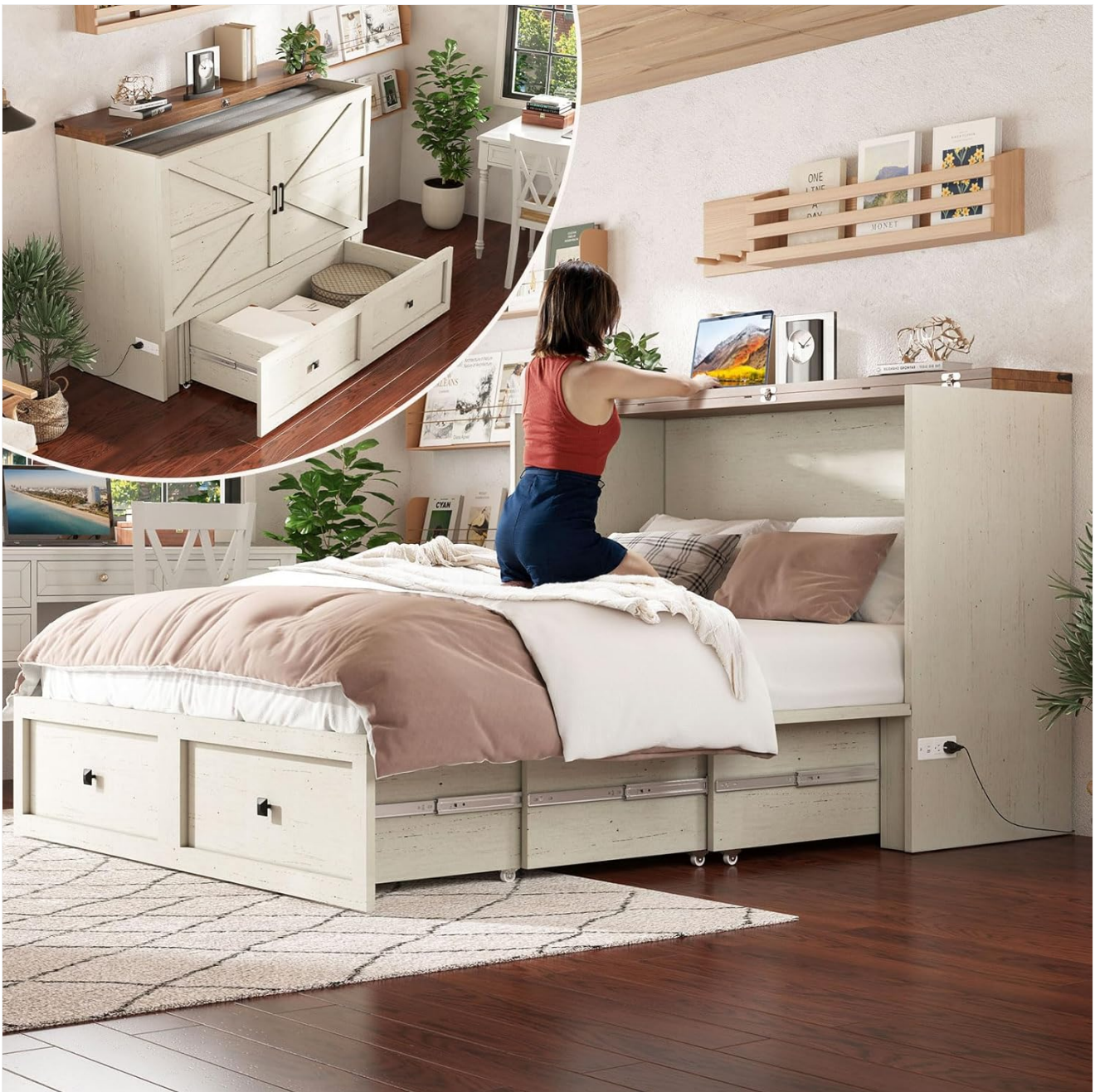
Figure 4: The Murphy bed in cabinet mode, highlighting the spacious bottom drawer for storage.