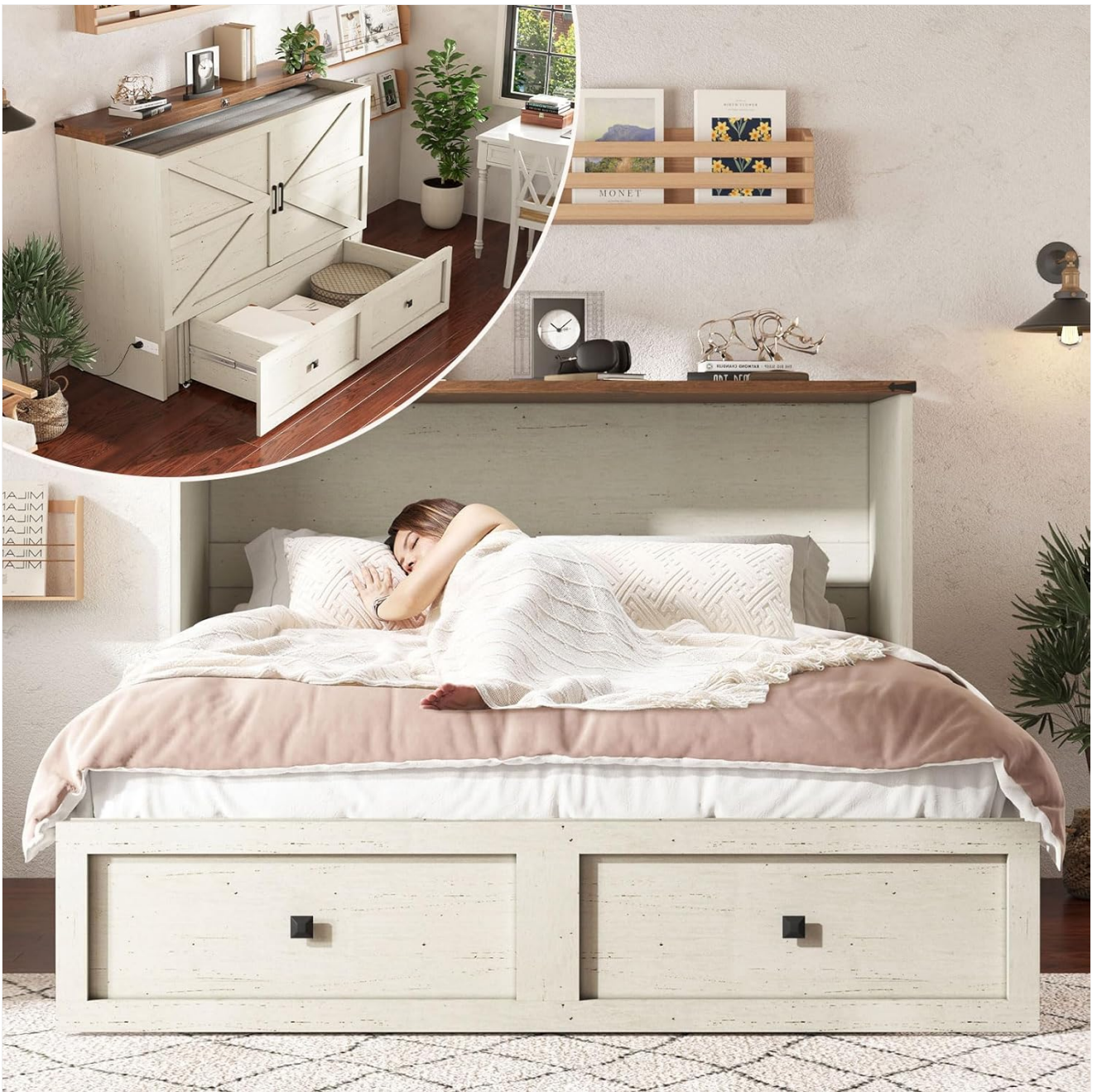
Figure 1: The AMERLIFE Queen Murphy Bed showcasing its dual functionality as a cabinet and a bed.