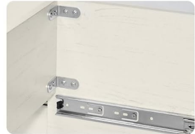
Figure 5: Step-by-step visual guide for converting the Murphy bed.