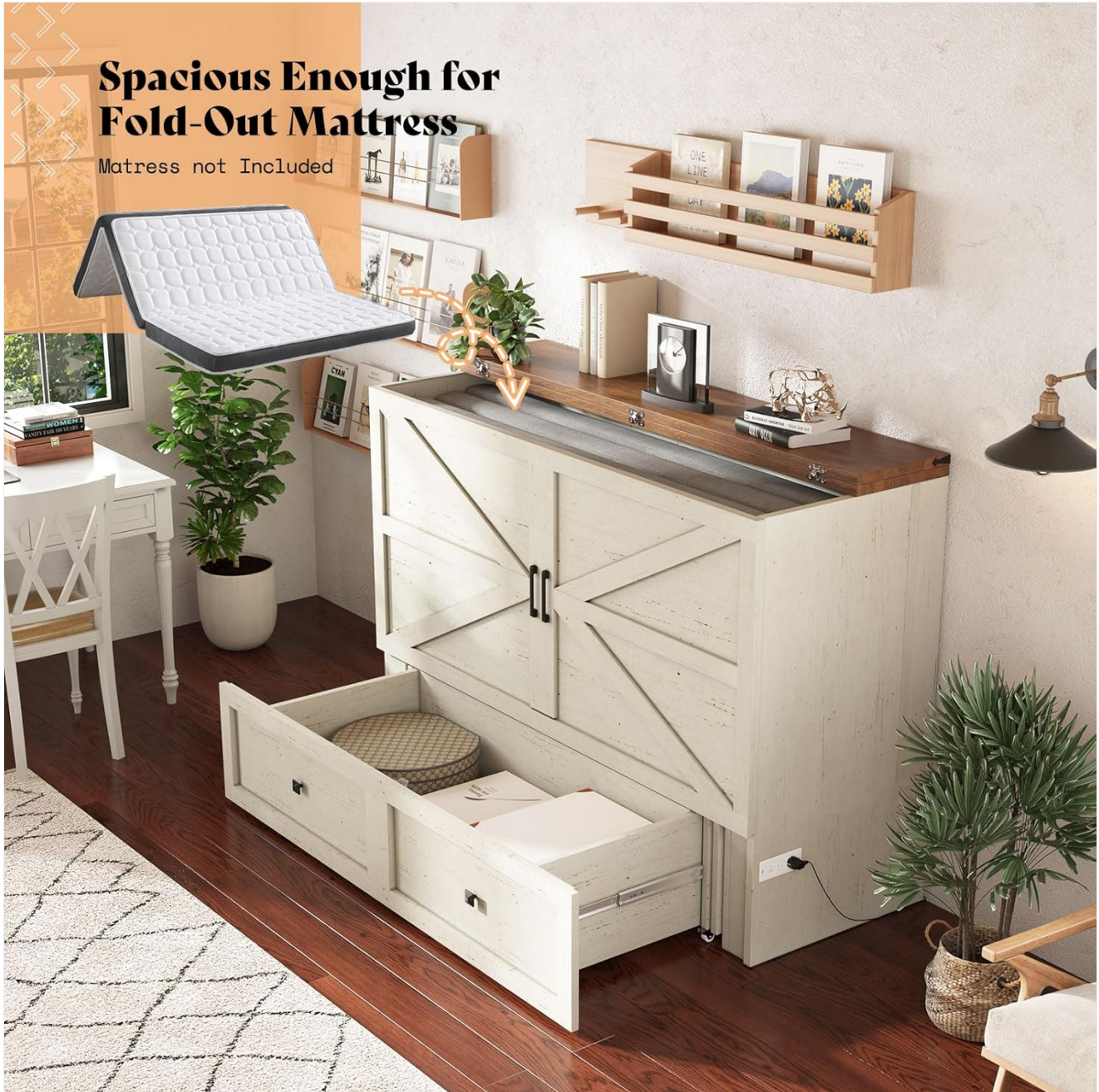
Figure 7: The Murphy bed in use, highlighting the charging station and functional top surface.

The integrated charging station is located on the side of the cabinet. Simply plug the bed's power cord into a wall outlet. You can then use the 2 AC outlets, 1 USB port, and 1 Type-C port to charge your devices.