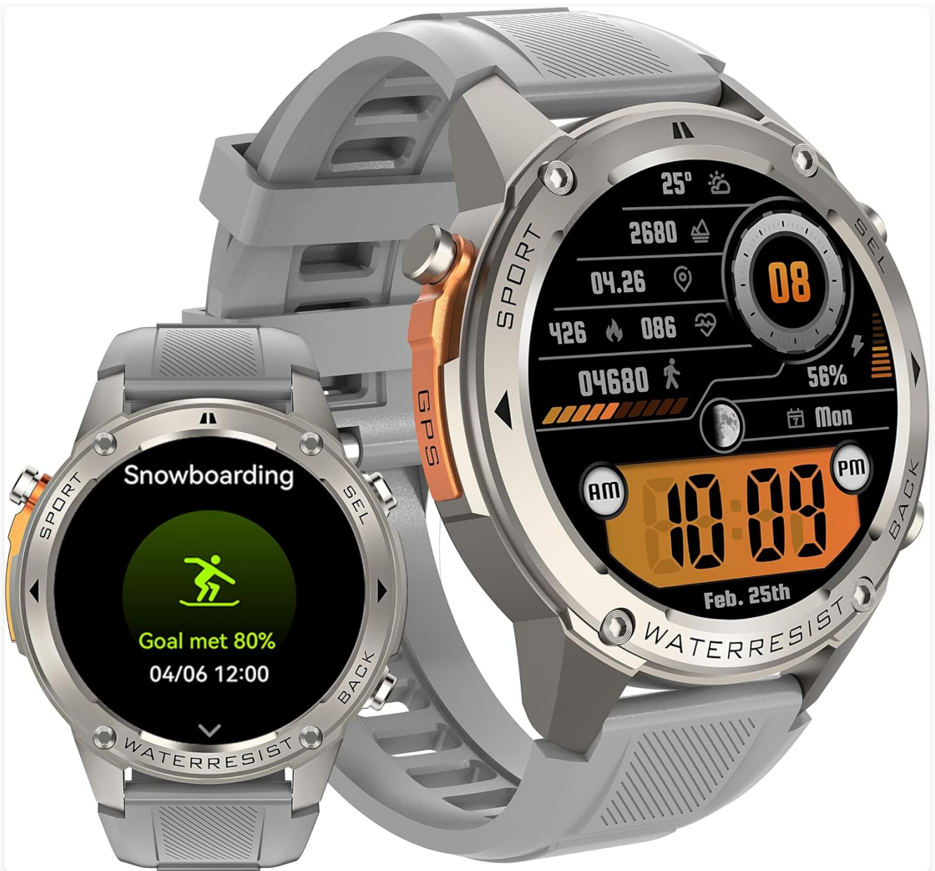
Figure 1: MIDDOW Military Smart Watch (Silver)