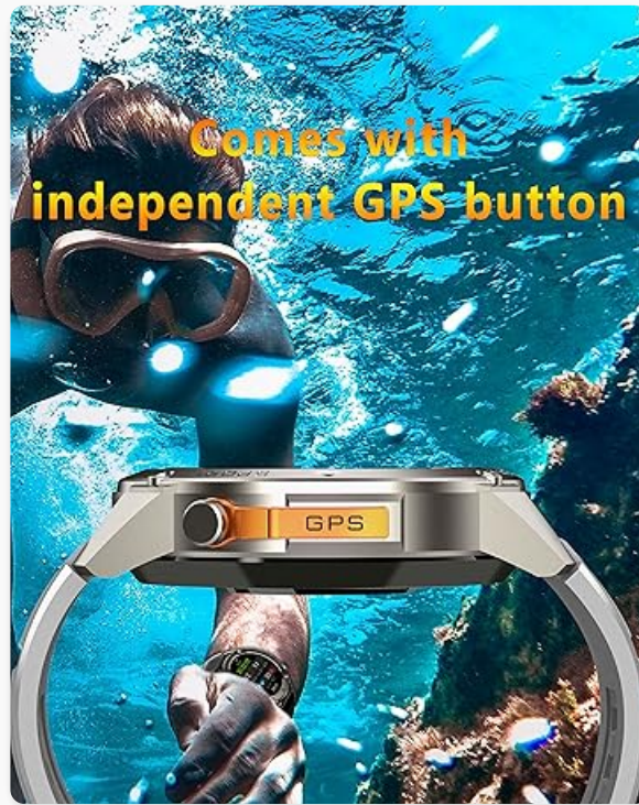
Figure 5: Water Resistance Feature