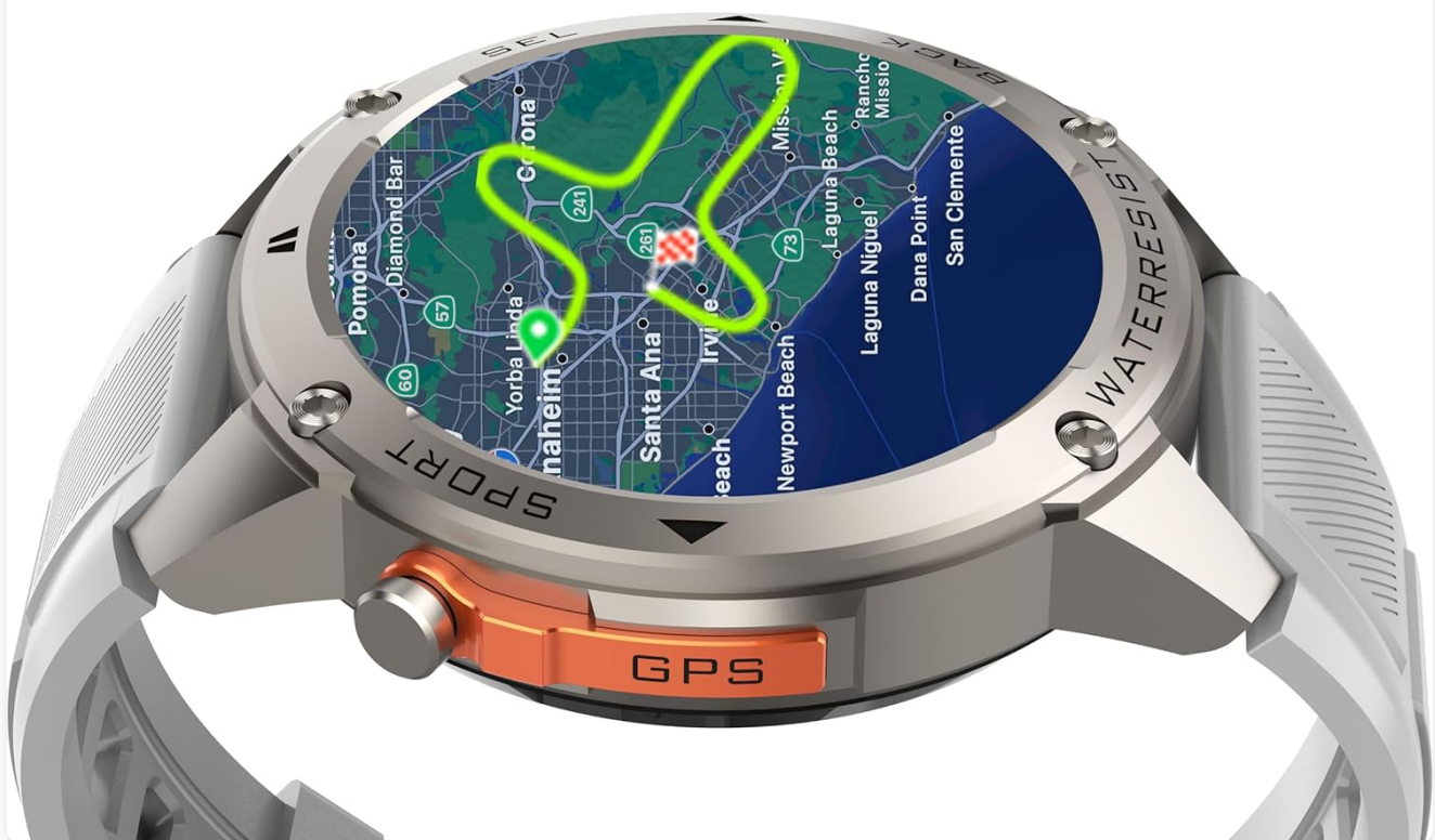
Figure 3: GPS Tracking Functionality

Note: This smartwatch has GPS tracking function, not map navigation function