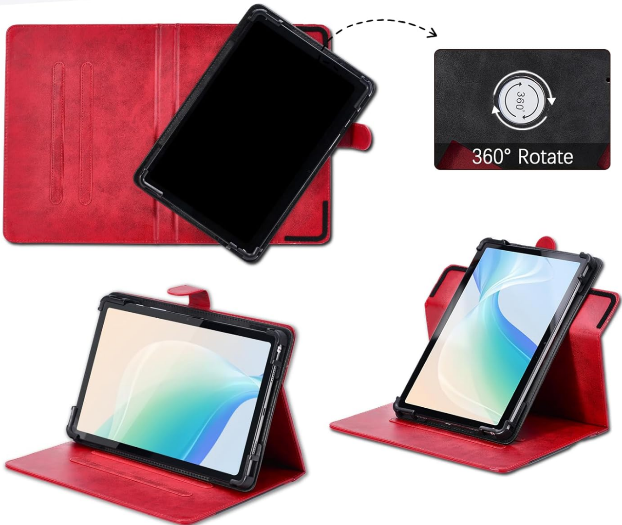
Illustration of the case's 360-degree rotation capability and how it supports multiple adjustable viewing angles for user convenience.

Supports multiple viewing angles with 360° free rotate