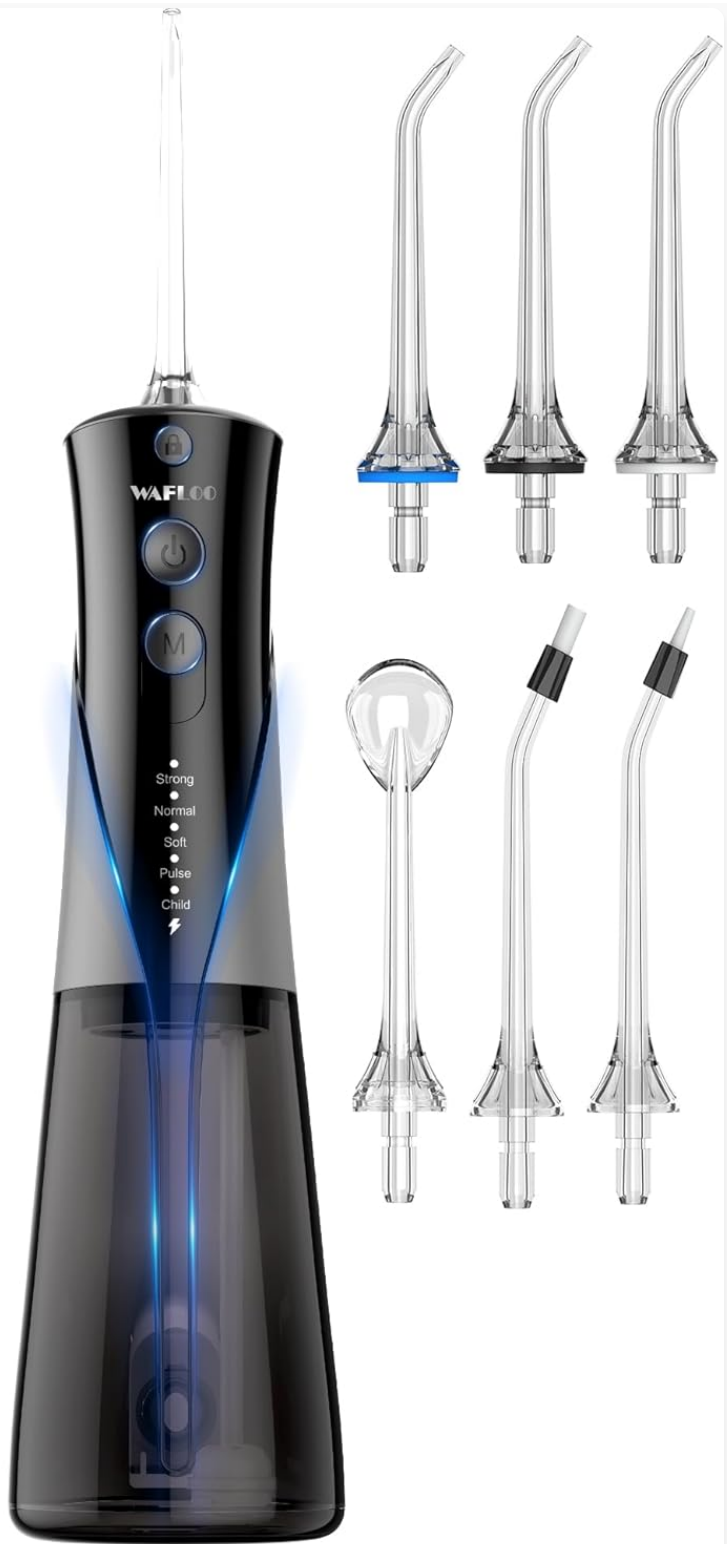
Image: The WAFLOO Water Flosser unit, six different flossing tips, and the USB-C charging cable.