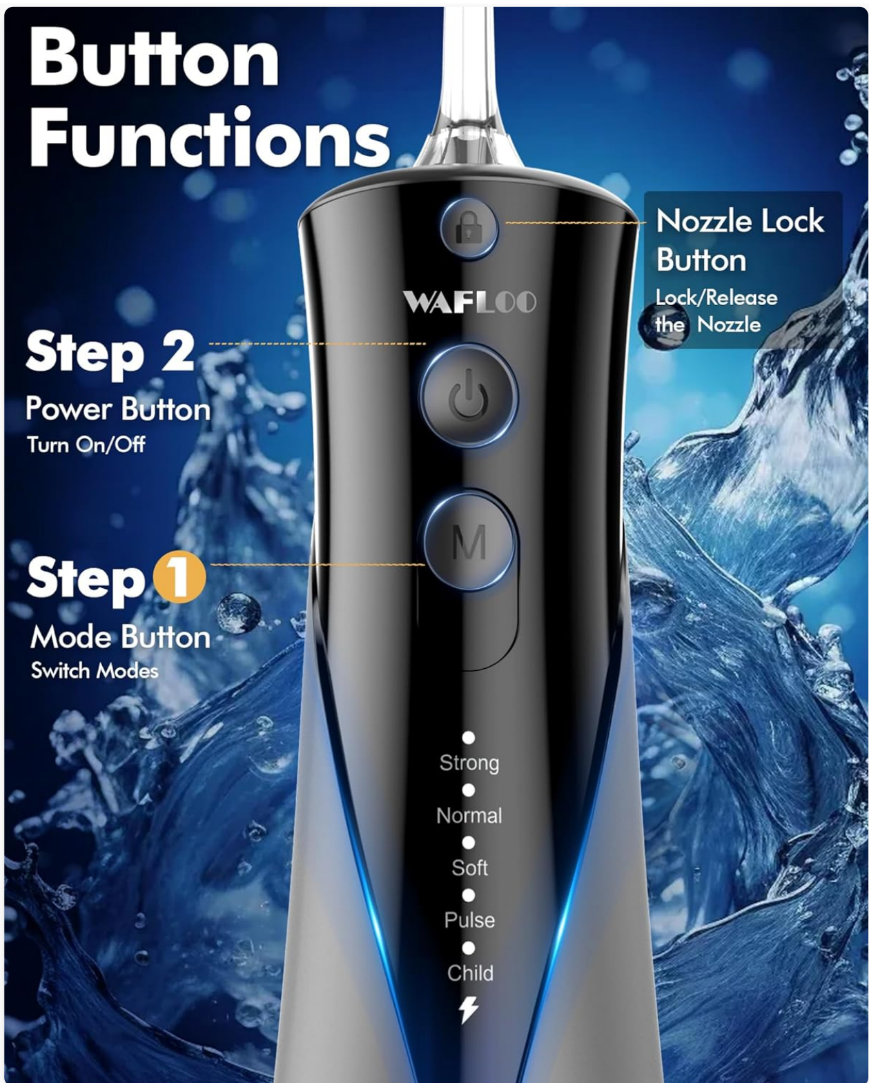
Image: A detailed view of the water flosser's control panel, highlighting the nozzle lock button, power button, and mode selection button.

Nozzle Lock Button Lock/Release the Nozzle