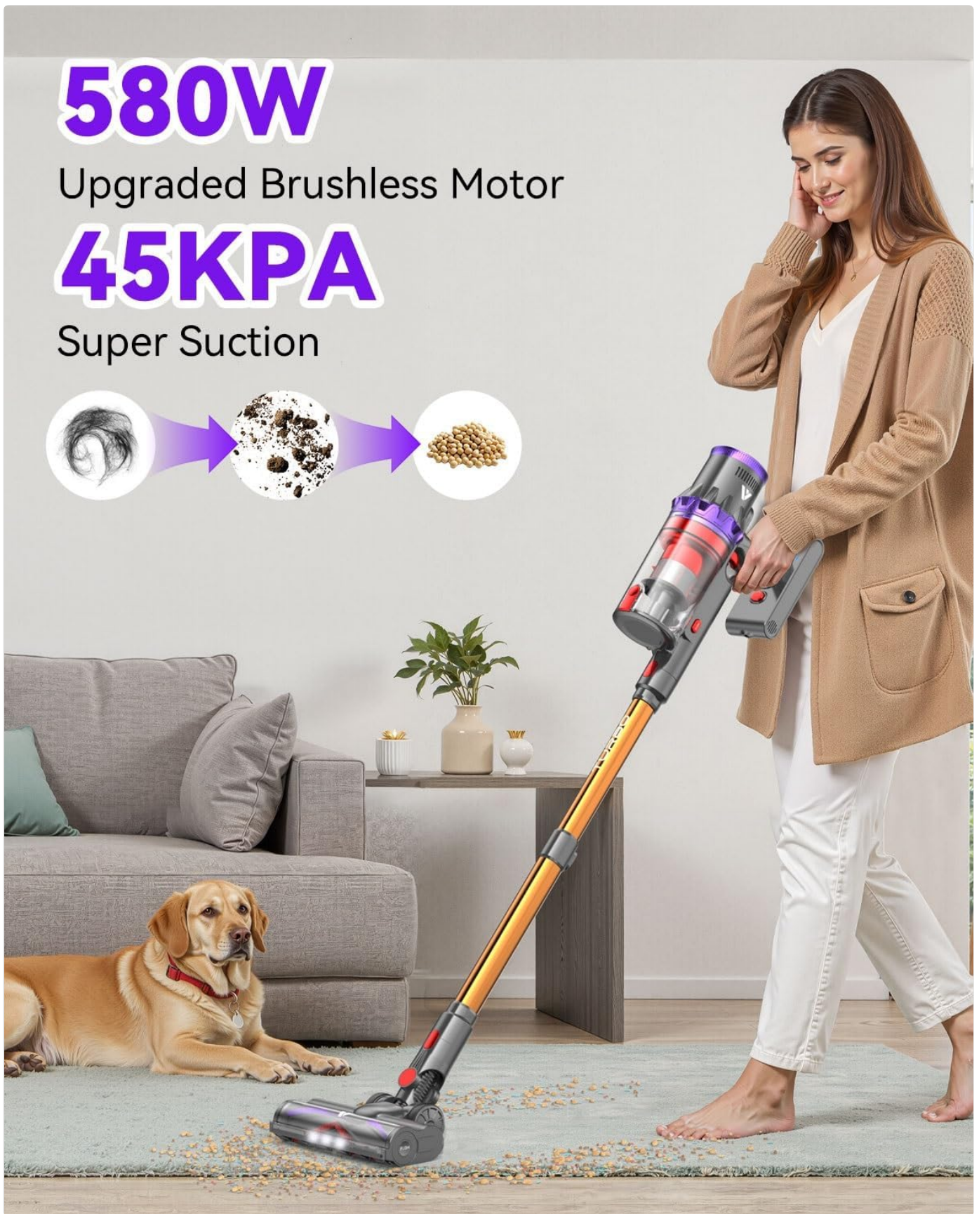
Image: A woman efficiently cleaning a carpeted area with the Coovy SU7 Cordless Vacuum Cleaner, while a dog observes nearby. This image demonstrates the vacuum's capability on soft floor surfaces and its ease of use in a home environment.