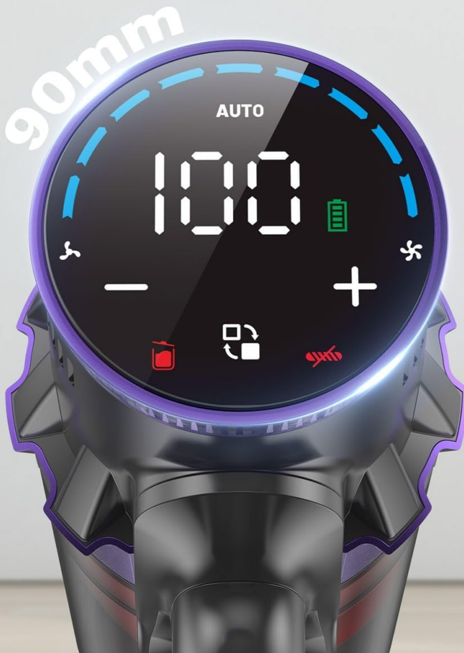
Image: A detailed close-up of the Coovy SU7 Cordless Vacuum Cleaner's large LED touchscreen. The screen clearly displays "AUTO" mode, battery percentage, and various icons for suction control and maintenance alerts, highlighting its user-friendly interface.