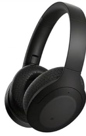
• SONY WH-H910N