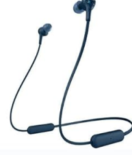
• SONY WI-XB400