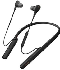
• SONY WI-1000XM2