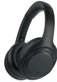
• SONY WH-1000XM4