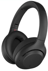
• SONY WH-XB900N