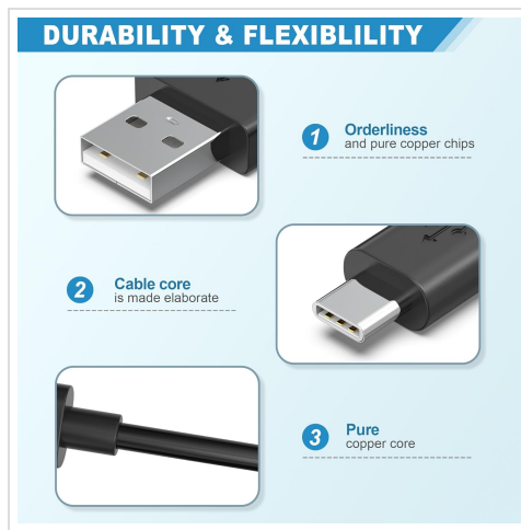
Image: Close-up view of the USB Type-A connector end of the cable.