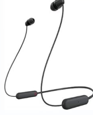
• SONY WI-C100