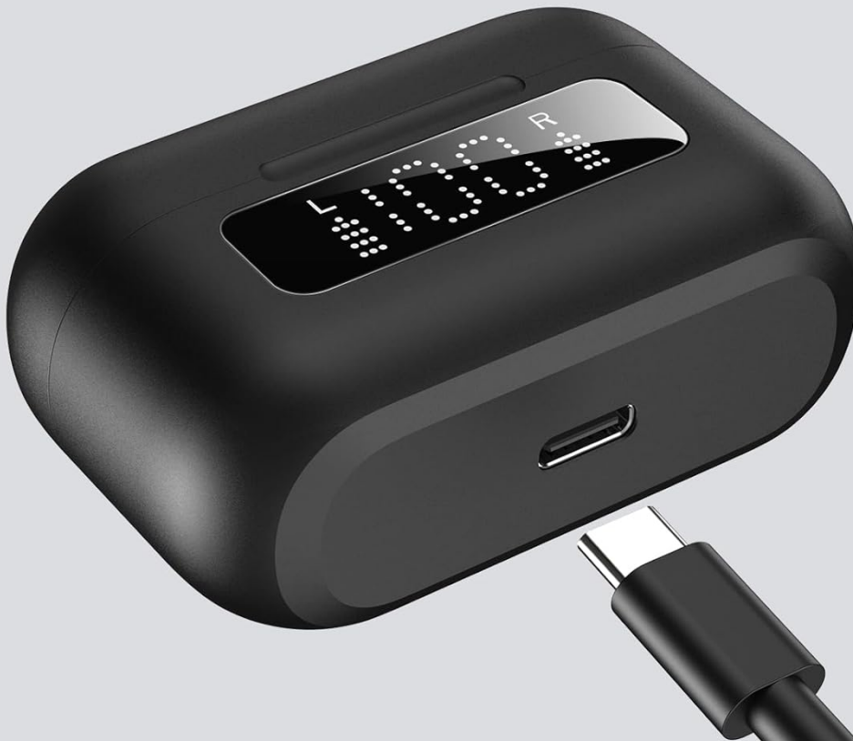
Image: Charging the TOZO NC3 Earbuds and Case.