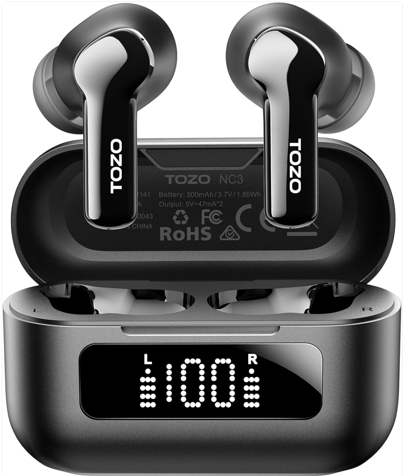
Image: TOZO NC3 Earbuds and Charging Case.