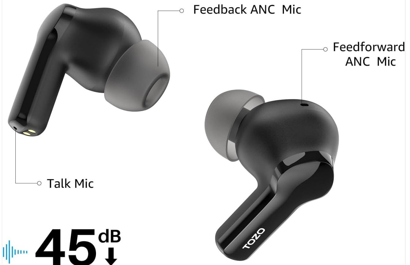
Image: Advanced Noise Cancellation Technology.

The TOZO NC3 blocks out 99.5% of noise, making it ideal for noisy environments so that you can enjoy your listening without interruption.