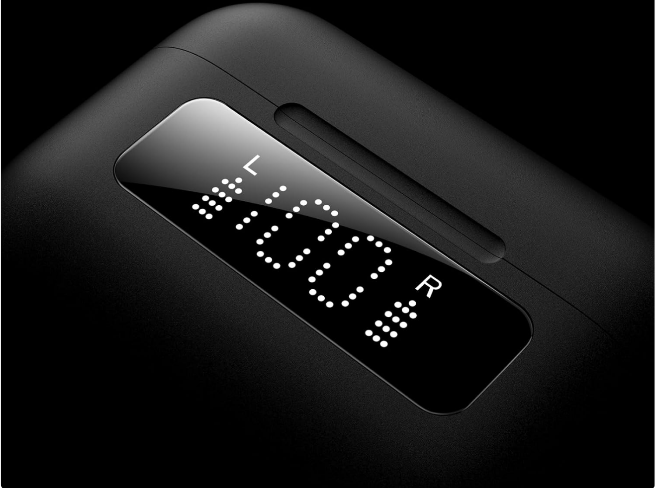
Image: Smart Digital Display on Charging Case.

Keep precise track of your battery status. Charge at the right time and say goodbye to low-battery anxiety.