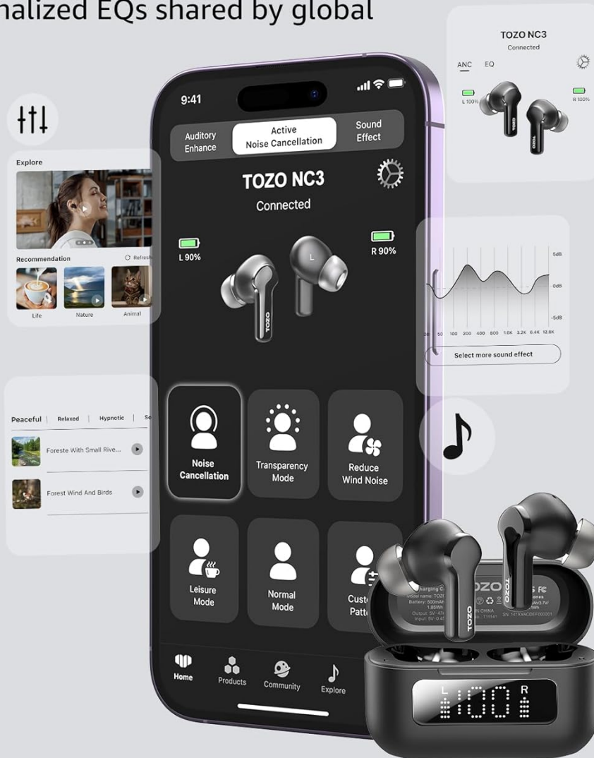
Image: TOZO App Interface.