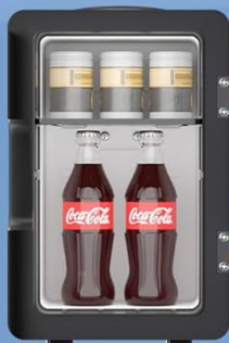
Shelf on top