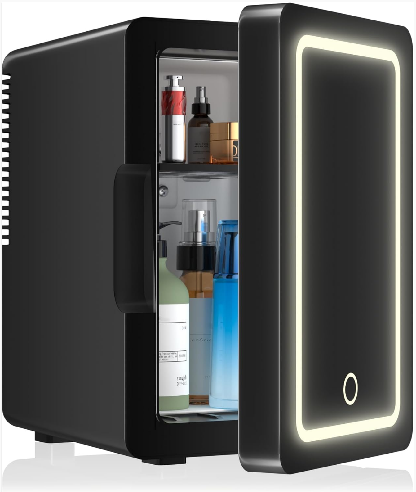
Figure 1: Front View of the Mini Fridge. This image shows the compact design of the Goodmans 6L Mini Fridge with its illuminated LED light on the door.

The Goodmans 6L Mini Fridge is a compact and efficient cooling solution. It features a sleek design, quiet operation, and adjustable storage options.