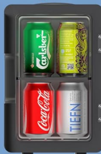
Shelf in the center