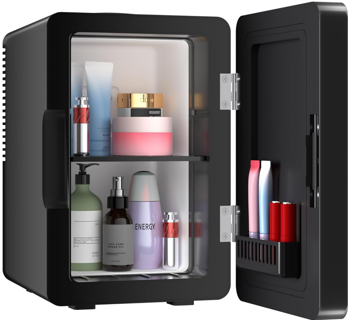
Figure 3: Interior Capacity. The image illustrates the 6-liter capacity, showcasing how skincare products and other small items can be organized inside.