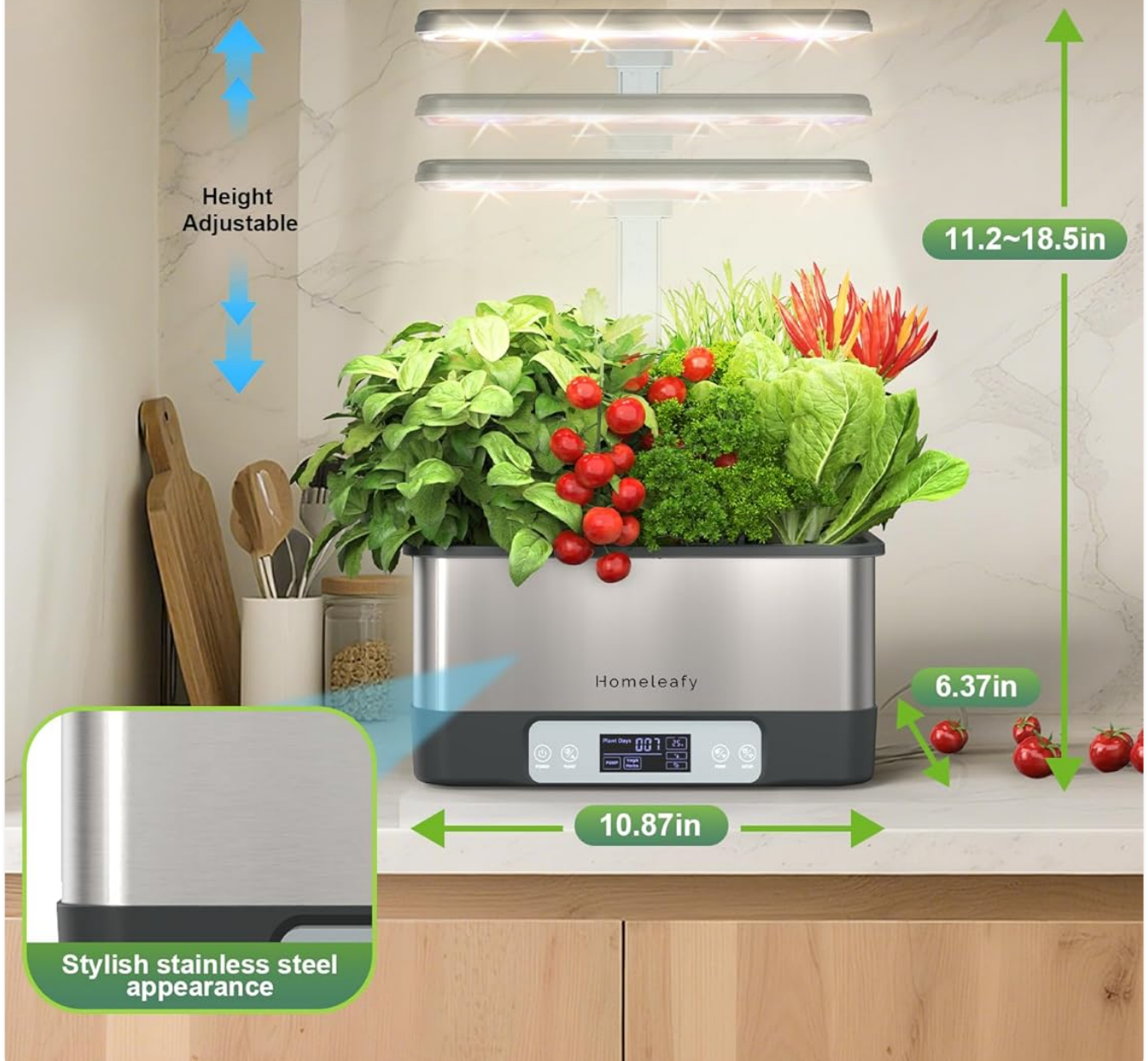
Image: The Homeleafy system demonstrating the adjustable height feature of the LED grow light, ranging from 11.2 to 18.5 inches to support plant growth.

A Modern Stainless Steel Look Makes It a Stunning Highlight in Your Space