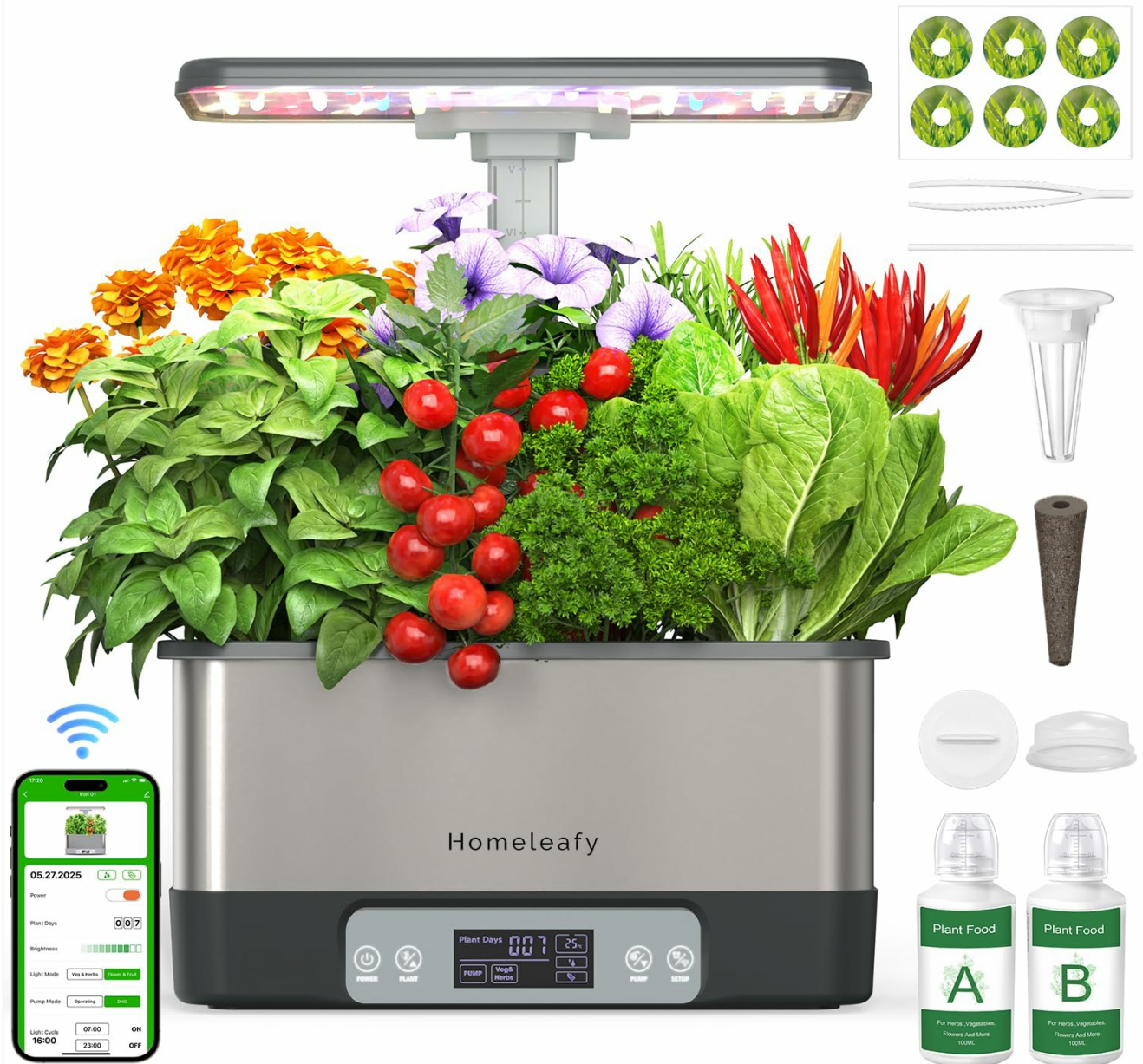
Image: The Homeleafy Hydroponics Growing System kit, showing the main unit, LED grow light, and various accessories including grow sponges, planting brackets, germination domes, nutrient solutions, and tools.