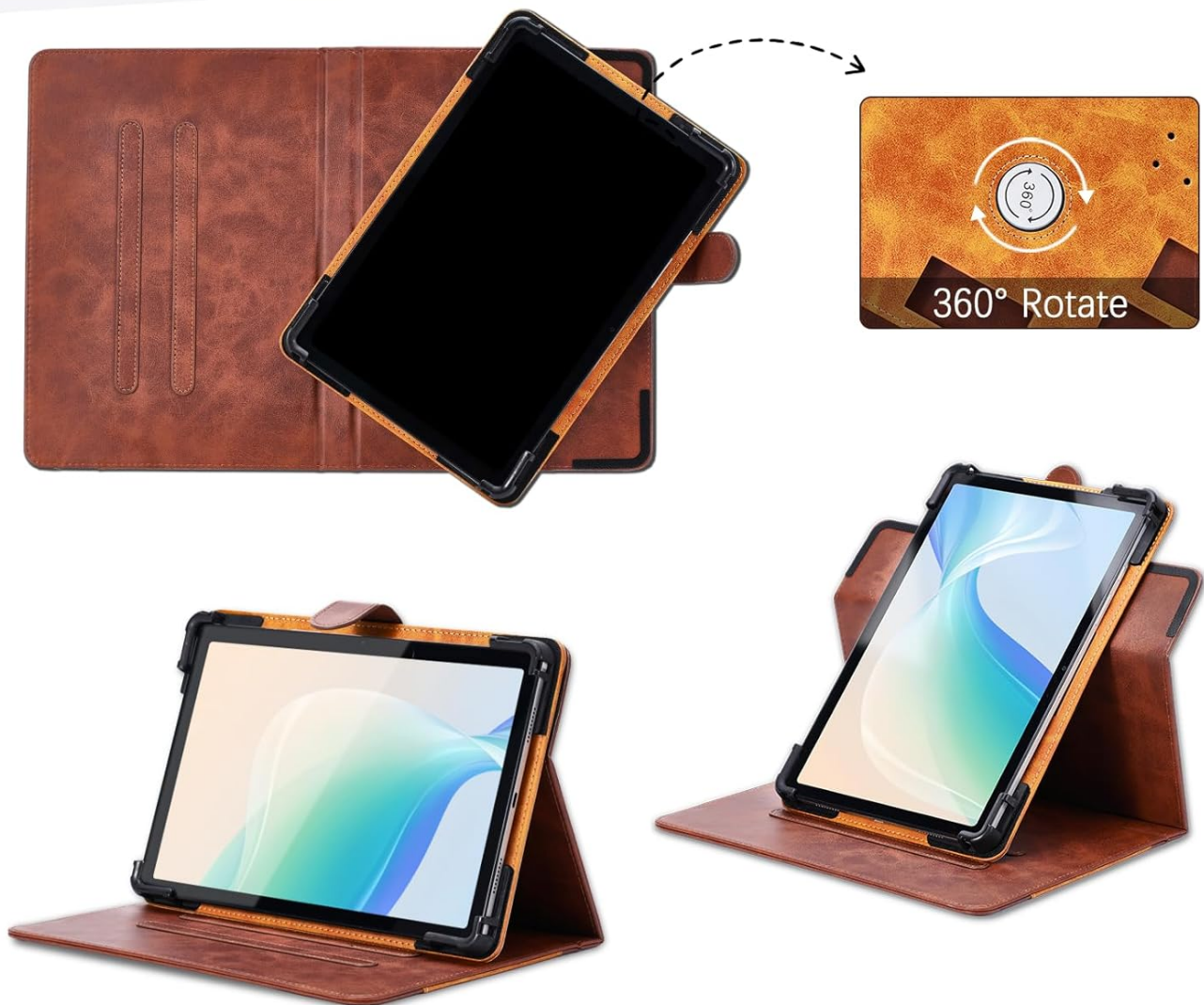
Image: Illustration of the case's 360-degree rotation capability and various adjustable viewing angles for optimal user experience.

Supports multiple viewing angles with 360° free rotate