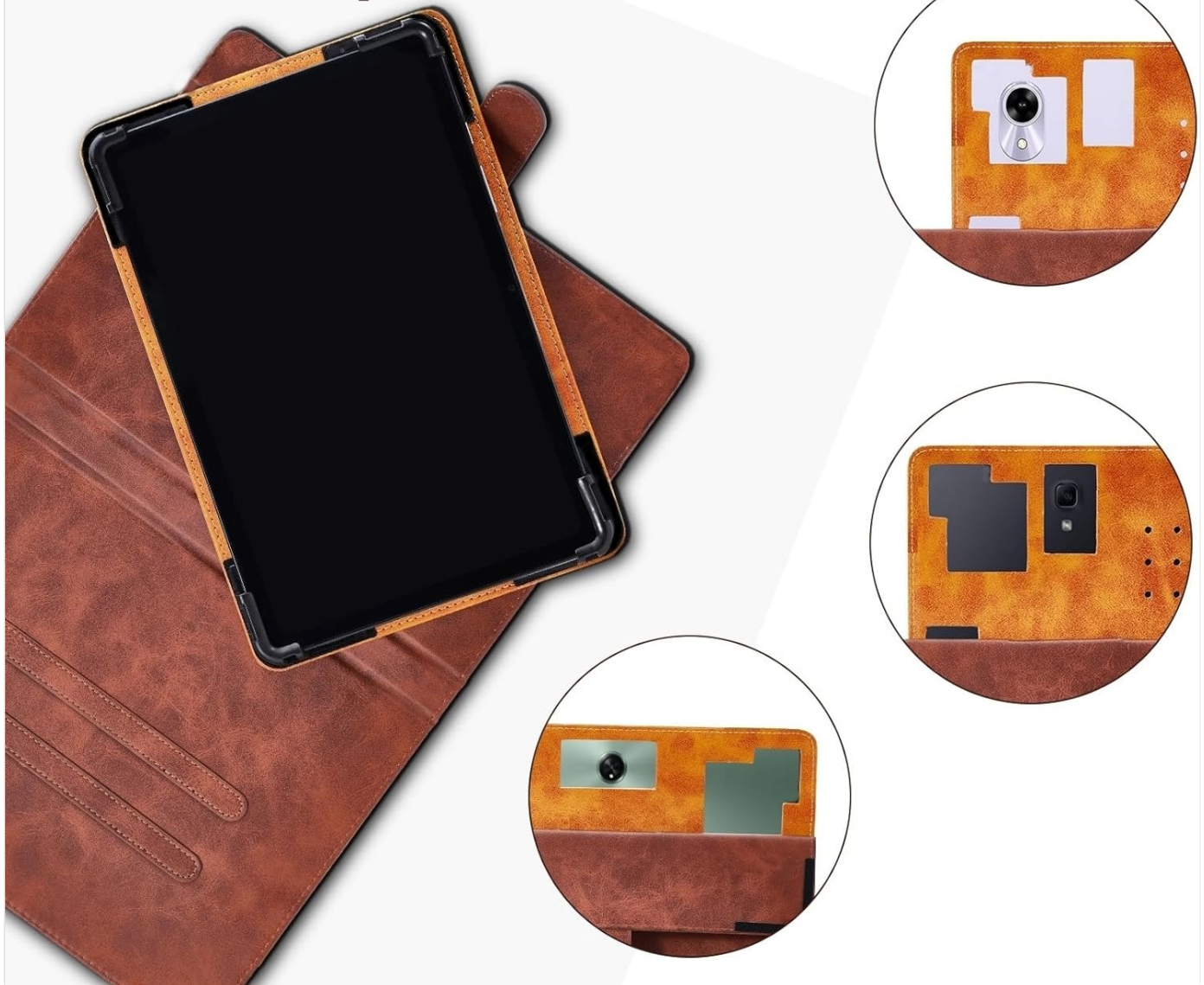
Image: Detailed view of the case's camera cutouts, designed to accommodate various camera positions on compatible tablets.

The 3 pre-cutouts can be used by tablets with different camera positions